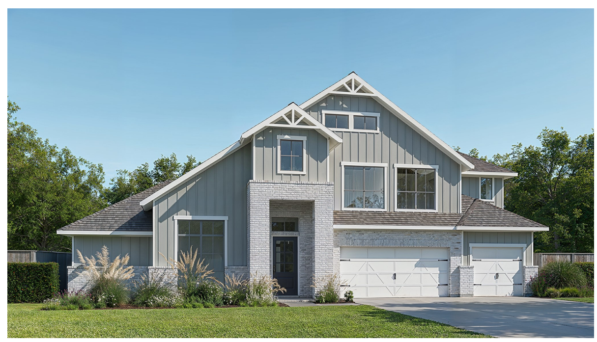
DESIGN 4418B E-1