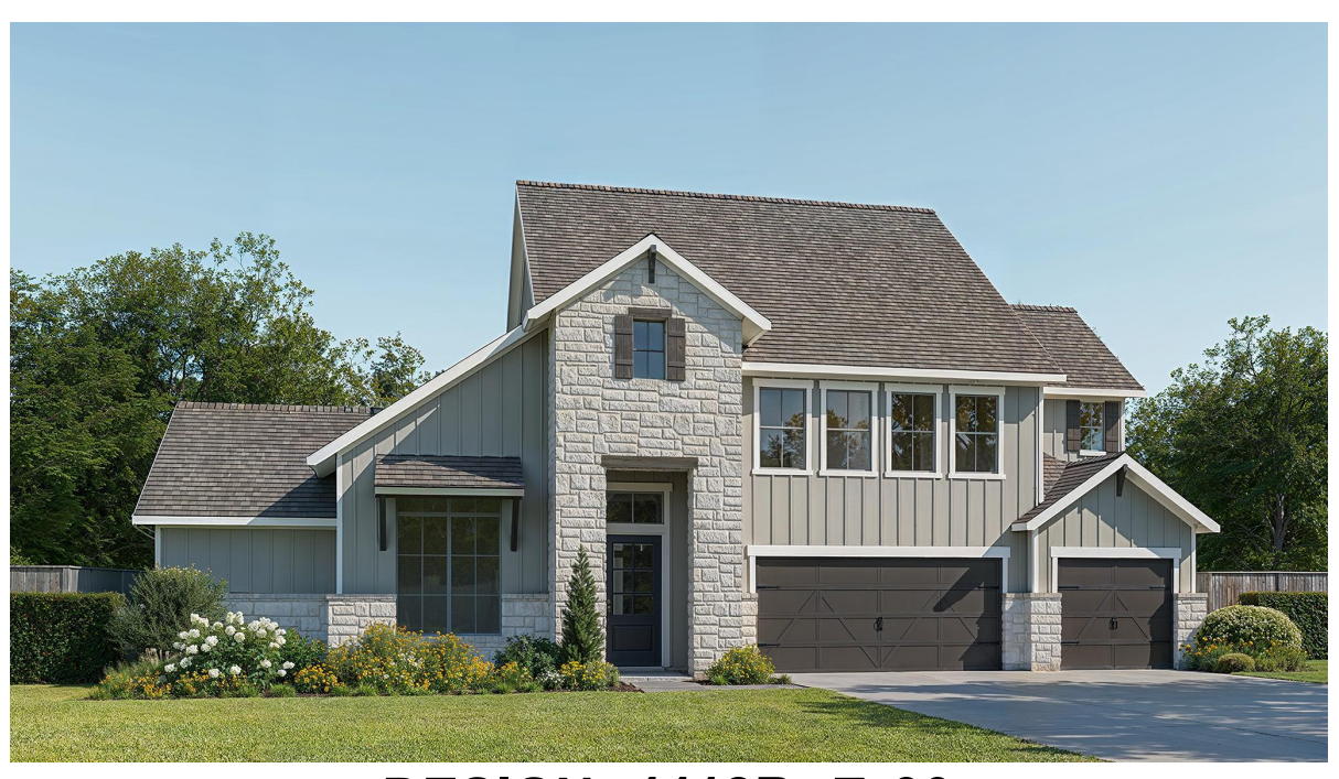
DESIGN 4418B E-90

This design, as originally designed and prior to any changes you make, is estimated to yield approximately the number of square feet shown on page 1. All dimensions are approximate. Square footage may vary based on as-built dimensions, configurations, plan options and/or the method of calculation. Designs are not-to-scale, and are conceptual illustrations that may differ from construction plans or completed improvements. A design may depict features not available on all homesites or in all communities. Perry Homes reserves the right to make changes in plans and specifications, and to substitute material of similar quality. Prices, terms, promotions, plans, dimensions, features, options, amenities, elevations, designs, square footages, specifications, materials, and availability of homes or communities are subject to change without notice or obligation. All obligations will be governed by a written contract. This design does not constitute a commitment to build a particular floor plan or home in any given community Some floor plans, options, and/or elevations may not be available on certain homesites or in a particular community and may require additional charges. Please check with Perry Homes to verify current offerings in the communities are considering. This rendering is the property of Perry Homes. LLC. Any reproduction or exhibition is strictly prohibited @ Perry Homes LLC. 2024