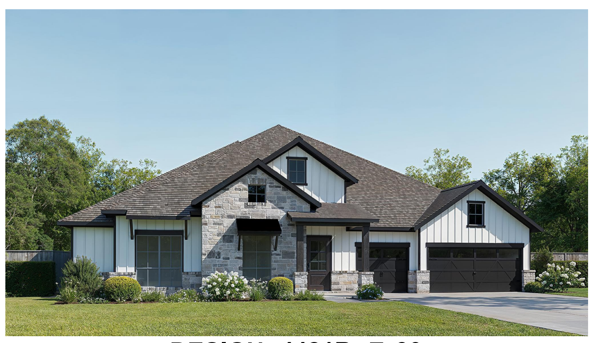
DESIGN 4421B E-30

This design, as originally designed and prior to any changes you make, is estimated to yield approximately the number of square feet shown on page 1. All dimensions are approximate. Square footage may vary based on as-built dimensions, configurations, plan options and/or the method of calculation. Designs are not-to-scale, and are conceptual illustrations that may differ from construction plans or completed improvements. A design may depict features not available on all homesites or in all communities. Perry Homes reserves the right to make changes in plans and specifications, and to substitute material of similar quality. Prices, terms, promotions, plans, dimensions, features, options, amenities, elevations, designs, square footages, specifications, materials, and availability of homes or communities to change without notice or obligation. All obligations will be governed by a written contract. This design does not constitute a commitment to build a particular floor plan or home in any given community. Some floor plans, options, and/or elevations may not be available on certain homesites or in a particular community and may require additional charges. Please check with Perry Homes to verify current offerings in the communities and are considering. This rendering is the property of Perry Homes. LLC. Any reproduction or exhibition is strictly prohibited @ Perry Homes LLC. 2019