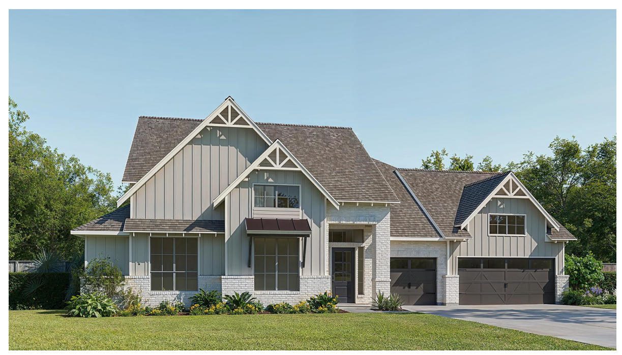
DESIGN 4421B E-1