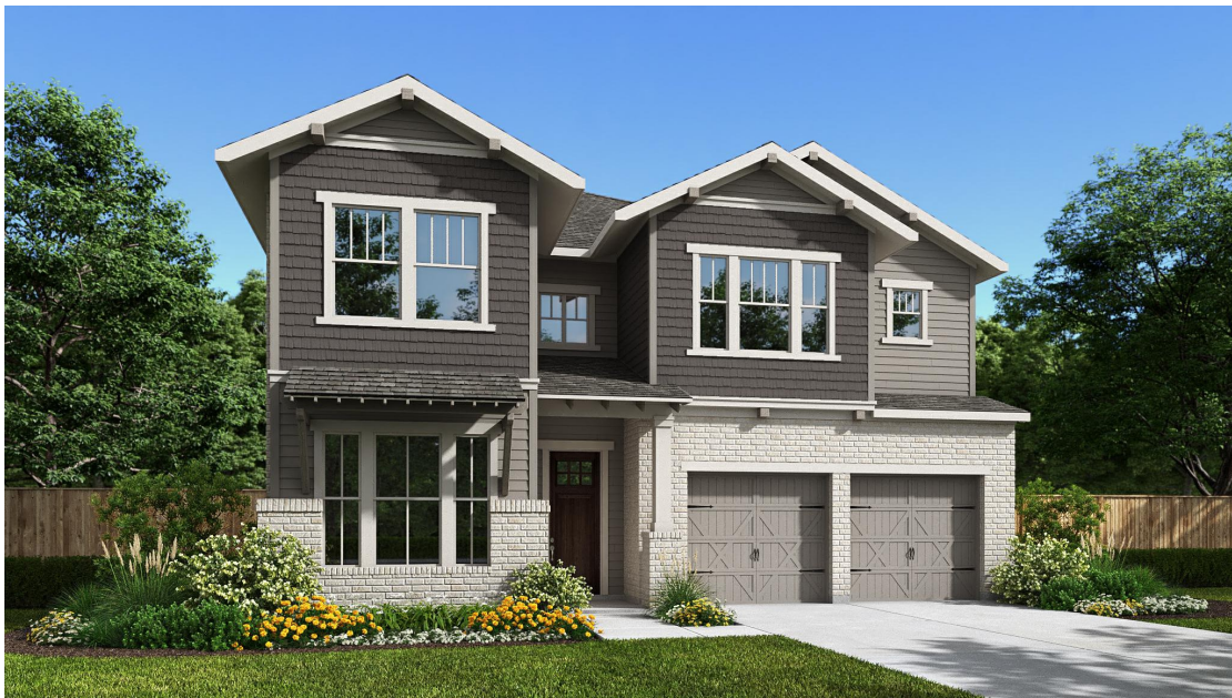
DESIGN 443A E-50