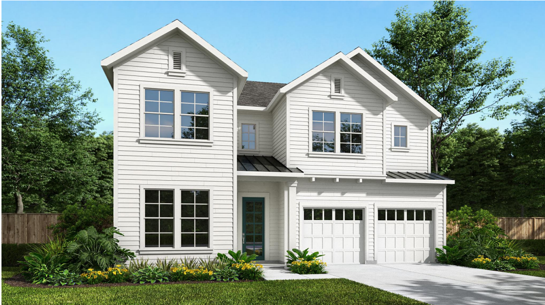
DESIGN 443A E-1