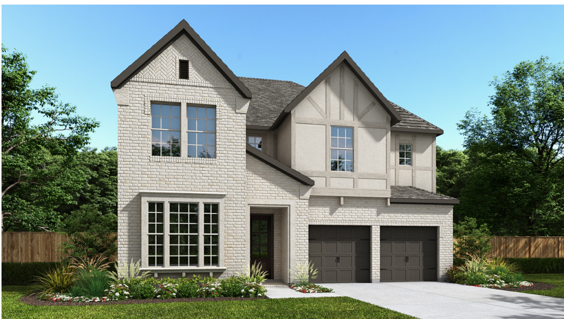
DESIGN 443A E-70

*See Elevation Page(s) for Details and Disclaimers. © Perry Homes, LLC 2024