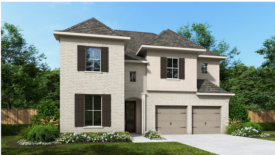
DESIGN 443A E-100