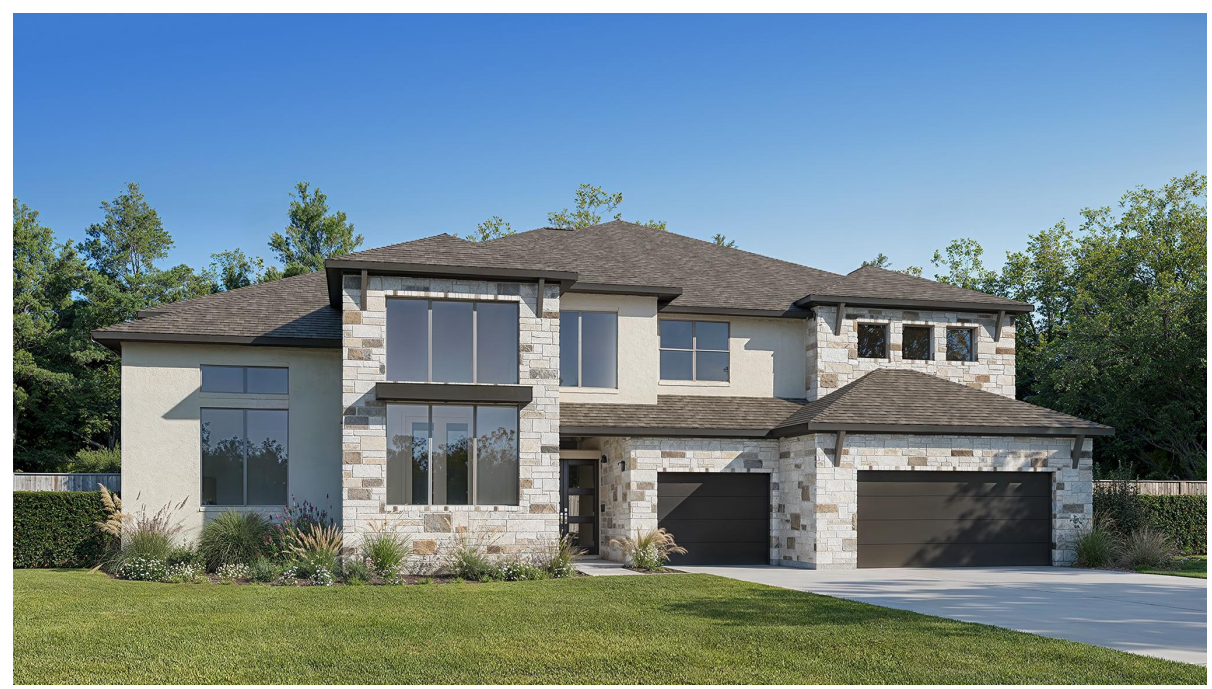
DESIGN 5573S E-1