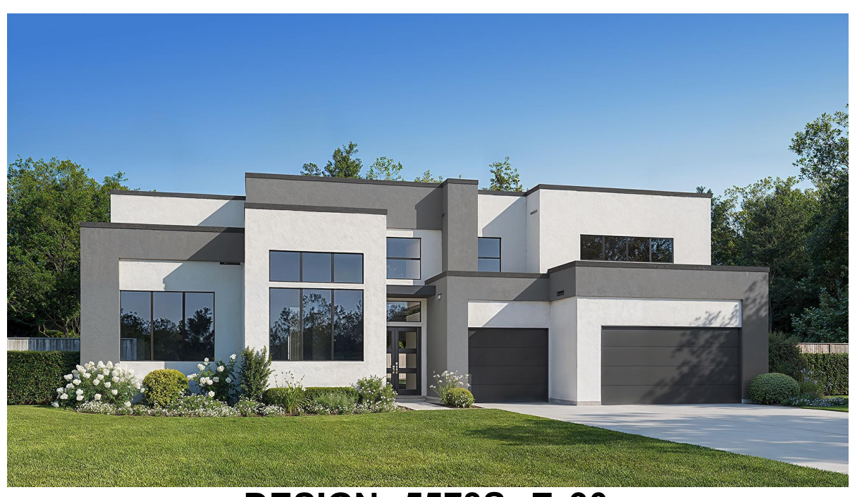
DESIGN 5573S E-90

This design, as originally designed and prior to any changes you make, is estimated to yield approximately the number of square feet shown on page 1. All dimensions are approximate. Square footage may vary based on as-built dimensions, configurations, plan options and/or the method of calculation. Designs are not-to-scale, and are conceptual illustrations that may differ from construction plans or completed improvements. A design may depict features not available on all homesites or in all communities. Perry Homes reserves the right to make changes in plans and specifications, and to substitute material of similar quality. Prices, terms, promotions, plans, dimensions, features, options, amenities, elevations, designs, square footages, specifications, materials, and availability of homes or communities are subject to change without notice or obligation. All obligations will be governed by a written contract. This design does not constitute a commitment to build a particular floor plan or home in any given community Some floor plans, options, and/or elevations may not be available on certain homesites or in a particular community and may require additional charges. Please check with Perry Homes to verify current offerings in the communities are considering. This rendering is the property of Perry Homes. LLC. Any reproduction or exhibition is strictly prohibited @ Perry Homes LLC. 2025