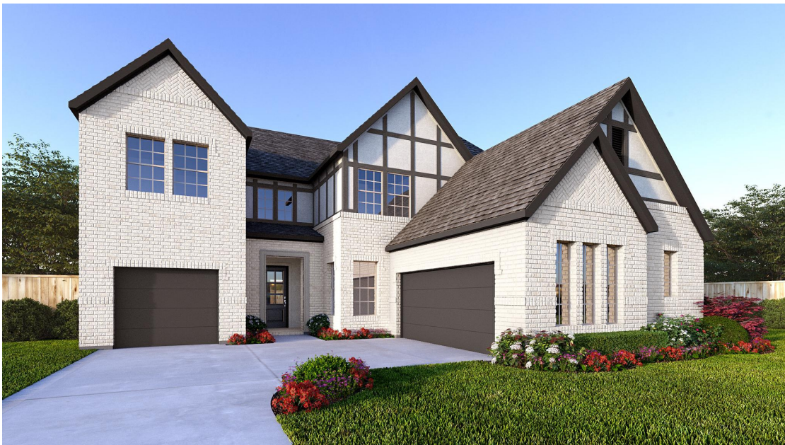
DESIGN 567A E-101