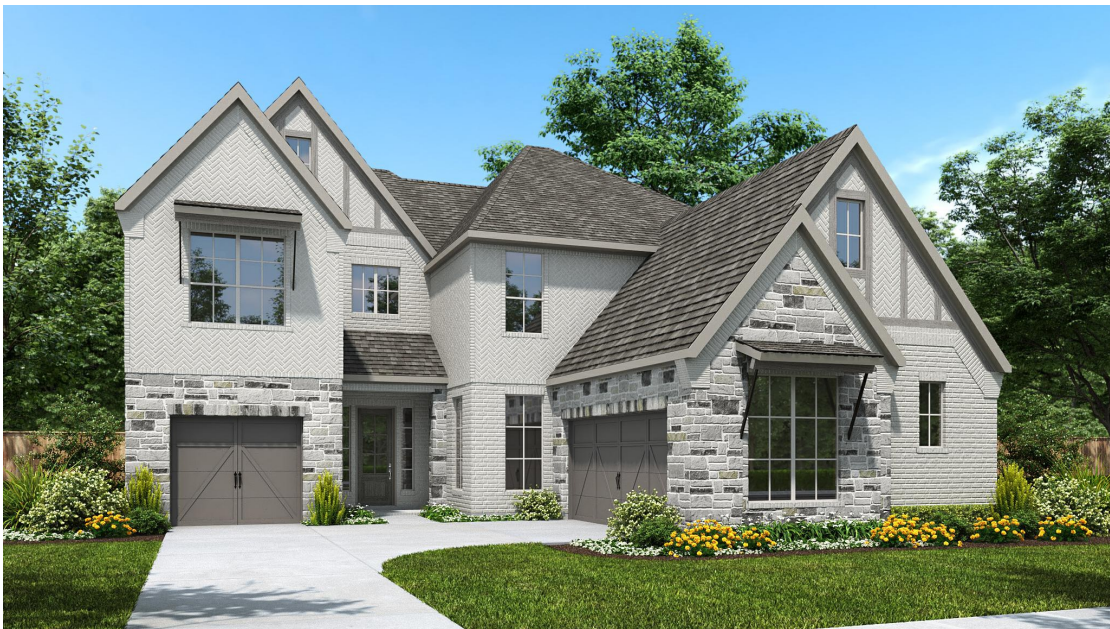
DESIGN 567A E-103