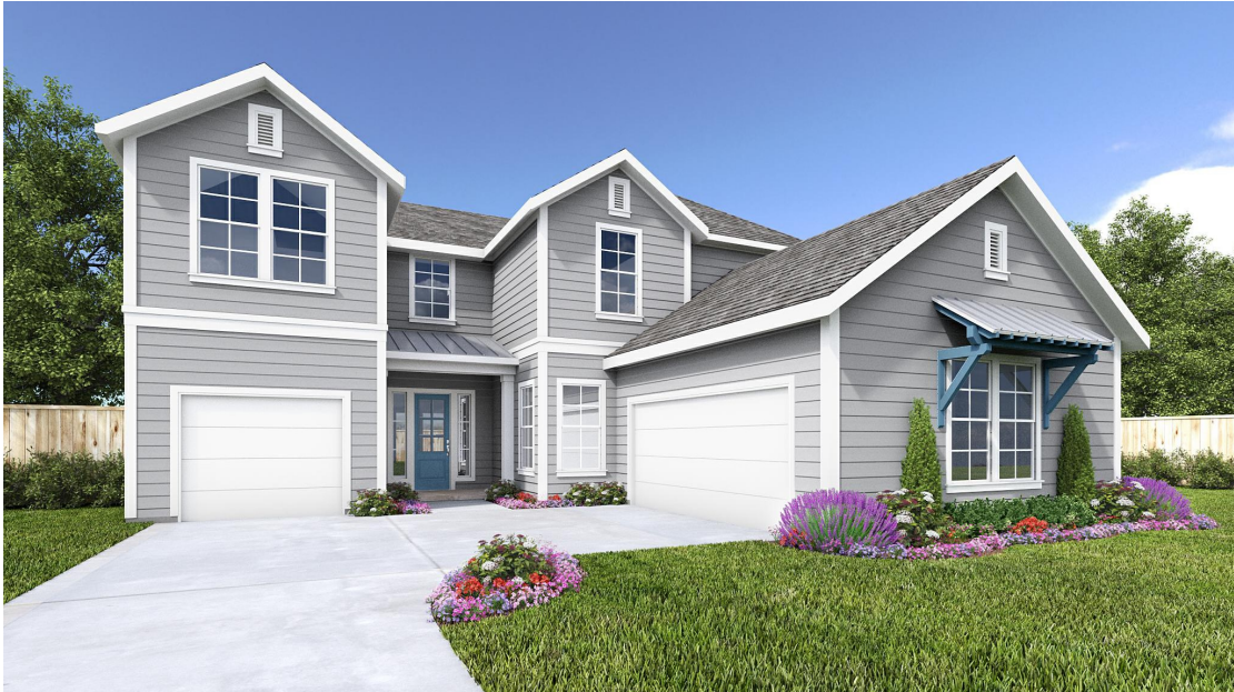
DESIGN 567A E-1