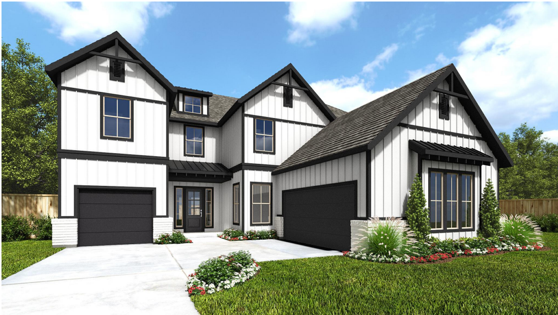
DESIGN 567A E-50