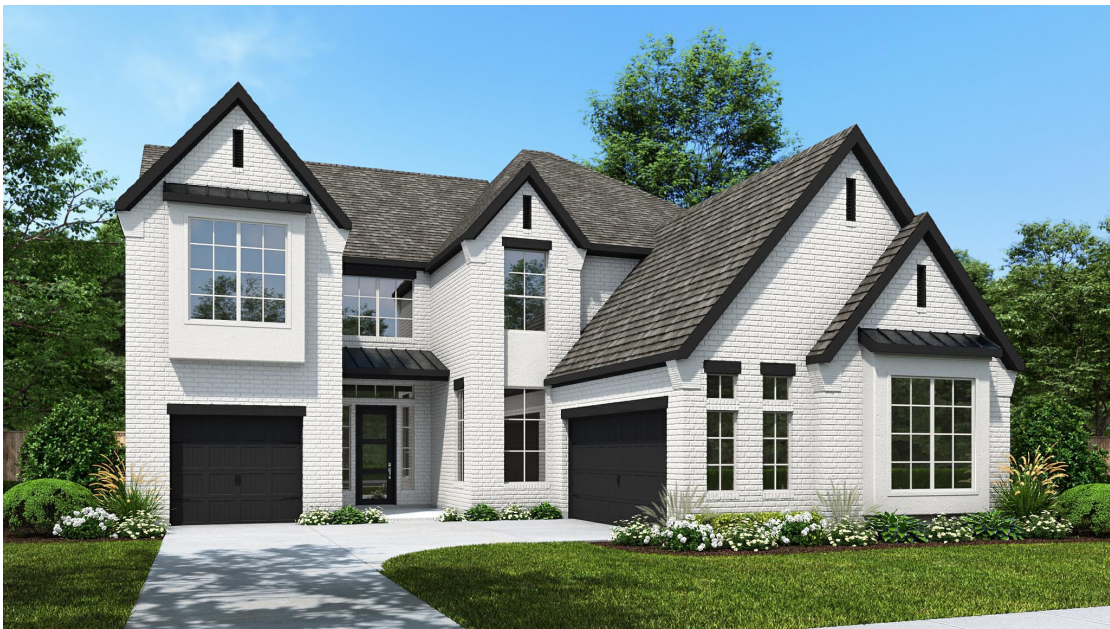
DESIGN 567A E-102