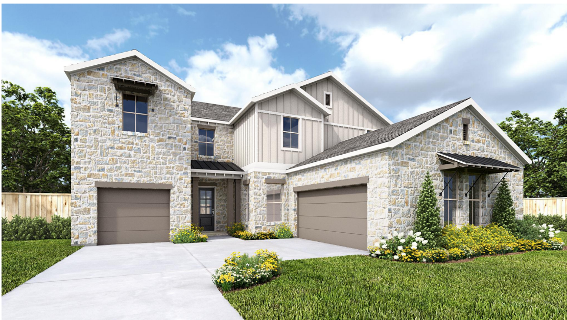
DESIGN 567A E-100