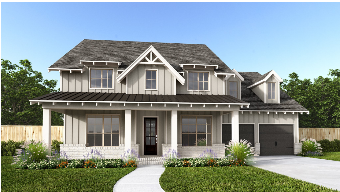
DESIGN 585A E-100