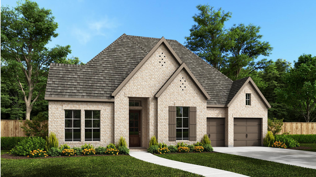
DESIGN 585A E-1