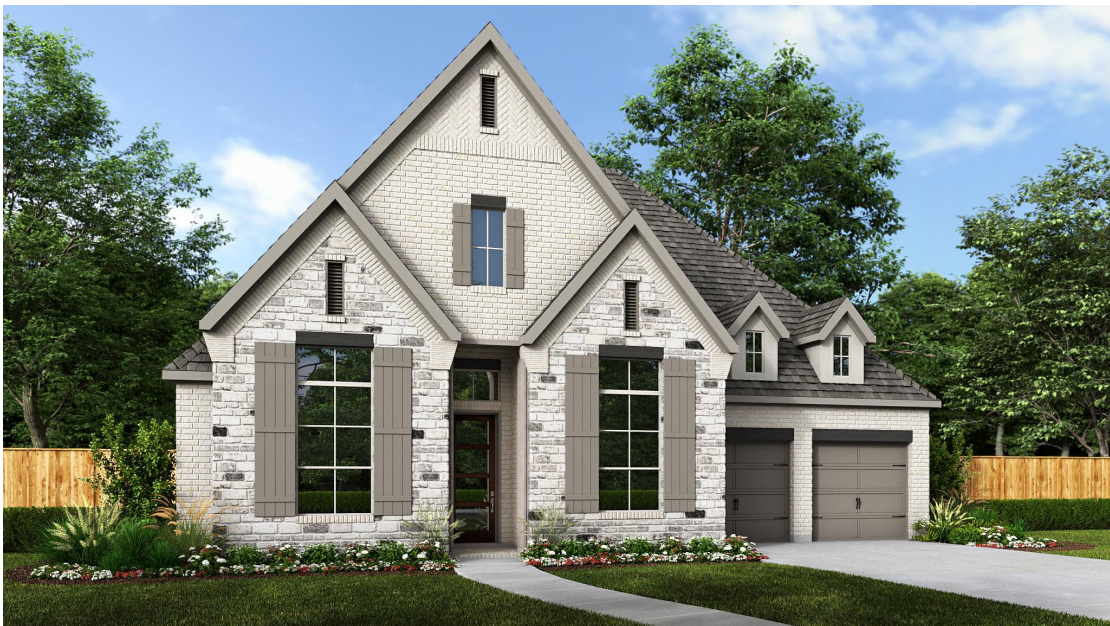
DESIGN 585A E-71