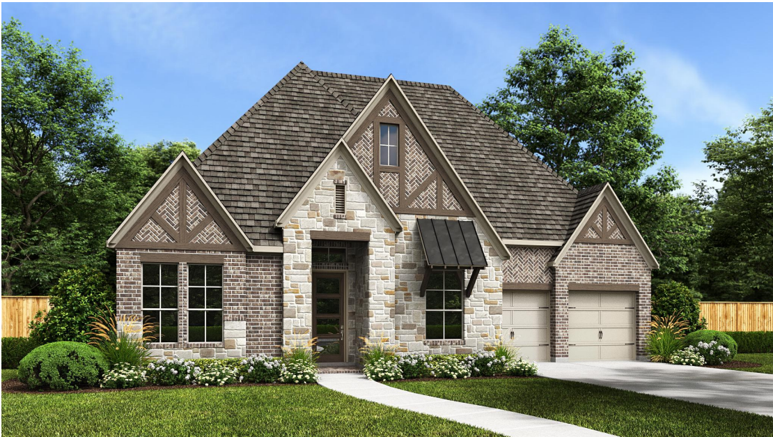
DESIGN 585A E-70