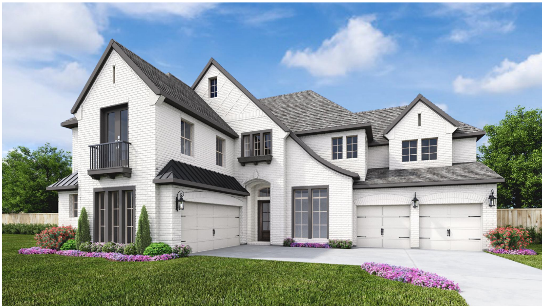
DESIGN 644A E-1