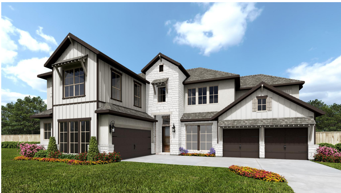
DESIGN 644A E-50