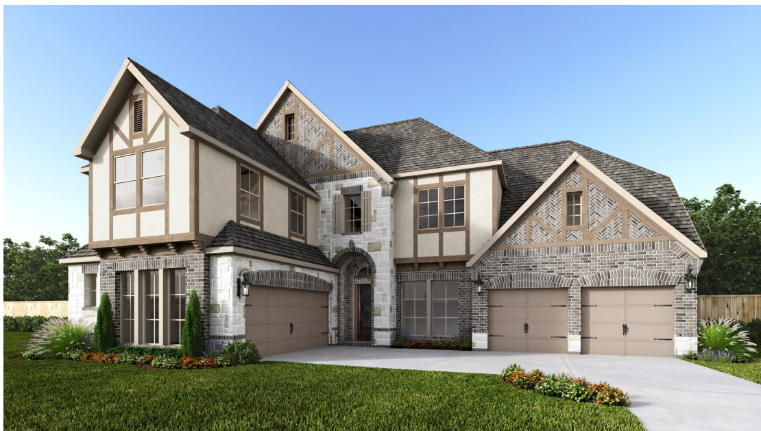
DESIGN 644A E-70