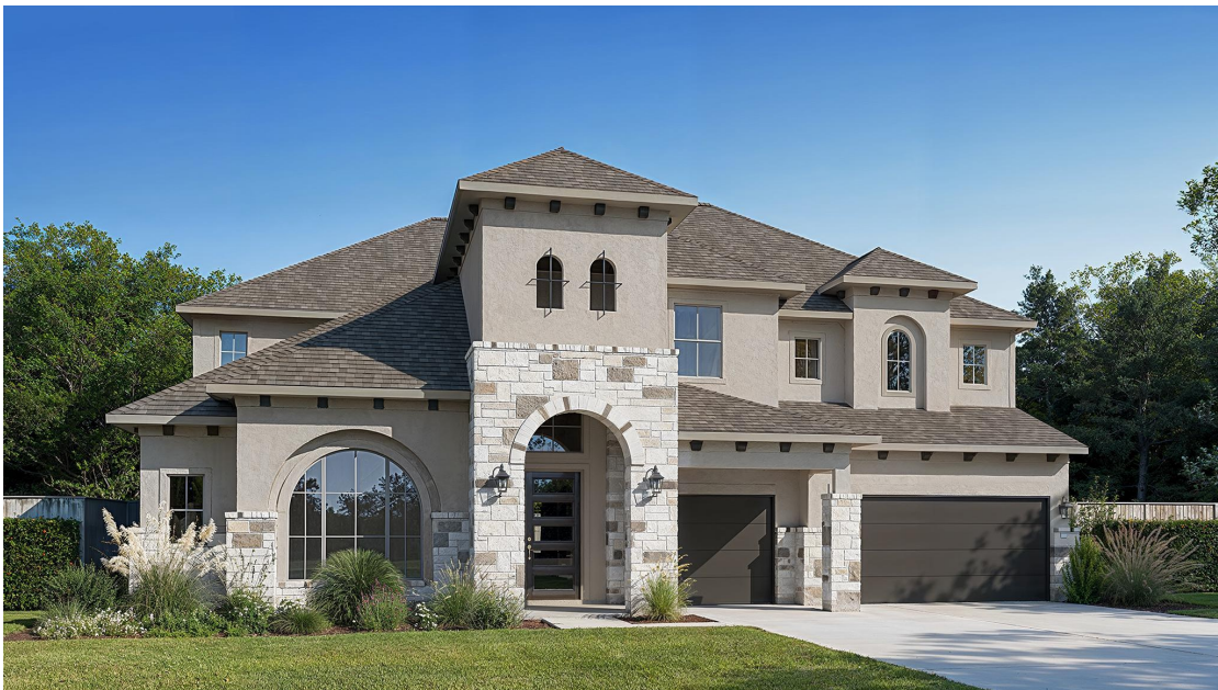
DESIGN 656A E-100