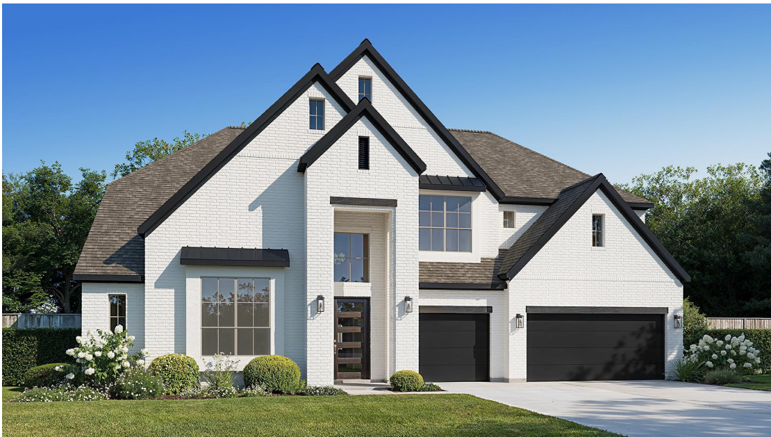
DESIGN 656A E-30