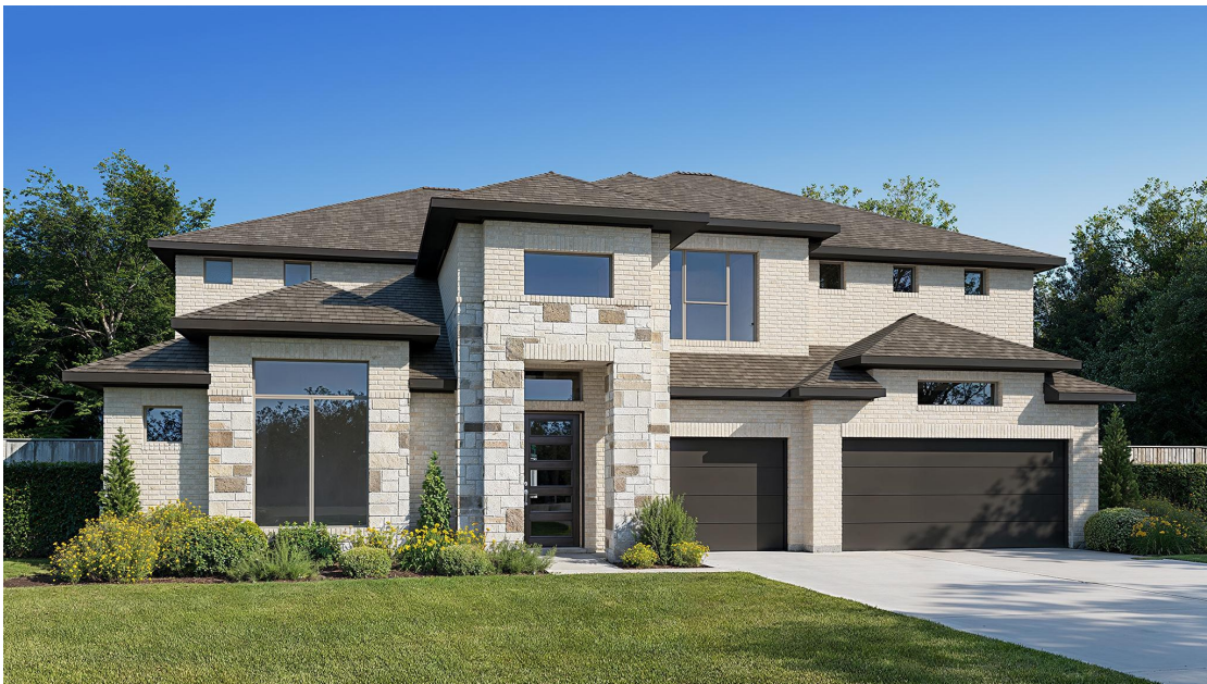
DESIGN 656A E-1