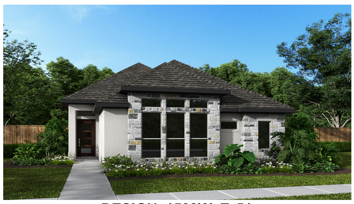
DESIGN 1503W E-51

This design, as originally designed and prior to any changes you make, is estimated to yield approximately the number of square feet shown on page 1. All dimensions are approximate. Square footage may vary based on as-built dimensions, configurations, plan options and/or the method of calculation. Designs are not-to-scale, and are conceptual illustrations that may differ from construction plans or completed improvements. A design may depict features not available on all homesites or in all communities. Perry Homes reserves the right to make changes in plans and specifications, and to substitute material or similar quality. Prices, terms, promotions, plans, dimensions, features, options, amenities, elevations, designs, square footages, specifications, materials, and availability of homes or communities are subject to change without notice or obligation. All obligations will be governed by a written contract. This design does not constitute a commitment to build a particular floor plan or home in any given community some plans, options, and/or elevations may not be available on certain homesites or in a particular community and may require additional charges. Please check with Perry Homes to verify current offerings in the communities you are considering. This rendering is the property of Perry Homes, LLC. Any reproduction or exhibition is strictly prohibited. © Perry Homes, LLC 2024