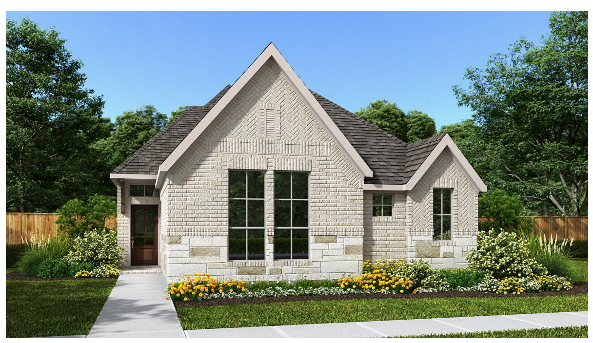
DESIGN 1503W E-30