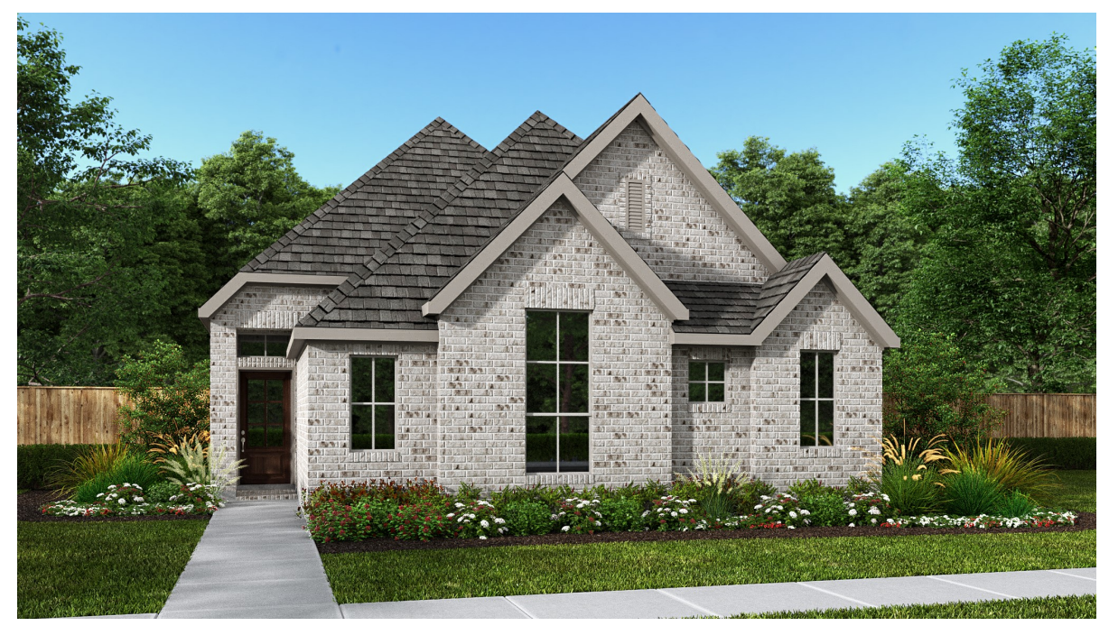
DESIGN 1503W E-1