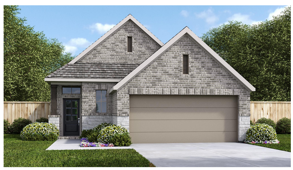
DESIGN 1593W E-50