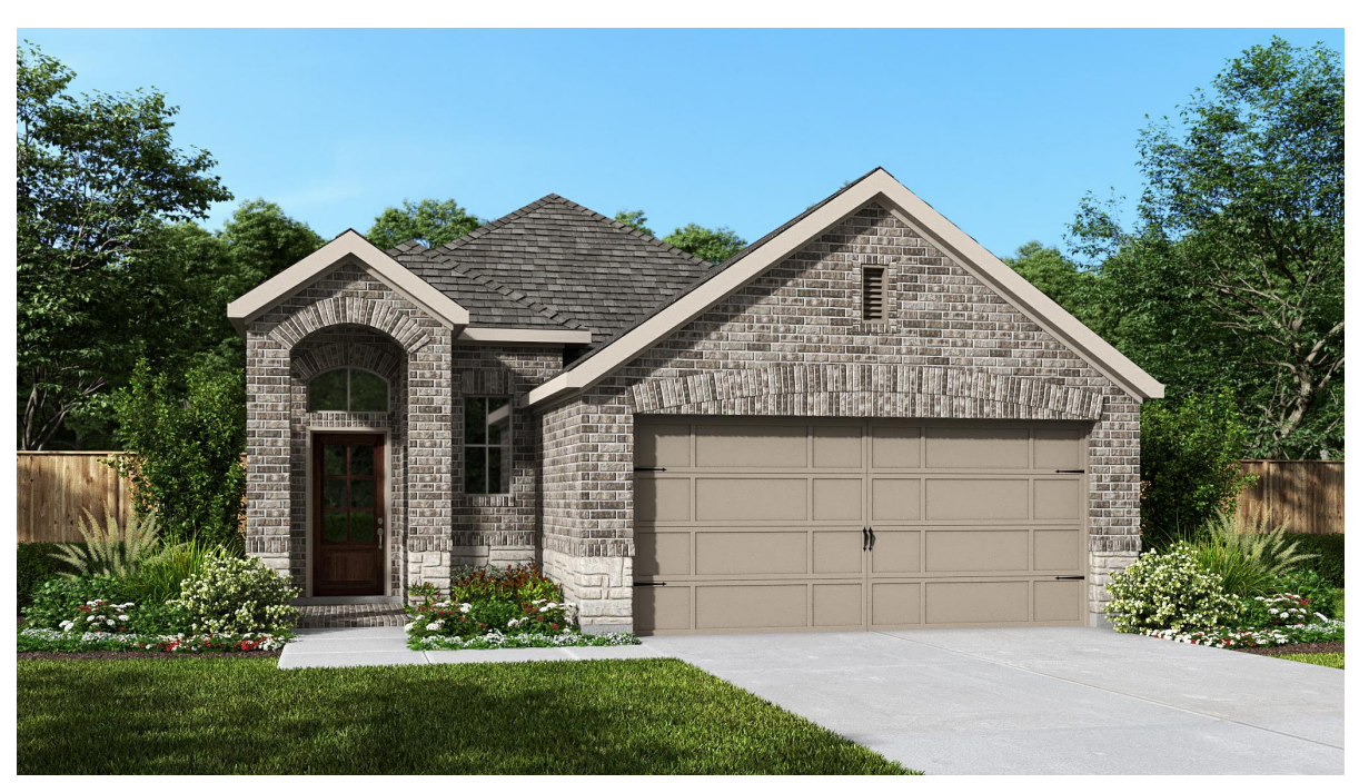
DESIGN 1593W E-30