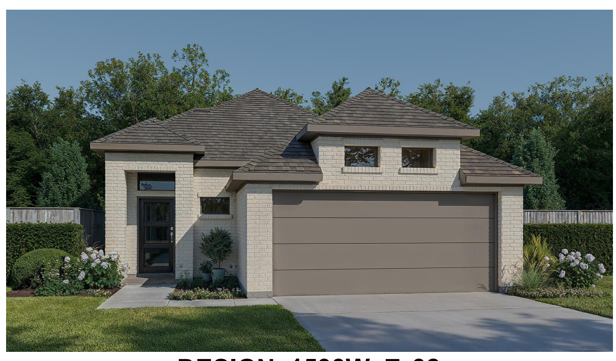
DESIGN 1593W E-32