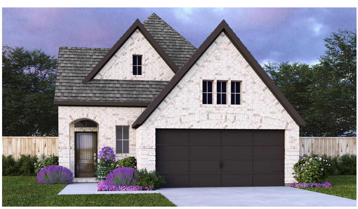
DESIGN 1593W E-71

This design, as originally designed and prior to any changes you make, is estimated to yield approximately the number of square feet shown on page 1. All dimensions are approximate. Square footage may vary based on as-built dimensions, configurations, plan options and/or the method of calculation. Designs are not-to-scale, and are conceptual illustrations that may differ from construction plans or completed improvements. A design may depict features not available on all homesites or in all communities. Perry Homes reserves the right to make changes in plans and specifications, and to substitute material of similar quality. Prices, terms, promotions, plans, dimensions, features, options, amenities, elevations, designs, square footages, specifications, materials, and availability of homes or communities to change without notice or obligation. All obligations will be governed by a written contract. This design does not constitute a commitment to build a particular floor plan or home in any given community. Some floor plans, options, and/or elevations may not be available on certain homesites or in a particular community and may require additional charges. Please check with Perry Homes to verify current offerings in the communities and are considering. This rendering is the property of Perry Homes. LLC. Any reproduction or exhibition is strictly prohibited @ Perry Homes LLC. 2019