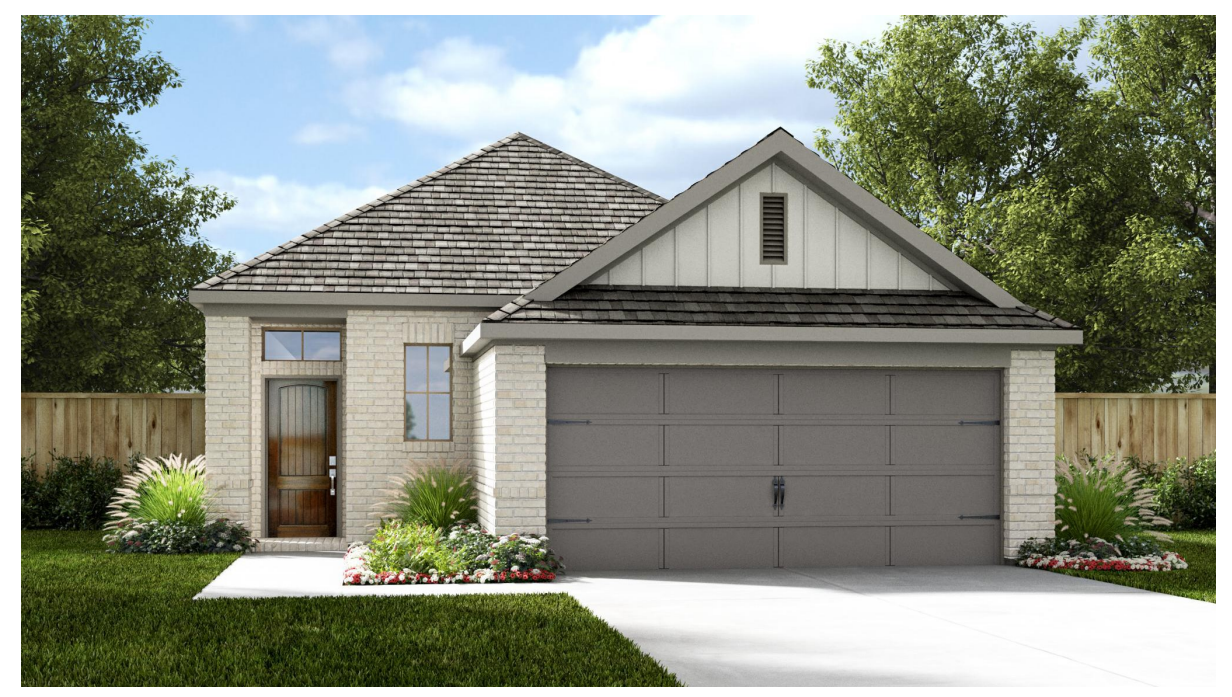
DESIGN 1593W E-1