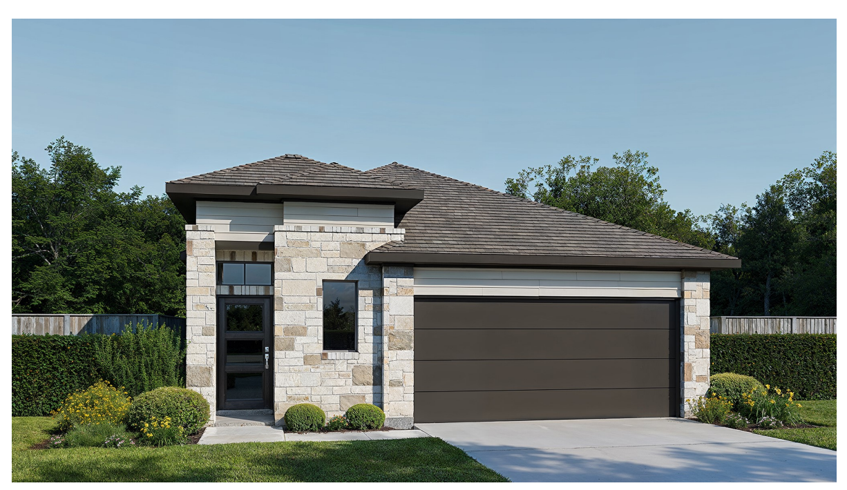
DESIGN 1844E E-30