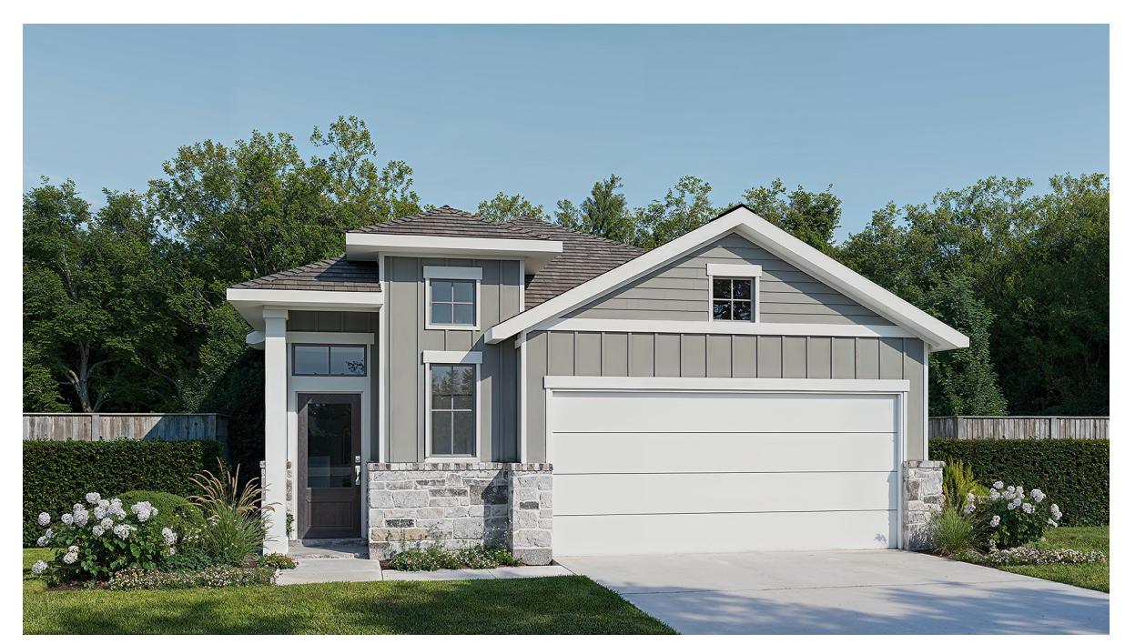
DESIGN 1844E E-1