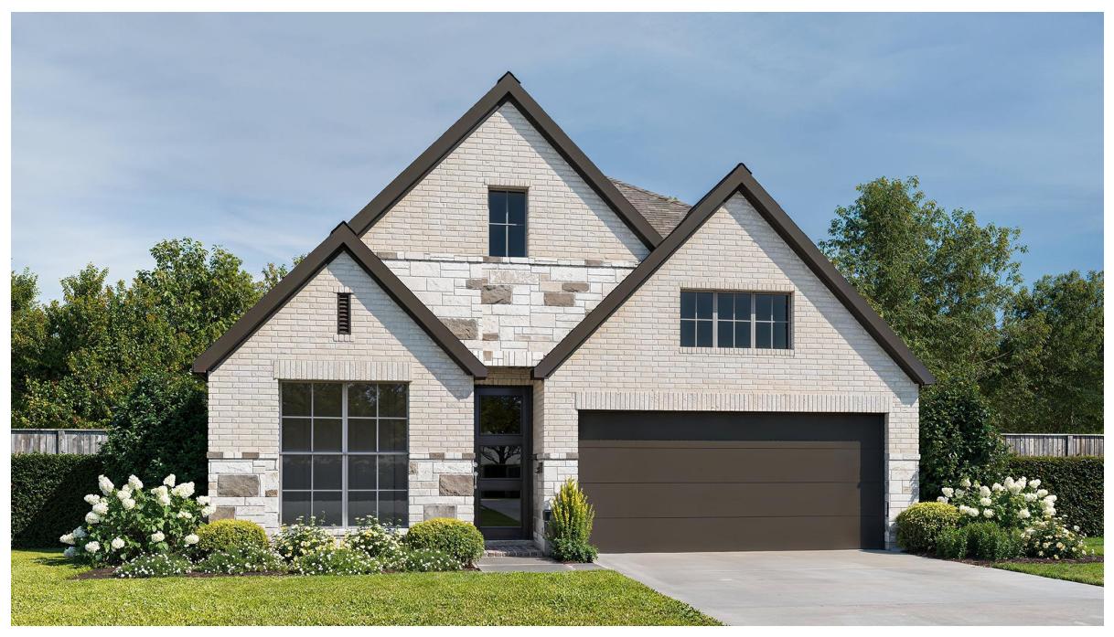
DESIGN 2169P E-52

This design, as originally designed and prior to any changes you make, is estimated to yield approximately the number of square feet shown on page 1. All dimensions are approximate. Square footage may vary based on as-built dimensions, configurations, plan options and/or the method of calculation. Designs are not-to-scale, and are conceptual illustrations that may differ from construction plans or completed improvements. A design may depict features not available on all homesites or in all communities. Perry Homes reserves the right to make changes in plans and specifications, and to substitute material of similar quality. Prices, terms, promotions, plans, dimensions, features, options, amenities, elevations, designs, square footages, specifications, materials, and availability of homes or communities are subject to change without notice or obligation. All obligations will be governed by a written contract. This design does not constitute a commitment to build a particular floor plan or home in any given community. Some floor plans, options, and/or elevations may not be available on certain homesites or in a particular community and may require additional charges. Please check with Perry Homes to verify current offerings in the communities you are considering. This rendering is the property of Perry Homes, LLC. Any reproduction or exhibition is strictly prohibited. © Perry Homes, LLC 2023