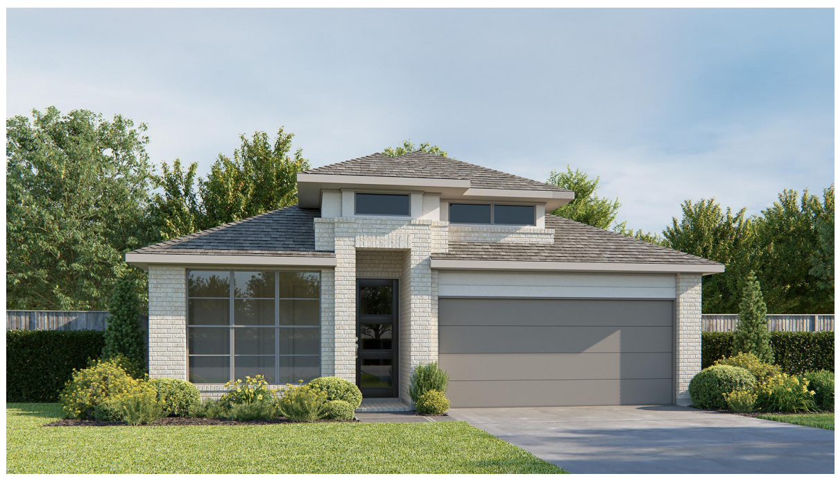
DESIGN 2169P E-1