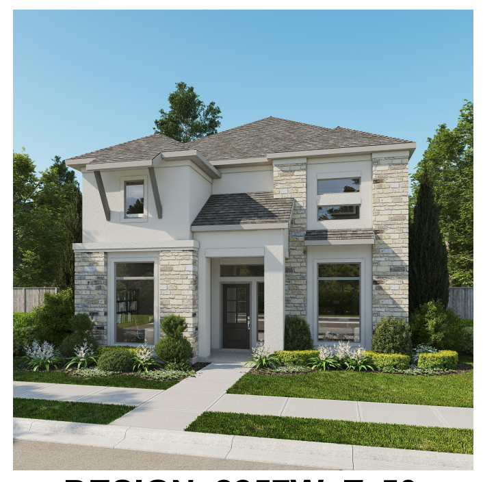
DESIGN 2257W E-50

This design, as originally designed and prior to any changes you make, is estimated to yield approximately the number of square feet shown on page 1. All dimensions are approximate. Square footage may vary based on as-built dimensions, configurations, plan options and/or the method of calculation. Designs are not-to-scale, and are conceptual illustrations that may differ from construction plans or completed improvements. A design may depict features not available on all homesites or in all communities. Perry Homes reserves the right to make changes in plans and specifications, and to substitute material of similar quality. Prices, terms, promotions, plans, dimensions, features, options, amenities, elevations, designs, square footages, specifications, materials, and availability of homes or communities are subject to change without notice or obligation. All obligations will be governed by a written contract. This design does not constitute a commitment to build a particular floor plan or home in any given community Some floor plans, options, and/or elevations may not be available on certain homesites or in a particular community and may require additional charges. Please check with Perry Homes to verify current offerings in the communities are considering. This rendering is the property of Perry Homes 11 C. Any reproduction or exhibition is strictly prohibited @ Perry Homes 11 C. 2022