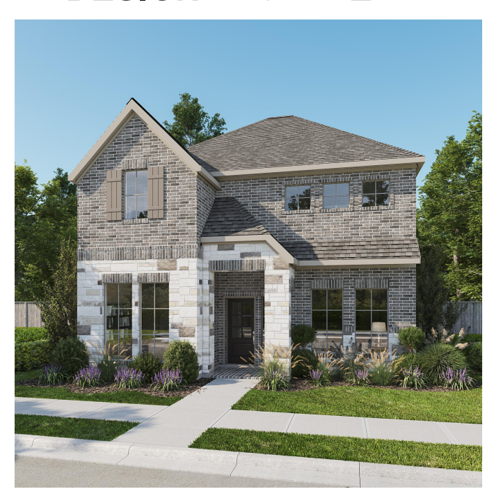
DESIGN 2257W E-30