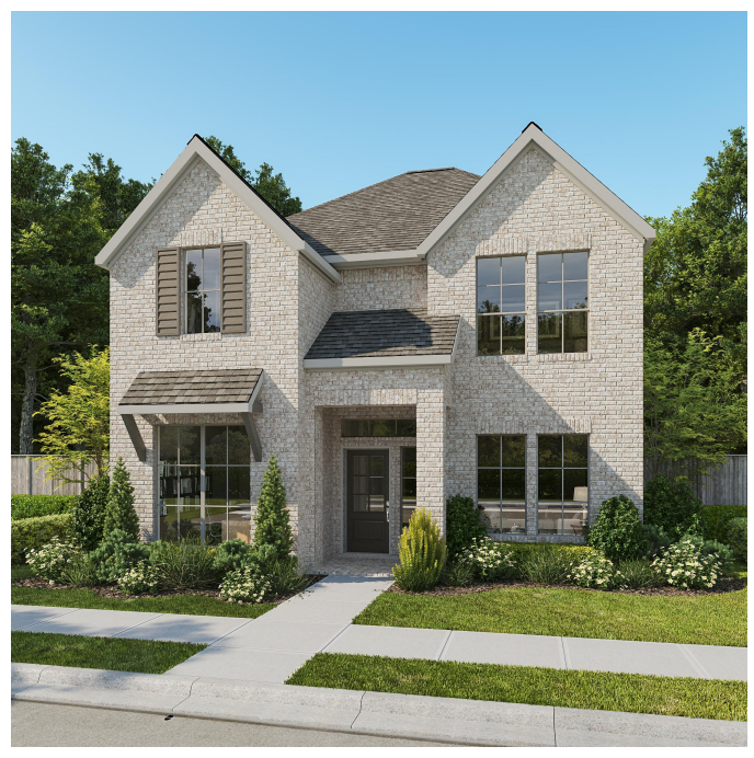
DESIGN 2257W E-1