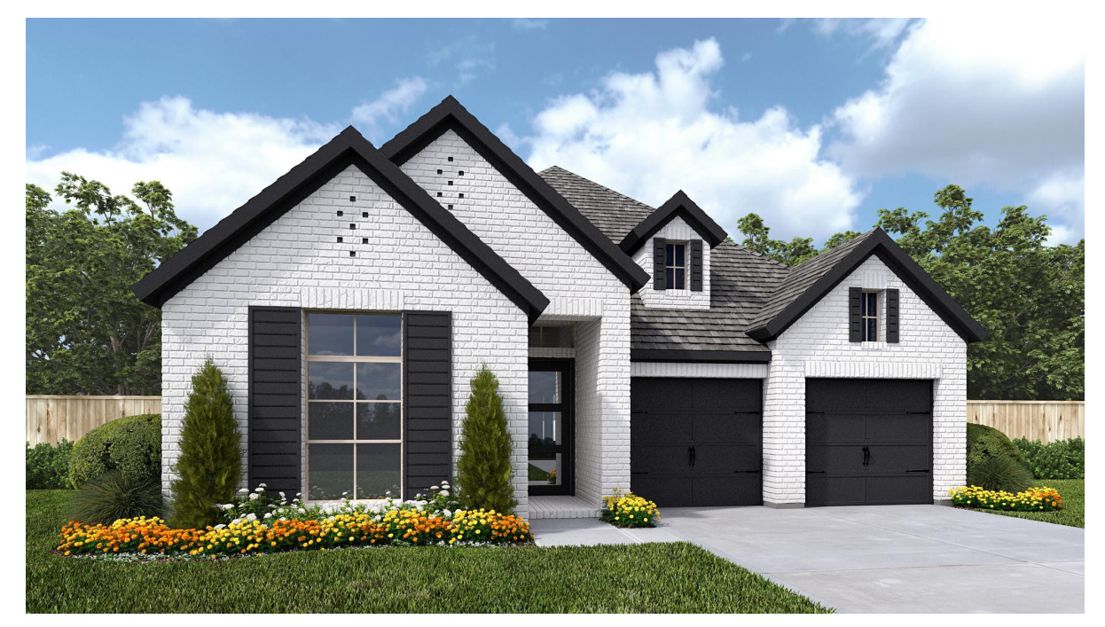
DESIGN 2300H E-1