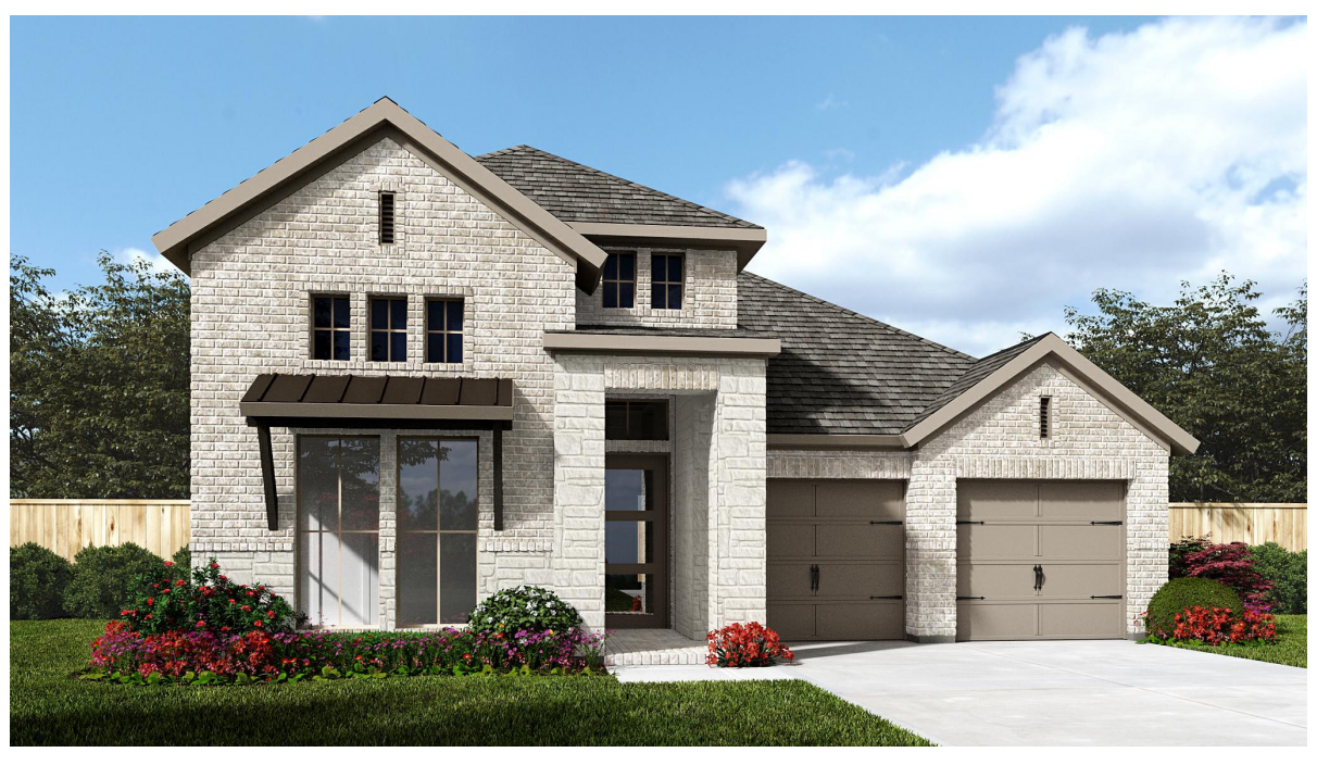
DESIGN 2300H E-70

This design, as originally designed and prior to any changes you make, is estimated to yield approximately the number of square feet shown on page 1. All dimensions are approximate. Square footage may vary based on as-built dimensions, configurations, plan options and/or the method of calculation. Designs are not-to-scale, and are conceptual illustrations that may differ from construction plans or completed improvements. A design may depict features not available on all homesites or in all communities. Perry Homes reserves the right to make changes in plans and specifications, and to substitute material of similar quality. Prices, terms, promotions, plans, dimensions, features, options, amenities, elevations, designs, square footages, specifications, materials, and availability of homes or communities are subject to change without notice or obligation. All obligations will be governed by a written contract. This design does not constitute a commitment to build a particular floor plan or home in any given community Some floor plans, options, and/or elevations may not be available on certain homesites or in a particular community and may require additional charges. Please check with Perry Homes to verify current offerings in the communities are considering. This rendering is the property of Perry Homes 11 C. Any reproduction or exhibition is strictly prohibited @ Perry Homes 11 C. 2025