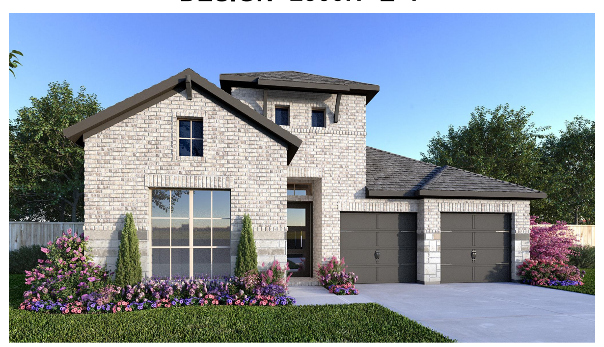
DESIGN 2300H E-30