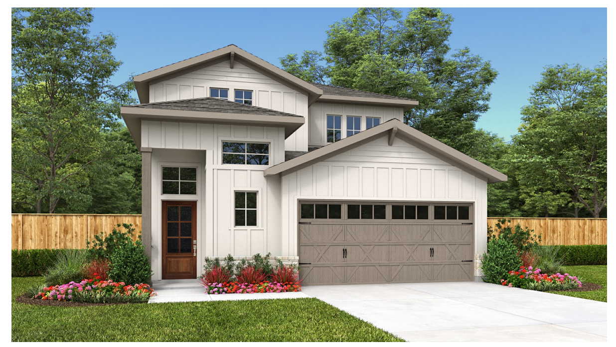
DESIGN 2322E E-1