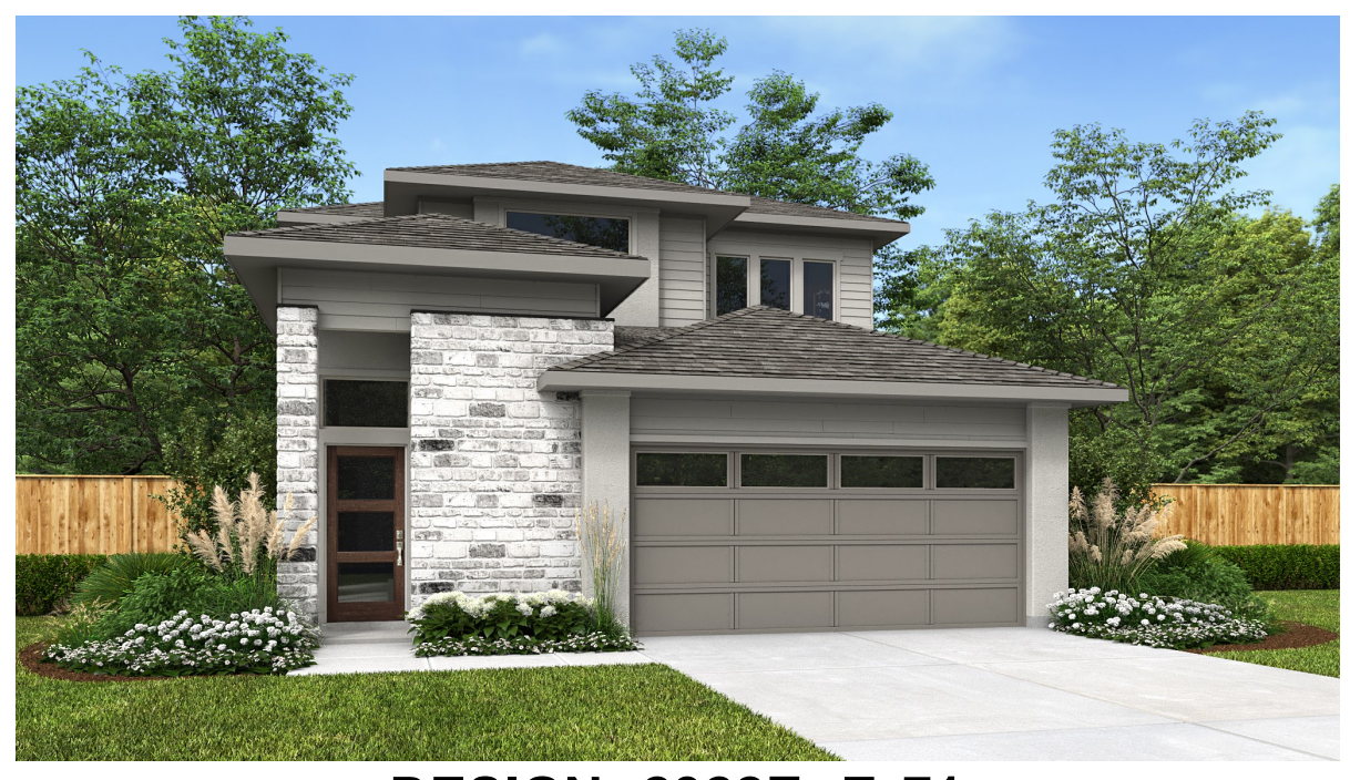
DESIGN 2322E E-71

This design, as originally designed and prior to any changes you make, is estimated to yield approximately the number of square feet shown on page 1. All dimensions are approximate. Square footage may vary based on as-built dimensions, configurations, plan options and/or the method of calculation. Designs are not-to-scale, and are conceptual illustrations that may differ from construction plans or completed improvements. A design may depict features not available on all homesites or in all communities. Perry Homes reserves the right to make changes in plans and specifications, and to substitute material of similar quality. Prices, terms, promotions, plans, dimensions, features, options, amenities, elevations, designs, square footages, specifications, materials, and availability of homes or communities are subject to change without notice or obligation. All obligations will be governed by a written contract. This design does not constitute a commitment to build a particular floor plan or home in any given community Some floor plans, options, and/or elevations may not be available on certain homesites or in a particular community and may require additional charges. Please check with Perry Homes to verify current offerings in the communities you are considering. This rendering is the property of Perry Homes LLC. Any reproduction or exhibition is strictly prohibited. @ Perry Homes LLC. 2015.