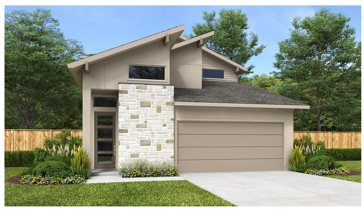
DESIGN 2322E E-70