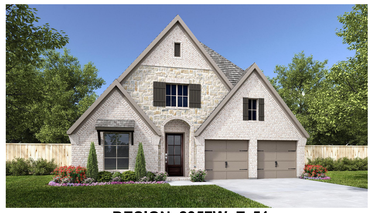
DESIGN 2357W E-51

This design, as originally designed and prior to any changes you make, is estimated to yield approximately the number of square feet shown on page 1. All dimensions are approximate. Square footage may vary based on as-built dimensions, configurations, plan options and/or the method of calculation. Designs are not-to-scale, and are conceptual illustrations that may differ from construction plans or completed improvements. A design may depict features not available on all homesites or in all communities. Perry Homes reserves the right to make changes in plans and specifications, and to substitute material of similar quality. Prices, terms, promotions, plans, dimensions, features, options, amenities, elevations, designs, square footages, specifications, materials, and availability of homes or communities evaluate to change without notice or obligation. All obligations will be governed by a written contract. This design does not constitute a commitment to build a particular floor plan or home in any given community. Some floor plans, options, and/or elevations may not be available on certain homesites or in a particular community and may require additional charges. Please check with Perry Homes to verify current offerings in the communities you are considering. This rendering is the property of Perry Homes. LLC. Any reproduction or exhibition is strictly prohibited. © Perry Homes. LLC 2023