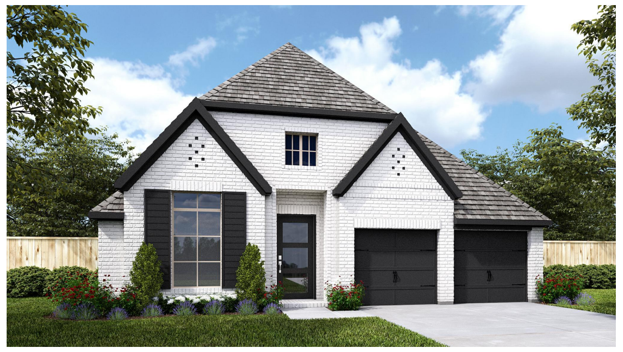
DESIGN 2357W E-1