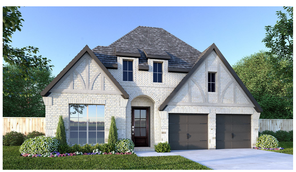
DESIGN 2357W E-50