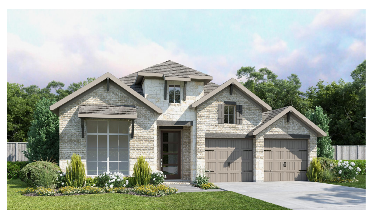
DESIGN 2357W E-30