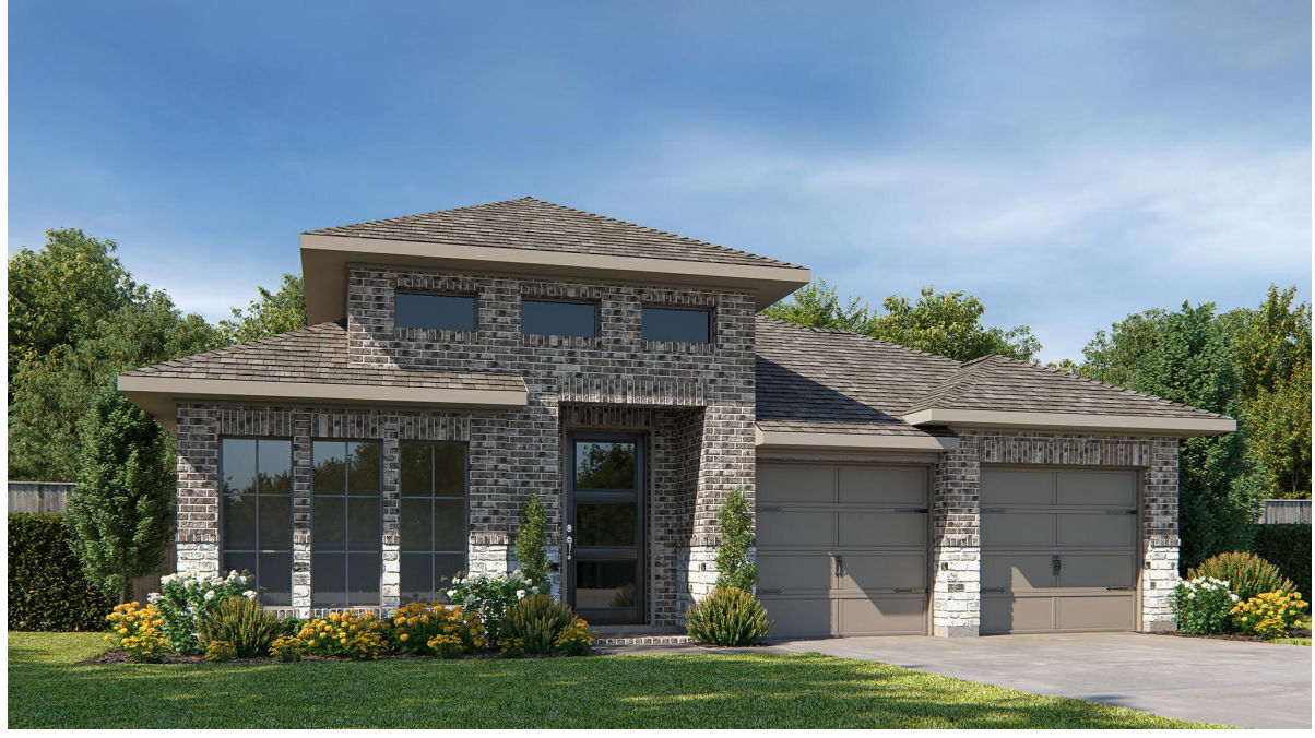
DESIGN 2358V E-30