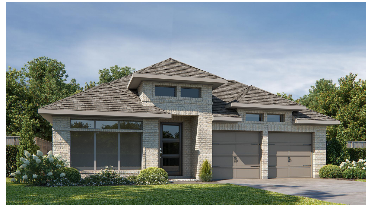
DESIGN 2358V E-1