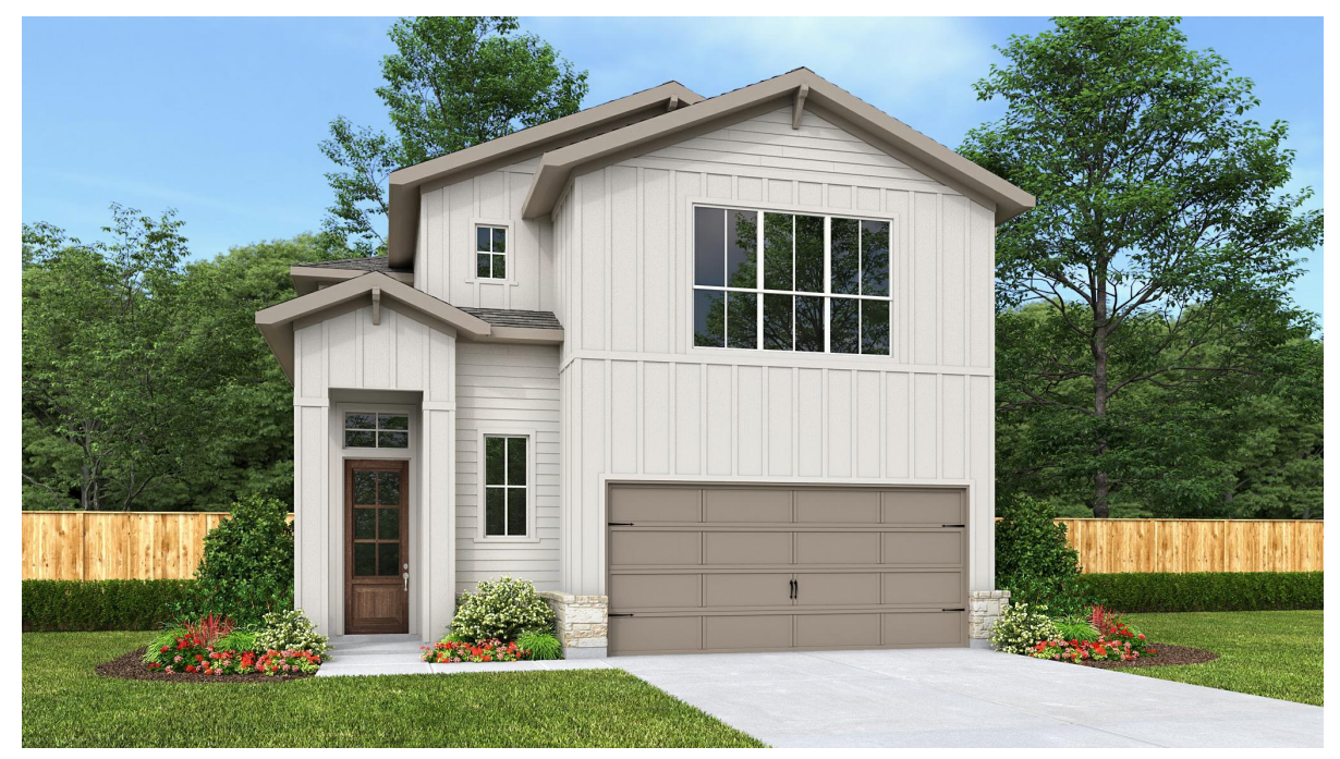
DESIGN 23790 E-1