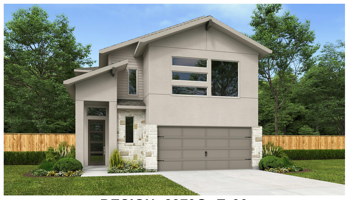
DESIGN 23790 E-90

This design, as originally designed and prior to any changes you make, is estimated to yield approximately the number of square feet shown on page 1. All dimensions are approximate. Square footage may vary based on as-built dimensions, configurations, plan options and/or the method of calculation. Designs are not-to-scale, and are conceptual illustrations that may differ from construction plans or completed improvements. A design may depict features not available on all homesites or in all communities. Perry Homes reserves the right to make changes in plans and specifications, and to substitute material similar quality. Prices, terms, promotions, plans, dimensions, features, options, amenities, elevations, designs, square footages, specifications, materials, and availability of homes or communities evaluate to change without notice or obligation. All obligations will be governed by a written contract. This design does not constitute a commitment to build a particular floor plan or home in any given community. Some floor plans, options, and/or elevations may not be available on certain homesites or in a particular community and may require additional charges. Please check with Perry Homes to verify current offerings in the communities you are considering. This rendering is the property of Perry Homes. LLC. Any reproduction or exhibition is strictly prohibited. © Perry Homes. LLC 2023