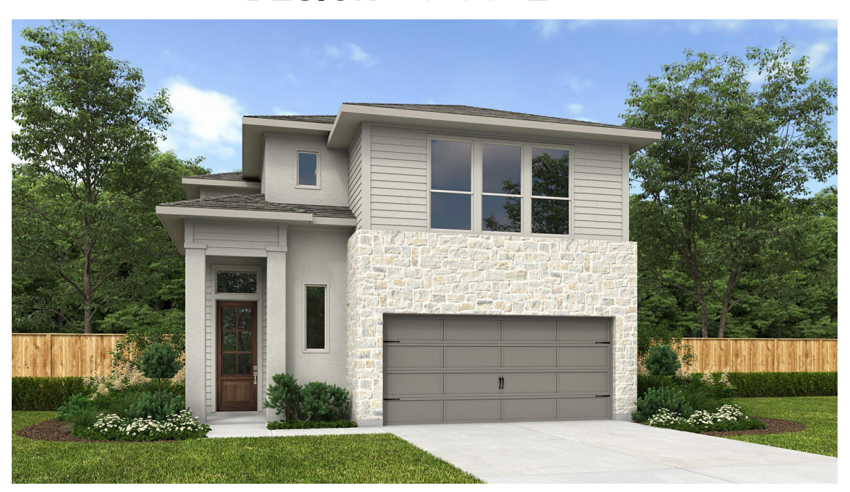
DESIGN 23790 E-70