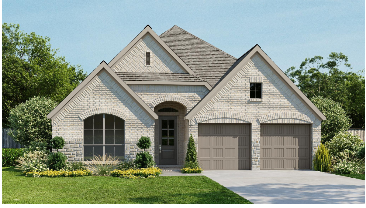
DESIGN 2420W E-30