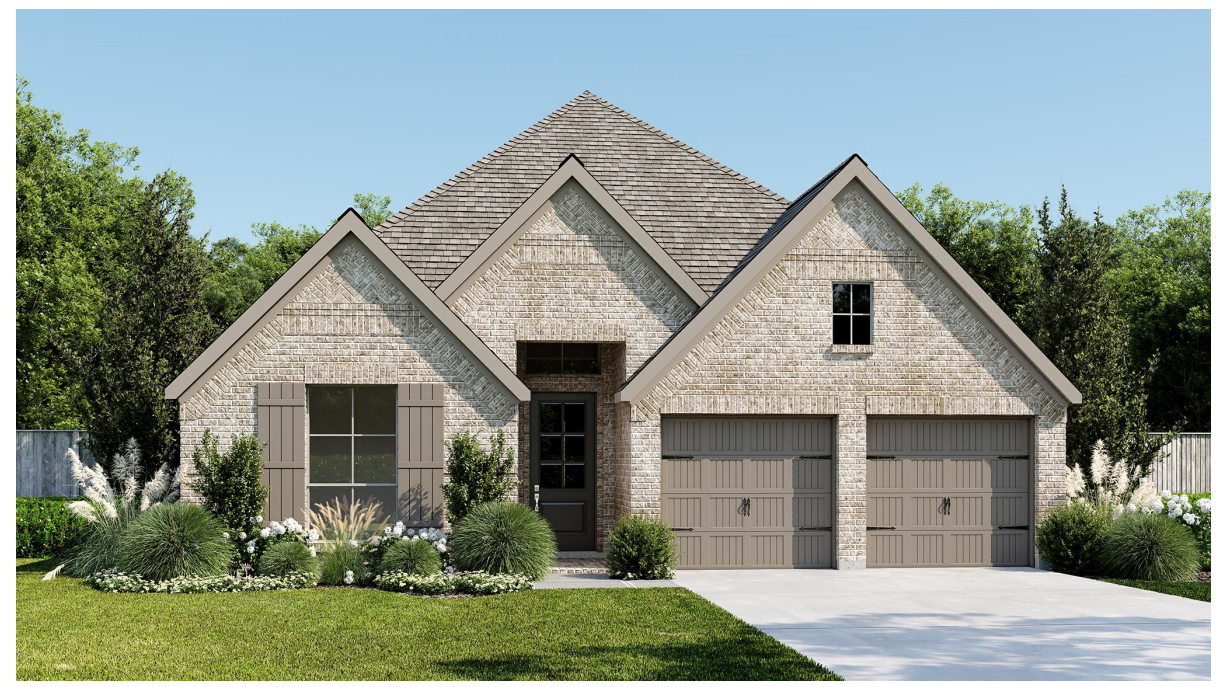
DESIGN 2420W E-1