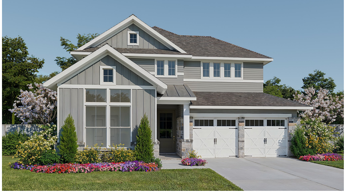
DESIGN 2458E E-50