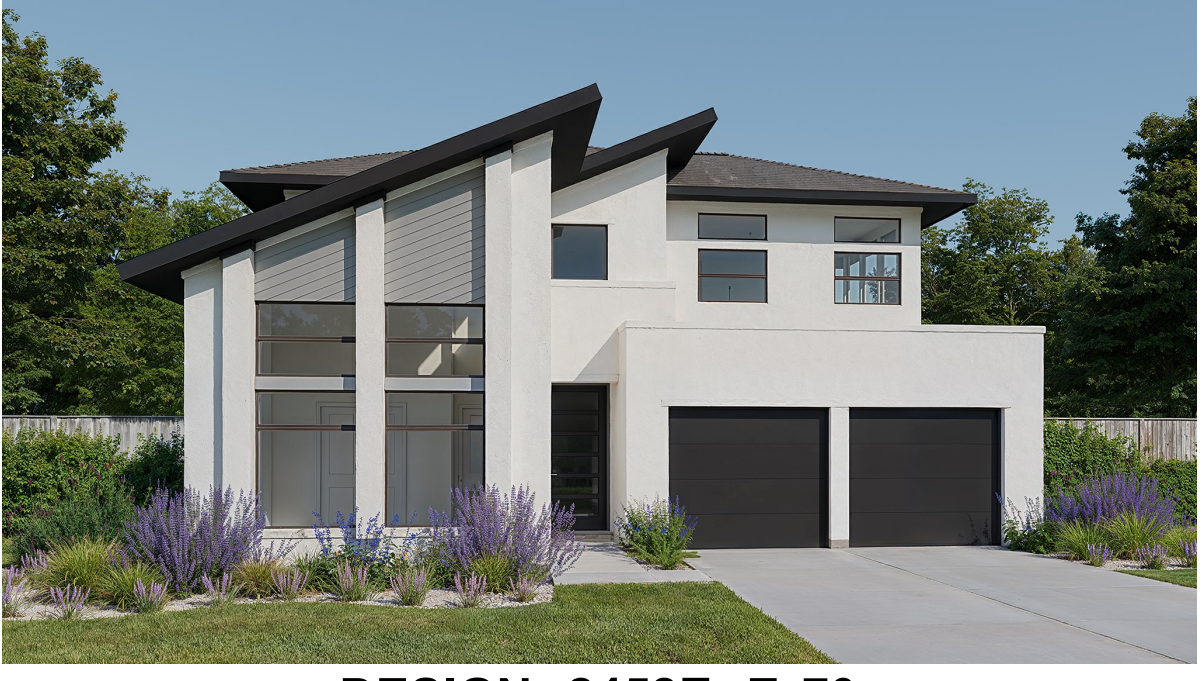
DESIGN 2458E E-70

This design, as originally designed and prior to any changes you make, is estimated to yield approximately the number of square feet shown on page 1. All dimensions are approximate. Square footage may vary based on as-built dimensions, configurations, plan options and/or the method of calculation. Designs are not-to-scale, and are conceptual illustrations that may differ from construction plans or completed improvements. A design may depict features not available on all homesites or in all communities. Perry Homes reserves the right to make changes in plans and specifications, and to substitute material of similar quality. Prices, terms, promotions, plans, dimensions, features, options, amenities, elevations, design dees not constitute a committee or obligation. All obligations will be governed by a written contract. This design does not constitute a committee to build a particular floor plan or home in any given community. Some floor plans, options, and/or elevations must be not be evaluable on restain homesites or in a particular community and yrequire additional charges. Please check with Perry Homes to verify current offerings in the communities you are considering. This rendering is the property of Perry Homes, LLC. Any reproduction or exhibition is strictly prohibited. © Perry Homes, LLC 2025