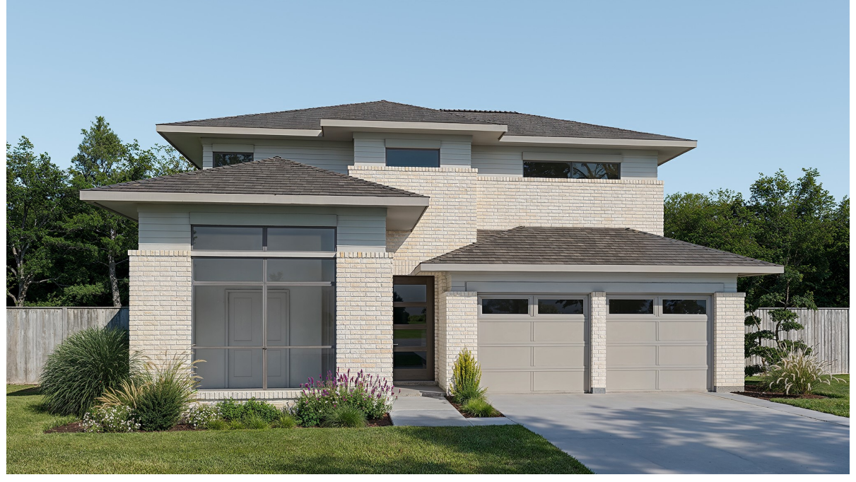
DESIGN 2458E E-1