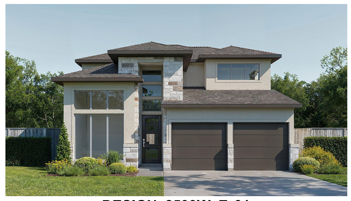
DESIGN 2593W E-31

This design, as originally designed and prior to any changes you make, is estimated to yield approximately the number of square feet shown on page 1. All dimensions are approximate. Square footage may vary based on as-built dimensions, configurations, plan options and/or the method of calculation. Designs are not-to-scale, and are conceptual illustrations that may differ from construction plans or completed improvements. A design may depict features not available on all homesites or in all communities. Perry Homes reserves the right to make changes in plans and specifications, and to substitute material of similar quality. Prices, terms, promotions, plans, dimensions, features, options, amenities, elevations, designs, square footages, specifications, materials, and availability of homes or communities to change without notice or obligation. All obligations will be governed by a written contract. This design does not constitute a commitment to build a particular floor plan or home in any given community. Some floor plans, options, and/or elevations may not be available on certain homesites or in a particular community and may require additional charges. Please check with Perry Homes to verify current offerings in the communities on are considering. This rendering is the property of Perry Homes. LLC. Any reproduction or exhibition is strictly prohibited @ Perry Homes LLC. 2019.