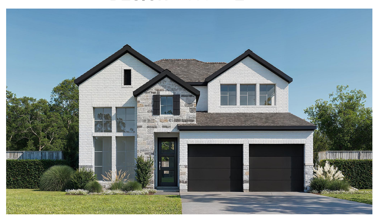
DESIGN 2593W E-30