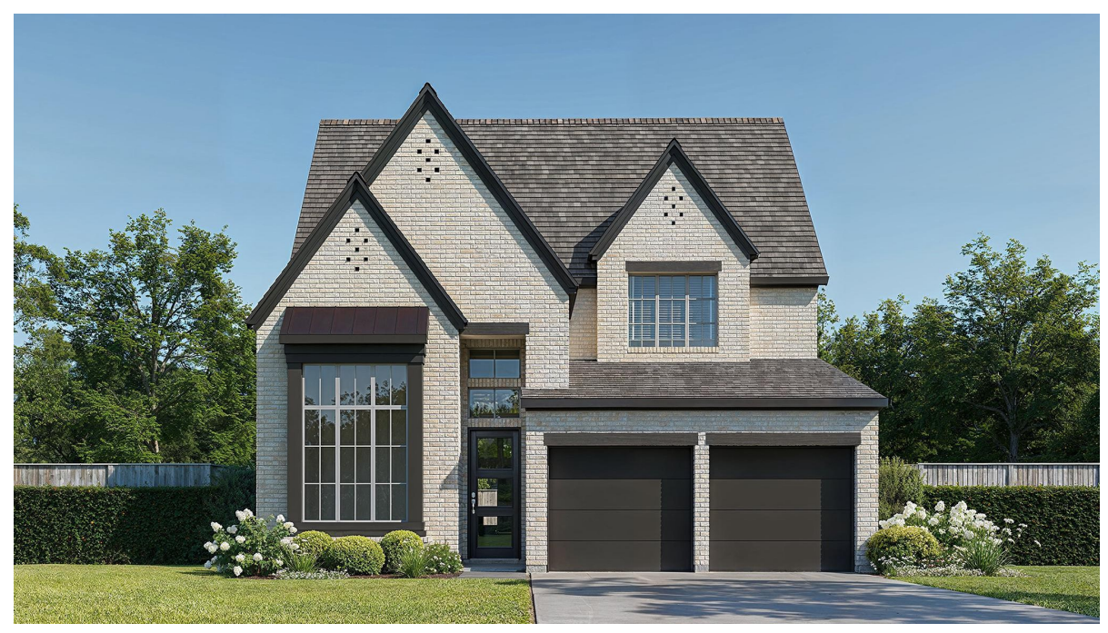
DESIGN 2593W E-1