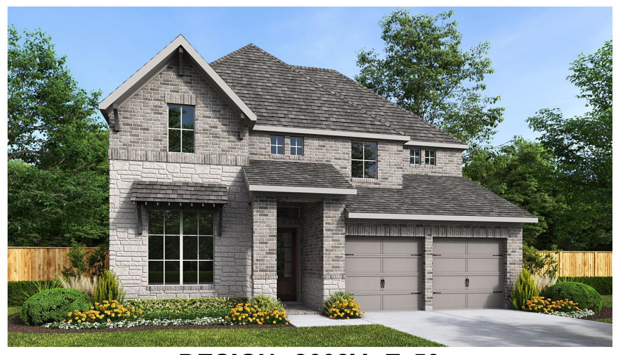
DESIGN 2608V E-50

This design, as originally designed and prior to any changes you make, is estimated to yield approximately the number of square feet shown on page 1. All dimensions are approximate. Square footage may vary based on as-built dimensions, configurations, plan options and/or the method of calculation. Designs are not-to-scale, and are conceptual illustrations that may differ from construction plans or completed improvements. A design may depict features not available on all homesites or in all communities. Perry Homes reserves the right to make changes in plans and specifications, and to substitute material of similar quality. Prices, terms, promotions, plans, dimensions, features, options, amenities, elevations, designs, square footages, specifications, materials, and availability of homes or communities to change without notice or obligation. All obligations will be governed by a written contract. This design does not constitute a commitment to build a particular floor plan or home in any given community. Some floor plans, options, and/or elevations may not be available on certain homesites or in a particular community and may require additional charges. Please check with Perry Homes to verify current offerings in the communities on are considering. This rendering is the property of Perry Homes. LLC. Any reproduction or exhibition is strictly prohibited @ Perry Homes LLC. 2019.