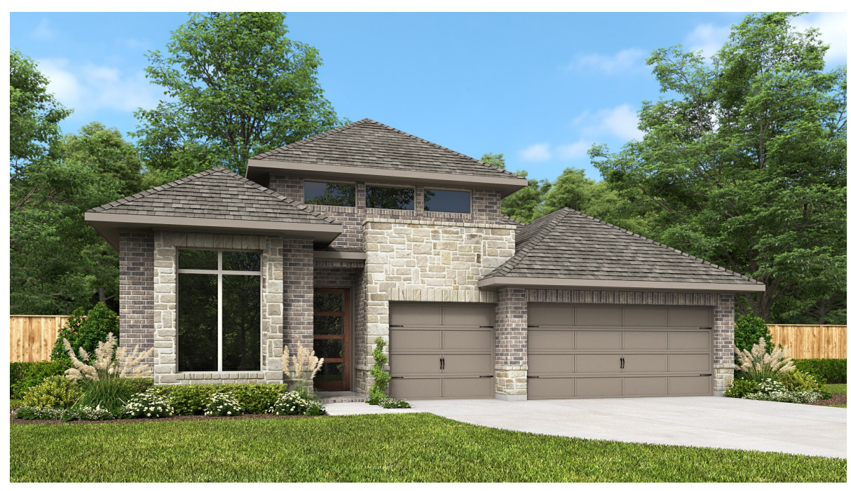
DESIGN 2695P E-51

This design, as originally designed and prior to any changes you make, is estimated to yield approximately the number of square feet shown on page 1. All dimensions are approximate. Square footage may vary based on as-built dimensions, configurations, plan options and/or the method of calculation. Designs are not-to-scale, and are conceptual illustrations that may differ from construction plans or completed improvements. A design may depict features not available on all homesites or in all communities. Perry Homes reserves the right to make changes in plans and specifications, and to substitute material of similar quality. Prices, terms, promotions, plans, dimensions, features, options, amenities, elevations, designs, square footages, specifications, materials, and availability of homes or communities are subject to change without notice or obligation. All obligations will be governed by a written contract. This design does not constitute a commitment to build a particular floor plan or home in any given community Some floor plans, options, and/or elevations may not be available on certain homesites or in a particular community and may require additional charges. Please check with Perry Homes to verify current offerings in the communities are considering. This rendering is the property of Perry Homes II C. Any reproduction or exhibition is strictly prohibited @ Perry Homes II C. 2024