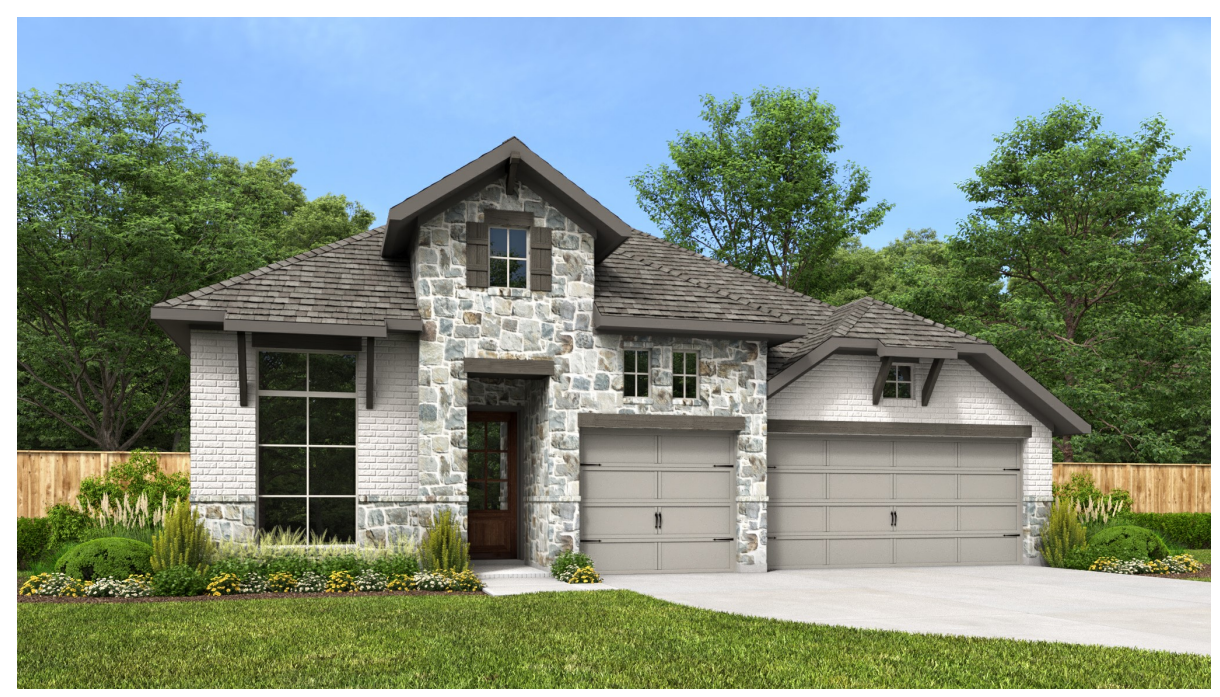
DESIGN 2695P E-1