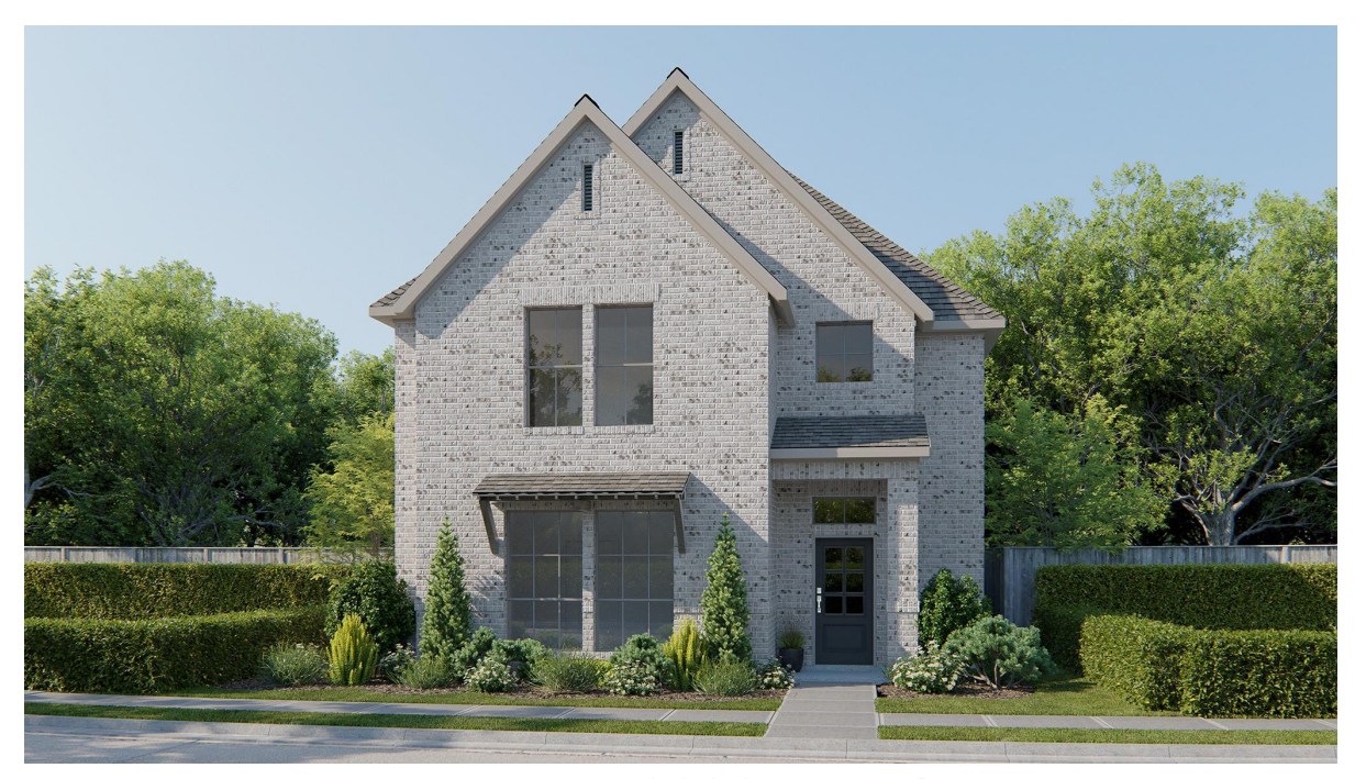
DESIGN 2696W E-1