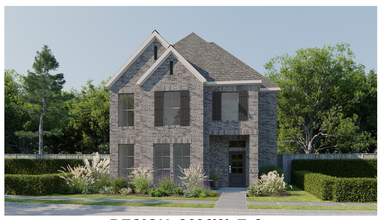
DESIGN 2696W E-2

This design, as originally designed and prior to any changes you make, is estimated to yield approximately the number of square feet shown on page 1. All dimensions are approximate. Square footage may vary based on as-built dimensions, configurations, plan options and/or the method of calculation. Designs are not-to-scale, and are conceptual illustrations that may differ from construction plans or completed improvements. A design may depict features not available on all homesites or in all communities. Perry Homes reserves the right to make changes in plans and specifications, and to substitute material of similar quality. Prices, terms, promotions, plans, dimensions, features, options, amenities, elevations, designs, square footages, specifications, materials, and availability of homes or communities are subject to change without notice or obligation. All obligations will be governed by a written contract. This design does not constitute a commitment to build a particular floor plan or home in any given community Some floor plans, options, and/or elevations may not be available on certain homesites or in a particular community and may require additional charges. Please check with Perry Homes to verify current offerings in the communities are considering. This rendering is the property of Perry Homes II C. Any reproduction or exhibition is strictly prohibited @ Perry Homes II C. 2025