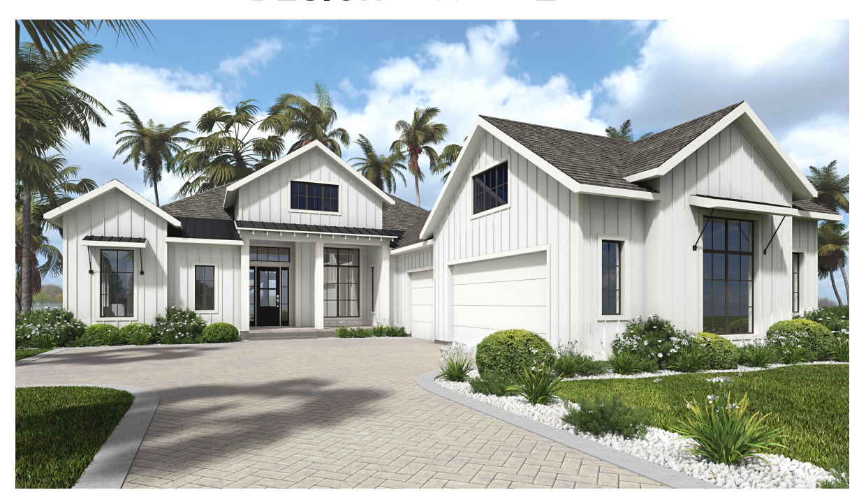
DESIGN 2697F E-3