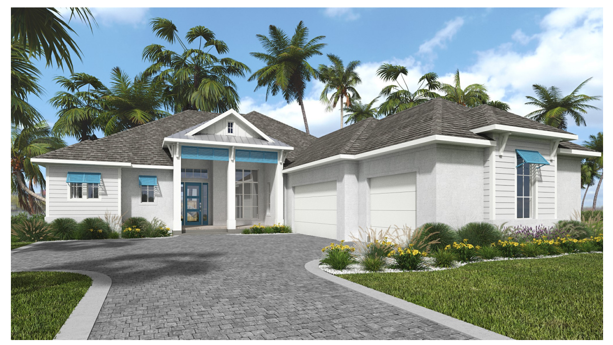
DESIGN 2697F E-1