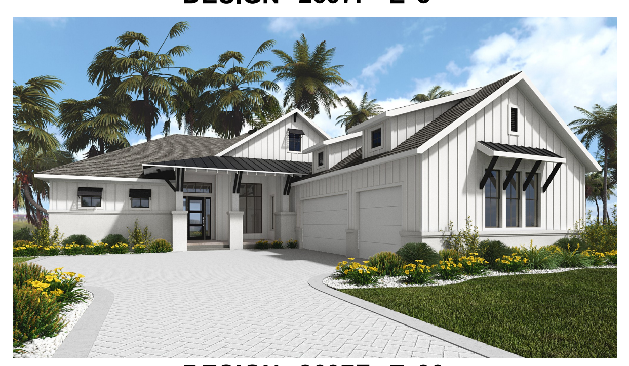
DESIGN 2697F E-30

This design, as originally designed and prior to any changes you make, is estimated to yield approximately the number of square feet shown on page 1. All dimensions are approximate. Square footage may vary based on as-built dimensions, configurations, plan options and/or the method of calculation. Designs are not-to-scale, and are conceptual illustrations that may differ from construction plans or completed improvements. A design may depict features not available on all homesites or in all communities. Perry Homes reserves the right to make changes in plans and specifications, and to substitute material of similar quality. Prices, terms, promotions, plans, dimensions, features, options, amenities, elevations, designs, square footages, specifications, materials, and availability of homes or communities are subject to change without notice or obligation. All obligations will be governed by a written contract. This design does not constitute a commitment to build a particular floor plan or home in any given community of the property of perry Homes. LLC and may require additional charges. Please check with Perry Homes to verify current offerings in the communities you are considering. This rendering is the property of Perry Homes. LLC. Any reproduction or exhibition is strictly prohibited. © Perry Homes. LLC 2024