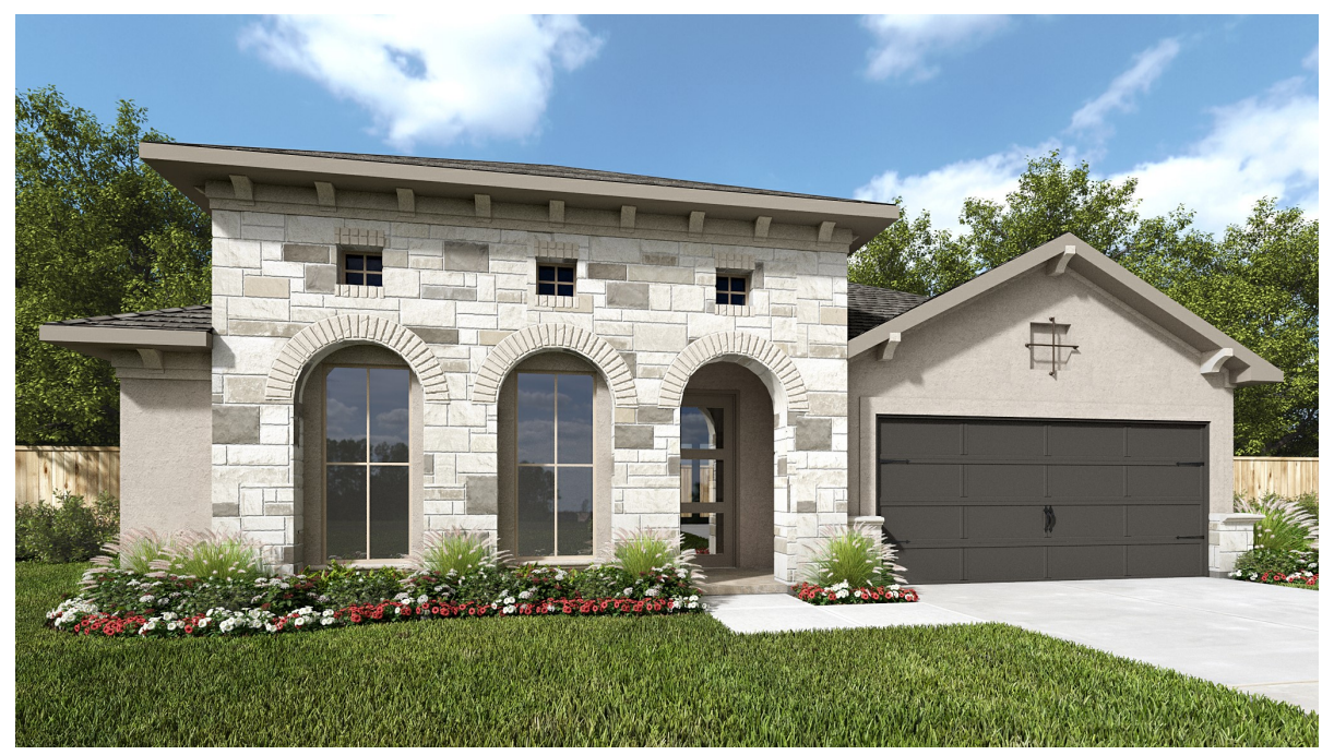
DESIGN 2738M E-1