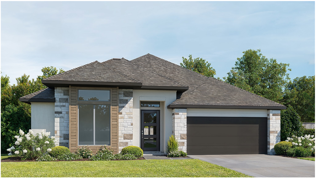
DESIGN 2738M E-4

*See Page 3 for Details and Disclaimers | © Perry Homes, LLC 2022 | 12/4/2024 1:47:28 PM (55' CL) PerryHomes.com