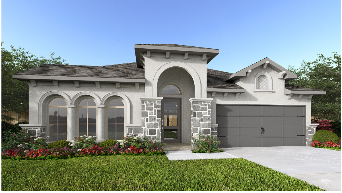
DESIGN 2738M E-2