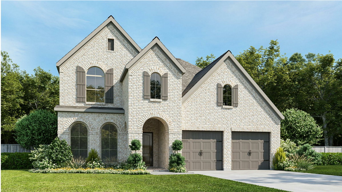
Design 2797W E-1