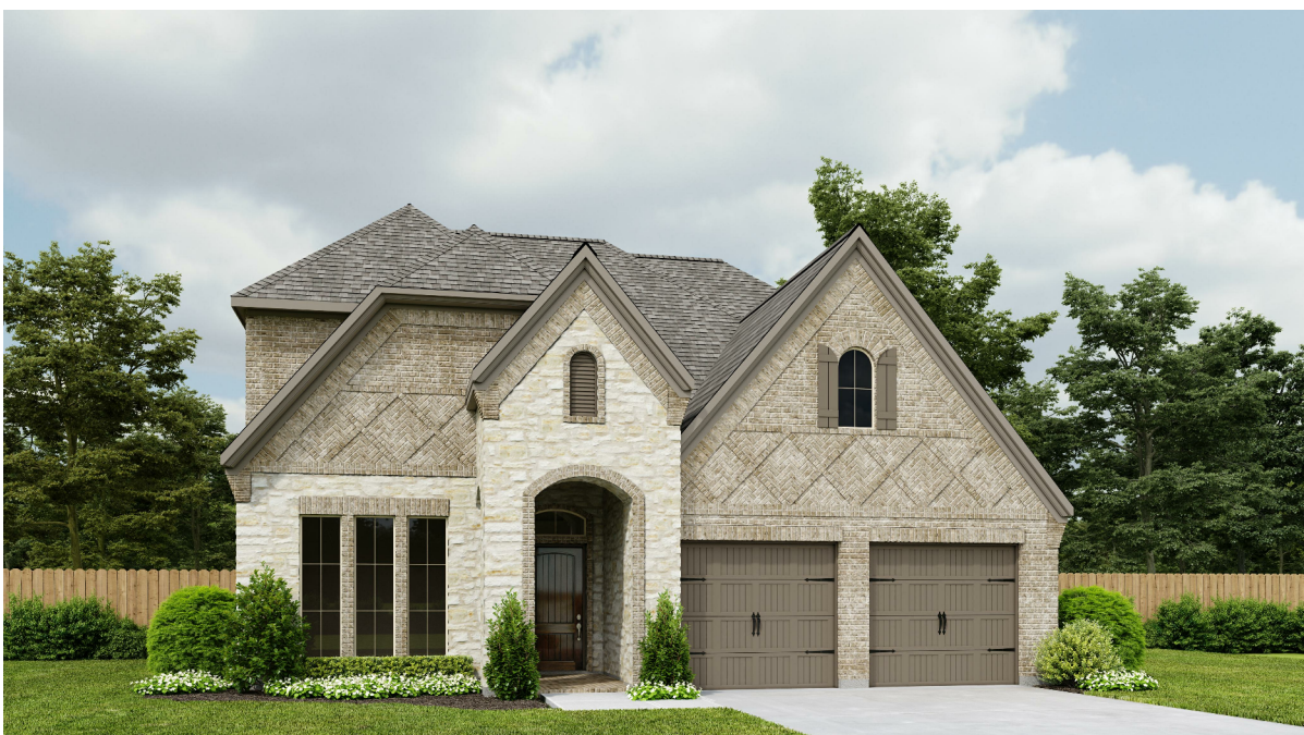
Design 2797W E-70

This design, as originally designed and prior to any changes you make, is estimated to yield approximately the number of square feet shown on page 1. All dimensions are approximate. Square footage may vary based on as-built dimensions, configurations, plan options and/or the method of calculation. Designs are not-to-scale, and are conceptual illustrations that may differ from construction plans or completed improvements. A design may depict features not available on all homesites or in all communities. Perry Homes reserves the right to make changes in plans and specifications, and to substitute material of similar quality. Prices, terms, promotions, plans, dimensions, features, options, amenities, elevations, designs, square footages, specifications, materials, and availability of homes or communities are subject to change without notice or obligation. All obligations will be governed by a written contract. This design does not constitute a commitment to build a particular floor plan or home in any given community. Some floor plans, options, and/or elevations may not be available on certain homesites or in a particular community and may require additional charges. Please check with Perry Homes to verify current offerings in the communities you are considering. This rendering is the property of Perry Homes, LLC. Any reproduction or exhibition is strictly prohibited.