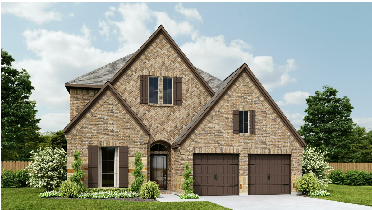
Design 2797W E-50