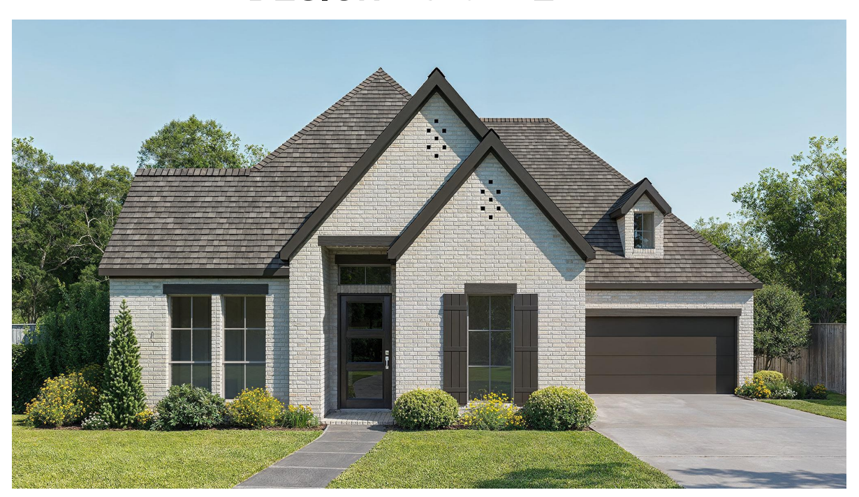
DESIGN 2810W E-50