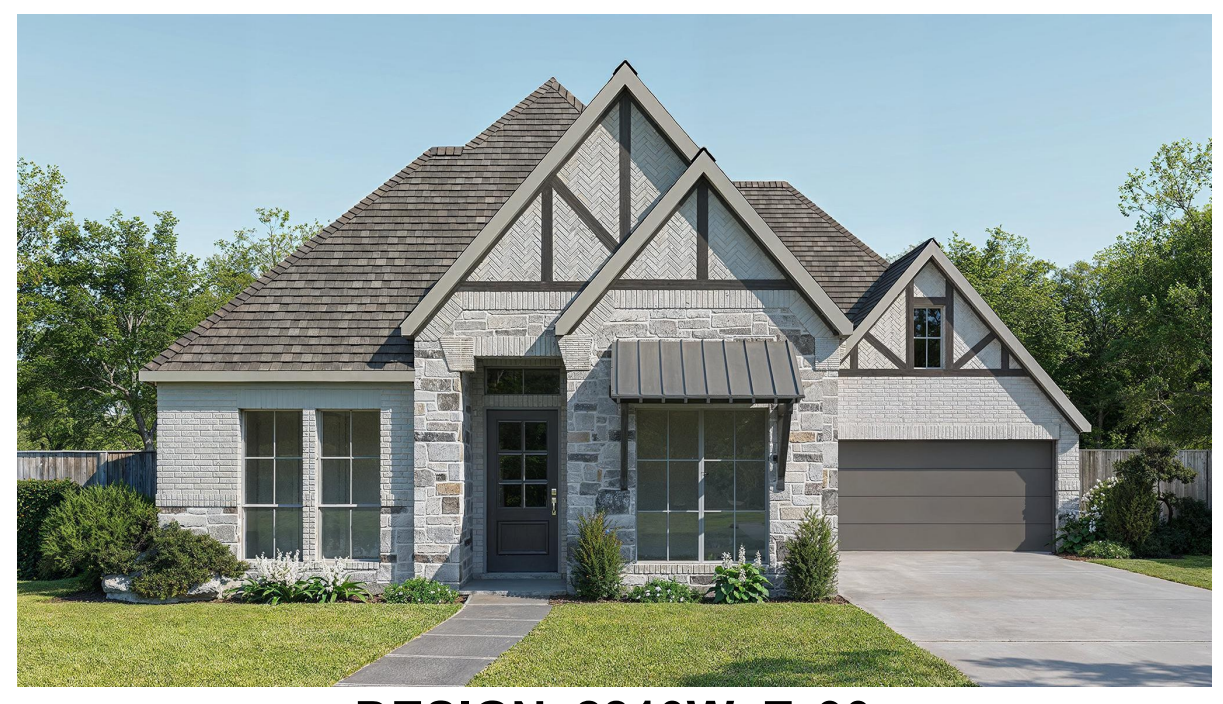
DESIGN 2810W E-90

This design, as originally designed and prior to any changes you make, is estimated to yield approximately the number of square feet shown on page 1. All dimensions are approximate. Square footage may vary based on as-built dimensions, configurations, plan options and/or the method of calculation. Designs are not-to-scale, and are conceptual illustrations that may differ from construction plans or completed improvements. A design may depict features not available on all homesites or in all communities. Perry Homes reserves the right to make changes in plans and specifications, and to substitute material of similar quality. Prices, terms, promotions, plans, dimensions, features, options, amenities, elevations, designs, square footages, specifications, materials, and availability of homes or communities to change without notice or obligation. All obligations will be governed by a written contract. This design does not constitute a commitment to build a particular floor plan or home in any given community. Some floor plans, options, and/or elevations may not be available on certain homesites or in a particular community and may require additional charges. Please check with Perry Homes to verify current offerings in the communities on are considering. This rendering is the property of Perry Homes. LLC. Any reproduction or exhibition is strictly prohibited @ Perry Homes LLC. 2019