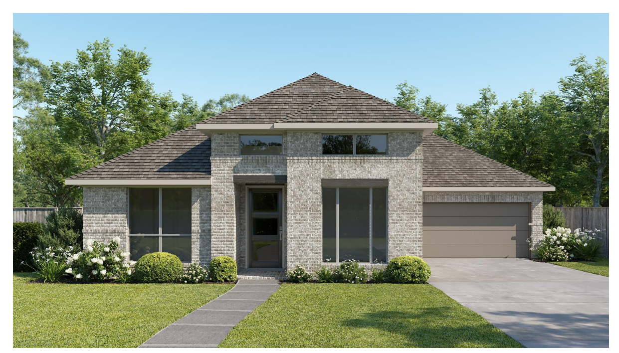
DESIGN 2810W E-1