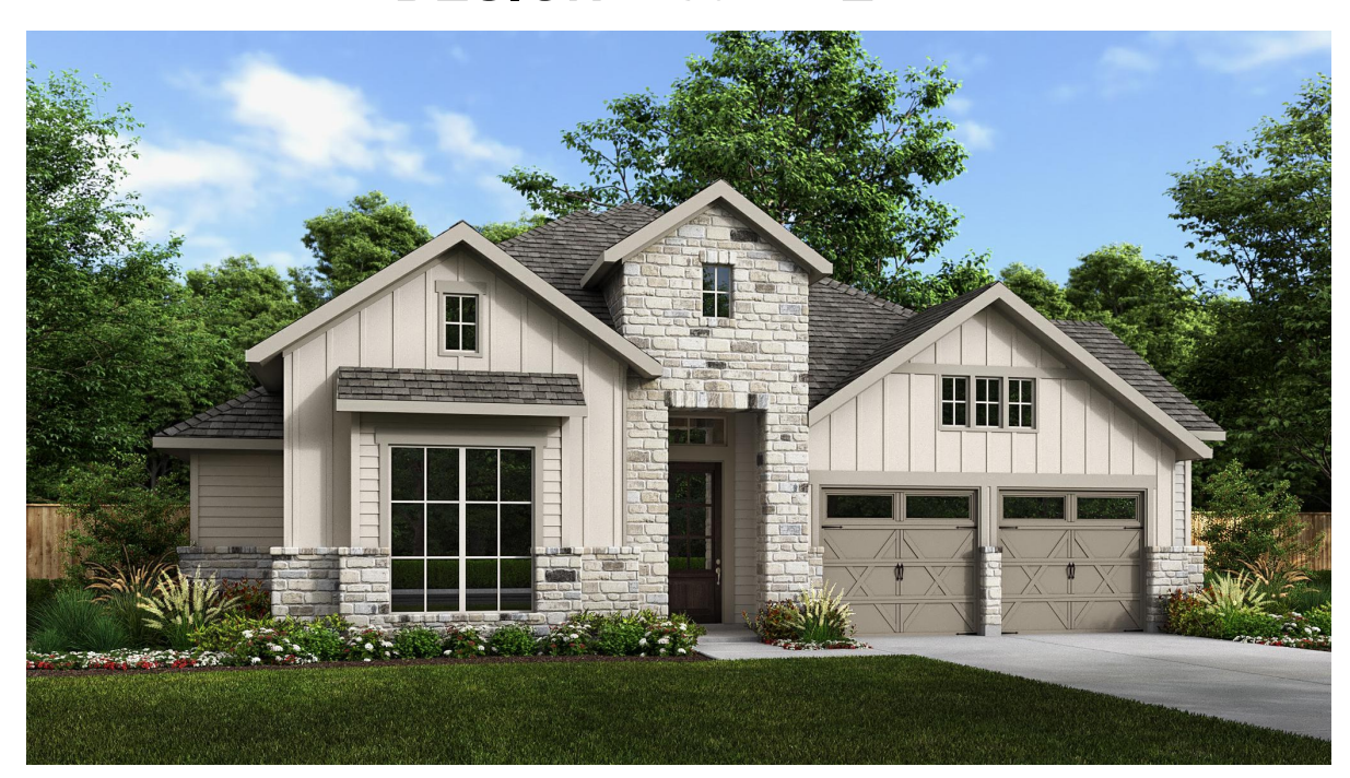
DESIGN 2837E E-30