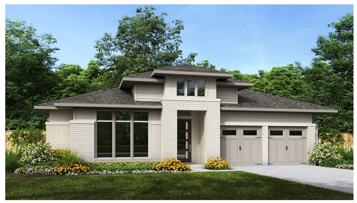
DESIGN 2837E E-1