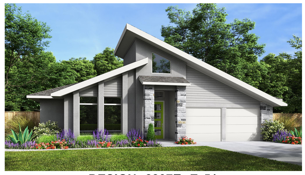
DESIGN 2837E E-51

This design, as originally designed and prior to any changes you make, is estimated to yield approximately the number of square feet shown on page 1. All dimensions are approximate. Square footage may vary based on as-built dimensions, configurations, plan options and/or the method of calculation. Designs are not-to-scale, and are conceptual illustrations that may differ from construction plans or completed improvements. A design may depict features not available on all homesites or in all communities. Perry Homes reserves the right to make changes in plans and specifications, and to substitute material of similar quality. Prices, terms, promotions, plans, dimensions, features, options, amenities, elevations, designs, square footages, specifications, materials, and availability of homes or communities are subject to change without notice or obligation. All obligations will be governed by a written contract. This design does not constitute a commitment to build a particular floor plan or home in any given community Some floor plans, options, and/or elevations may not be available on certain homesites or in a particular community and may require additional charges. Please check with Perry Homes to verify current offerings in the communities you are considering. This rendering is the property of Perry Homes. LLC. Any reproduction or exhibition is strictly prohibited. © Perry Homes. LLC 2019