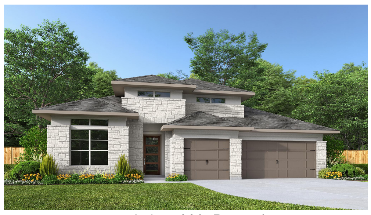
DESIGN 2895P E-70

This design, as originally designed and prior to any changes you make, is estimated to yield approximately the number of square feet shown on page 1. All dimensions are approximate. Square footage may vary based on as-built dimensions, configurations, plan options and/or the method of calculation. Designs are not-to-scale, and are conceptual illustrations that may differ from construction plans or completed improvements. A design may depict features not available on all homesites or in all communities. Perry Homes reserves the right to make changes in plans and specifications, and to substitute material of similar quality. Prices, terms, promotions, plans, dimensions, features, options, amenities, elevations, designs, square footages, specifications, materials, and availability of homes or communities are subject to change without notice or obligation. All obligations will be governed by a written contract. This design does not constitute a commitment to build a particular floor plan or home in any given community Some floor plans, options, and/or elevations may not be available on certain homesites or in a particular community and may require additional charges. Please check with Perry Homes to verify current offerings in the communities are considering. This rendering is the property of Perry Homes 11 C. Any reproduction or exhibition is strictly prohibited @ Perry Homes 11 C. 2023