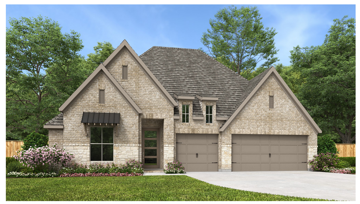
DESIGN 2895P E-1