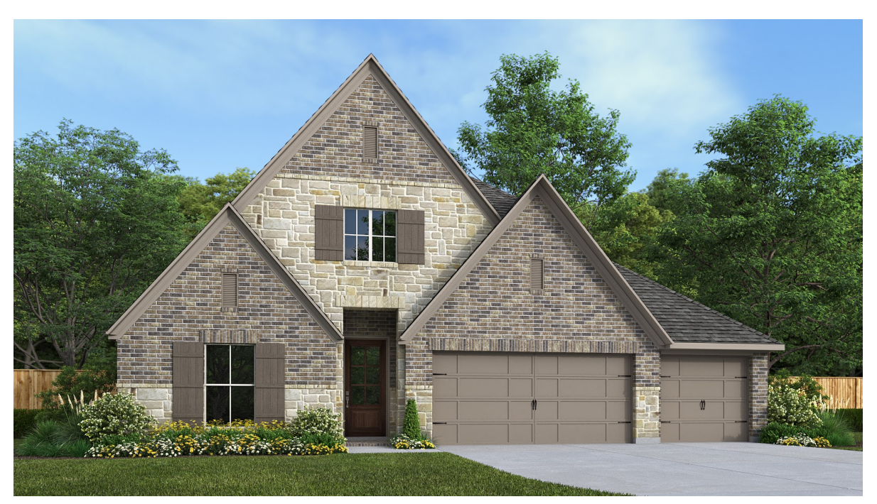
DESIGN 2895P E-50