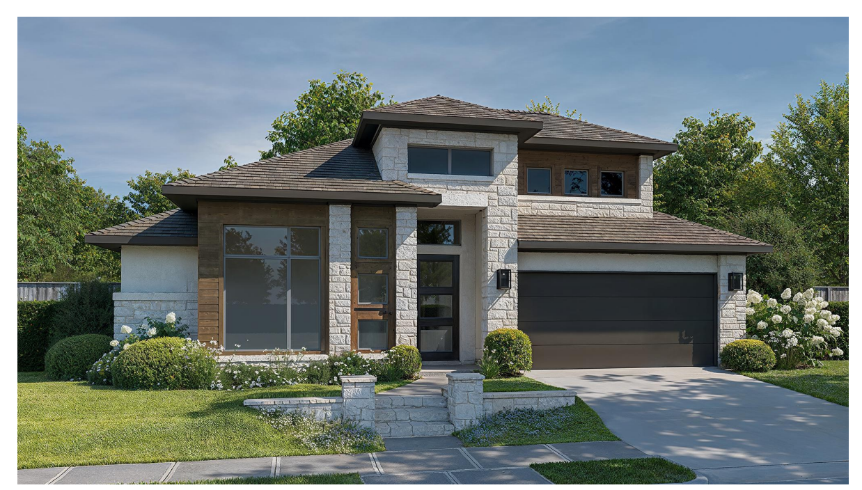
DESIGN 2949M E-31