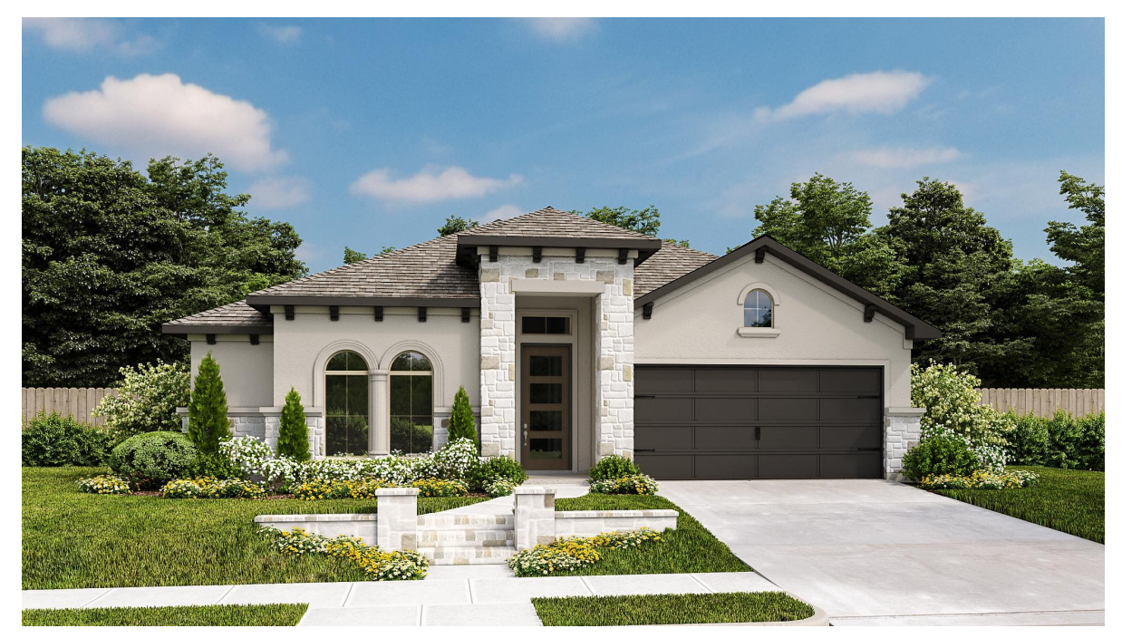
DESIGN 2949M E-1