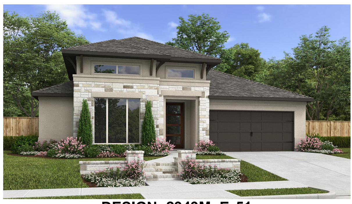
DESIGN 2949M E-51

This design, as originally designed and prior to any changes you make, is estimated to yield approximately the number of square feet shown on page 1. All dimensions are approximate. Square footage may vary based on as-built dimensions, configurations, plan options and/or the method of calculation. Designs are not-to-scale, and are conceptual illustrations that may differ from construction plans or completed improvements. A design may depict features not available on all homesites or in all communities. Perry Homes reserves the right to make changes in plans and specifications, and to substitute material of similar quality. Prices, terms, promotions, plans, dimensions, features, options, amenities, elevations, designs, square footages, specifications, materials, and availability of homes or communities to change without notice or obligation. All obligations will be governed by a written contract. This design does not constitute a commitment to build a particular floor plan or home in any given community. Some floor plans, options, and/or elevations may not be available on certain homesites or in a particular community and may require additional charges. Please check with Perry Homes to verify current offerings in the communities on are considering. This rendering is the property of Perry Homes. LLC. Any reproduction or exhibition is strictly prohibited @ Perry Homes LLC. 2019