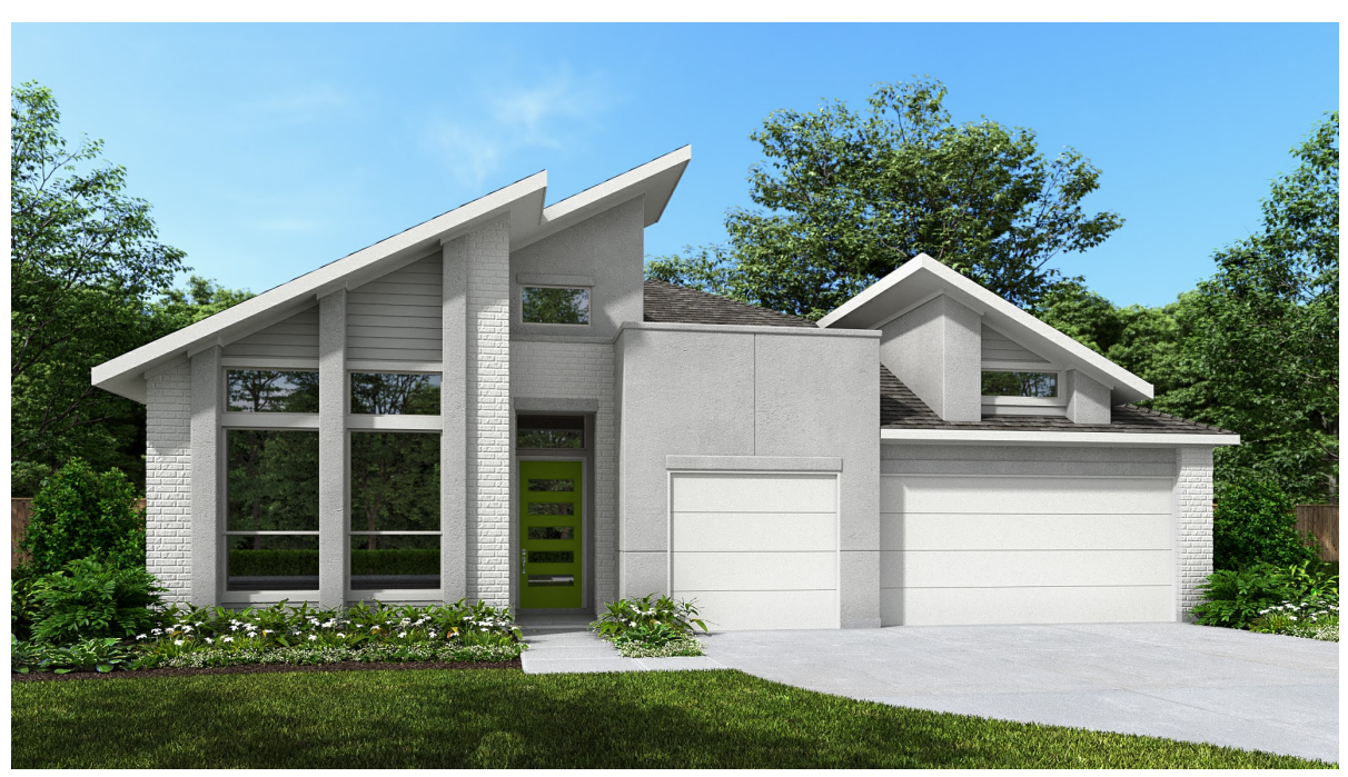
DESIGN 2953E E-30