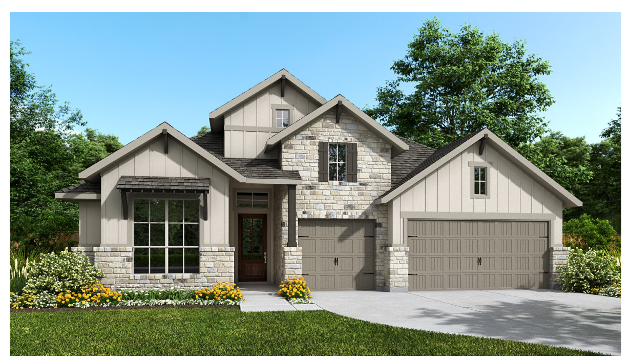
DESIGN 2953E E-1