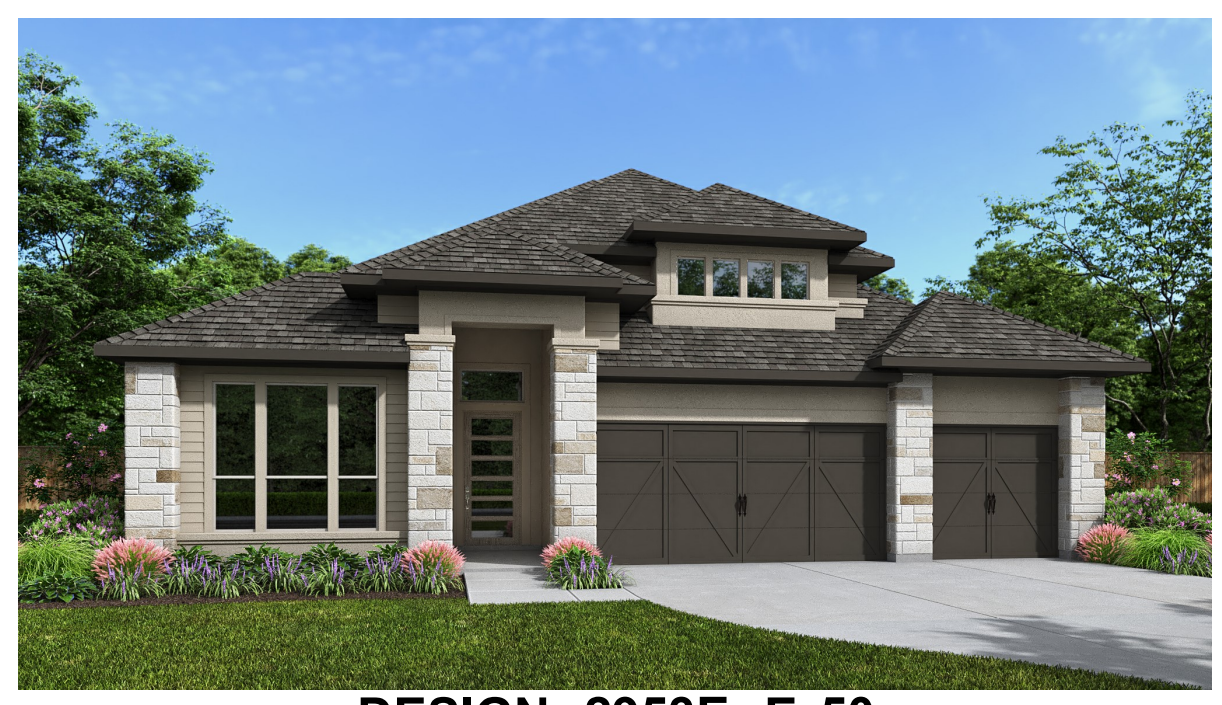
DESIGN 2953E E-50

This design, as originally designed and prior to any changes you make, is estimated to yield approximately the number of square feet shown on page 1. All dimensions are approximate. Square footage may vary based on as-built dimensions, configurations, plan options and/or the method of calculation. Designs are not-to-scale, and are conceptual illustrations that may differ from construction plans or completed improvements. A design may depict features not available on all homesites or in all communities. Perry Homes reserves the right to make changes in plans and specifications, and to substitute material of similar quality. Prices, terms, promotions, plans, dimensions, features, options, amenities, elevations, designs, square footages, specifications, materials, and availability of homes or communities change without notice or obligation. All obligations will be governed by a written contract. This design does not constitute a commitment to build a particular floor plan or home in any given community. Some floor plans, options, and/or elevations may not be available on certain homesites or in a particular community and may require additional charges. Please check with Perry Homes to verify current offerings in the communities you are considering. This rendering is the property of Perry Homes. LLC. Any reproduction or exhibition is strictly prohibited. © Perry Homes. LLC 2025