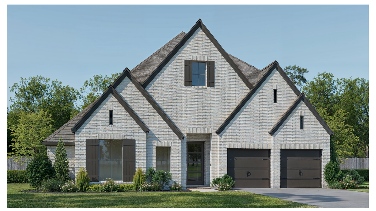
DESIGN 3118P E-1