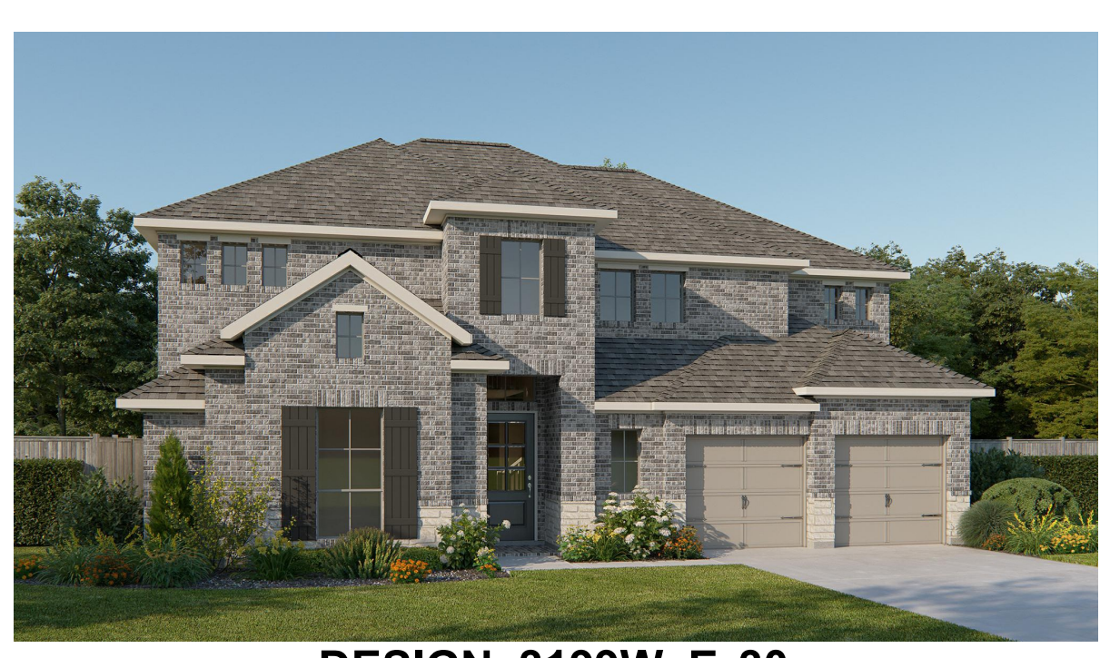
DESIGN 3199W E-30

This design, as originally designed and prior to any changes you make, is estimated to yield approximately the number of square feet shown on page 1. All dimensions are approximate. Square footage may vary based on as-built dimensions, configurations, plan options and/or the method of calculation. Designs are not-to-scale, and are conceptual illustrations that may differ from construction plans or completed improvements. A design may depict features not available on all homesites or in all communities. Perry Homes reserves the right to make changes in plans and specifications, and to substitute material of similar quality. Prices, terms, promotions, plans, dimensions, features, options, amenities, elevations, designs, square footages, specifications, materials, and availability of homes or communities to change without notice or obligation. All obligations will be governed by a written contract. This design does not constitute a commitment to build a particular floor plan or home in any given community. Some floor plans, options, and/or elevations may not be available on certain homesites or in a particular community and may require additional charges. Please check with Perry Homes to verify current offerings in the communities on are considering. This rendering is the property of Perry Homes. LLC. Any reproduction or exhibition is strictly prohibited @ Perry Homes LLC. 2019