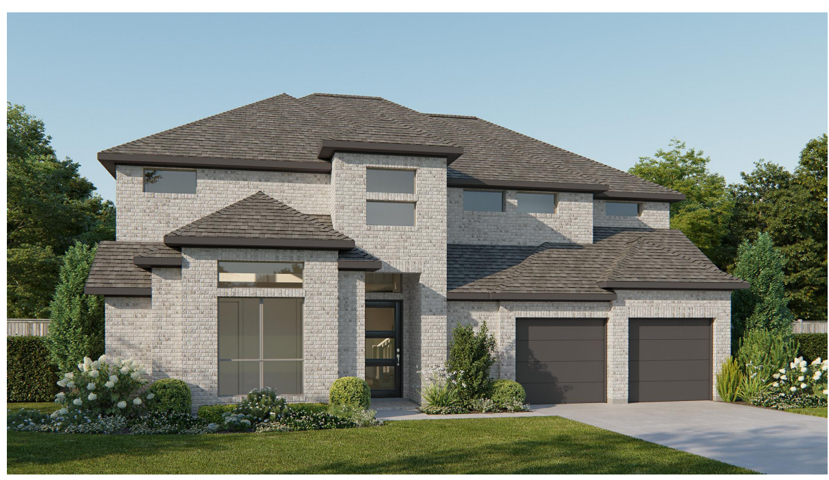
DESIGN 3199W E-1