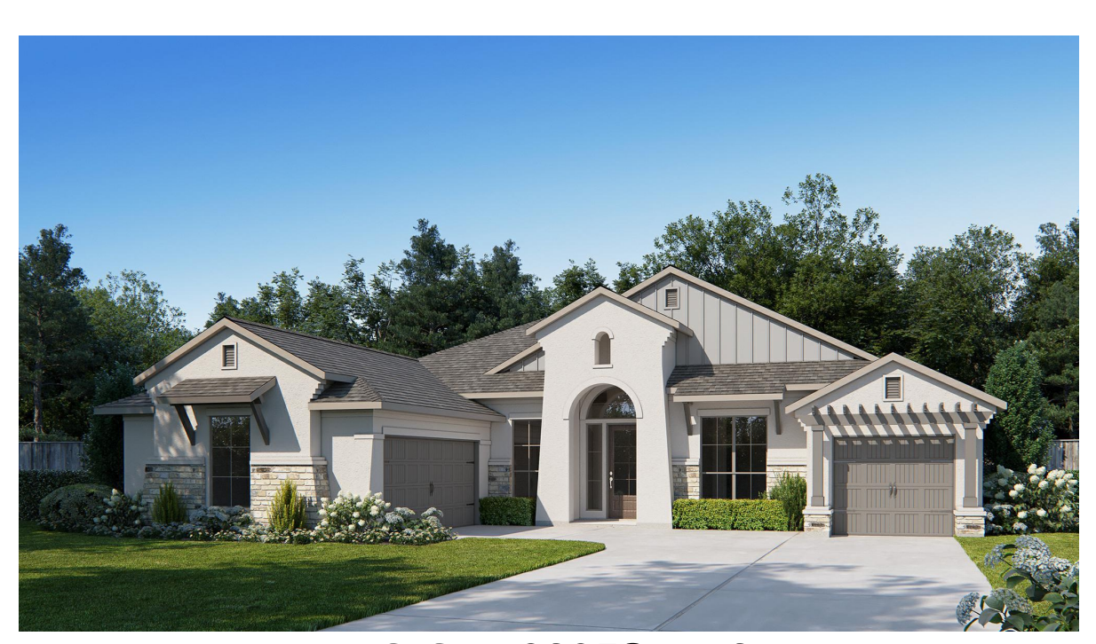
DESIGN 3205S E-2

This design, as originally designed and prior to any changes you make, is estimated to yield approximately the number of square feet shown on page 1. All dimensions are approximate. Square footage may vary based on as-built dimensions, configurations, plan options and/or the method of calculation. Designs are not-to-scale, and are conceptual illustrations that may differ from construction plans or completed improvements. A design may depict features not available on all homesites or in all communities. Perry Homes reserves the right to make changes in plans and specifications, and to substitute material of similar quality. Prices, terms, promotions, plans, dimensions, features, options, amenities, elevations, designs, square footages, specifications, materials, and availability of homes or communities elevations, designs without notice or obligation. All obligations will be governed by a written contract. This design does not constitute a commitment to build a particular floor plan or home in any given community. Some floor plans, options, and/or elevations may not be available on certain homesic or in a particular community and may require additional charges. Please check with Perry Homes to verify current offerings in the communities you are considering. This rendering is the property of Perry Homes. LLC. Any reproduction or exhibition is strictly prohibited. © Perry Homes, LLC 2024