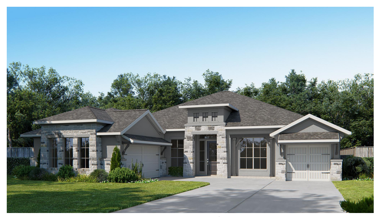
DESIGN 3205S E-1