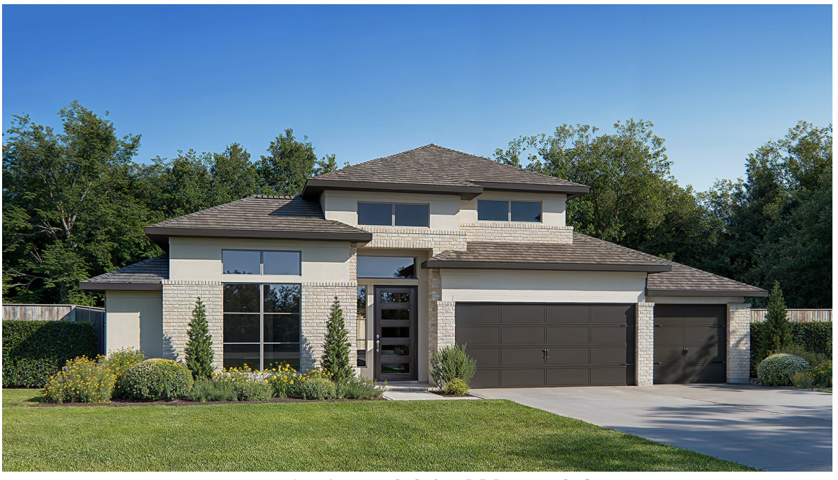
DESIGN 3295W E-31

*See Page 3 for Details and Disclaimers | © Perry Homes, LLC 2024 | 8/12/2024 3:12:11 PM (65' CL) PerryHomes.com