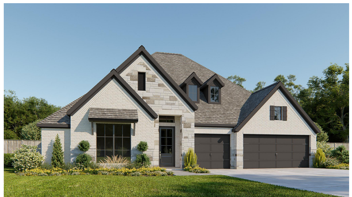
DESIGN 3295W E-30