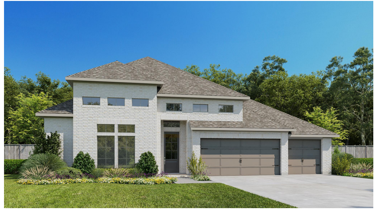
DESIGN 3295W E-1