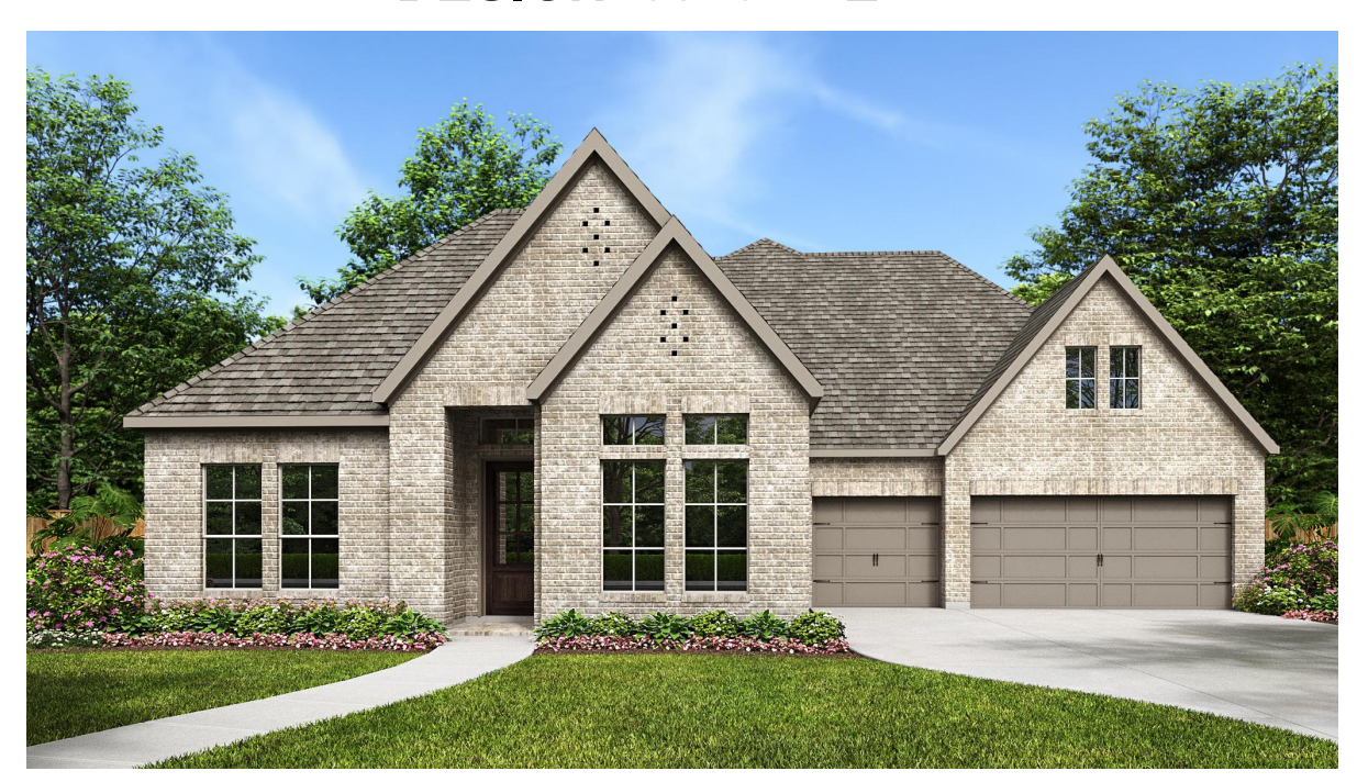
DESIGN 3310W E-30