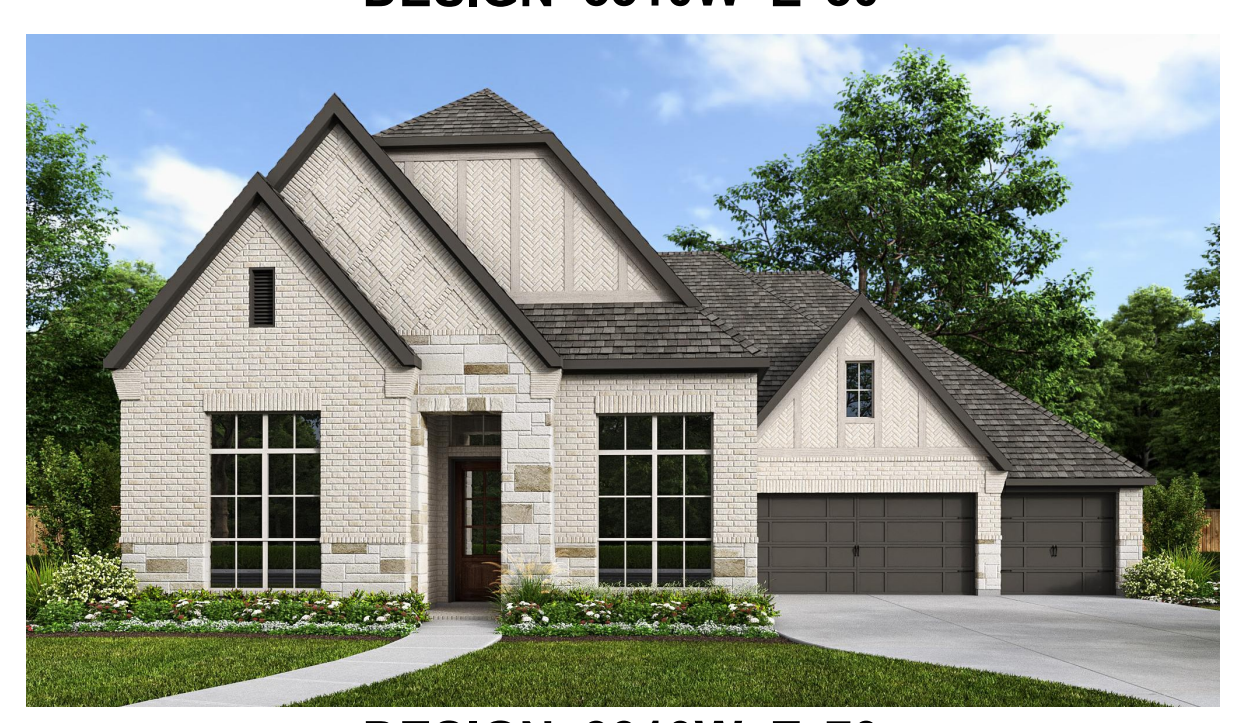
DESIGN 3310W E-70

This design, as originally designed and prior to any changes you make, is estimated to yield approximately the number of square feet shown on page 1. All dimensions are approximate. Square footage may vary based on as-built dimensions, configurations, plan options and/or the method of calculation. Designs are not-to-scale, and are conceptual illustrations that may differ from construction plans or completed improvements. A design may depict features not available on all homesites or in all communities. Perry Homes reserves the right to make changes in plans and specifications, and to substitute material of similar quality. Prices, terms, promotions, plans, dimensions, features, options, amenities, elevations, designs, square footages, specifications, materials, and availability of homes or communities to change without notice or obligation. All obligations will be governed by a written contract. This design does not constitute a commitment to build a particular floor plan or home in any given community. Some floor plans, options, and/or elevations may not be available on certain homesites or in a particular community and may require additional charges. Please check with Perry Homes to verify current offerings in the communities on are considering. This rendering is the property of Perry Homes. LLC. Any reproduction or exhibition is strictly prohibited @ Perry Homes LLC. 2019.