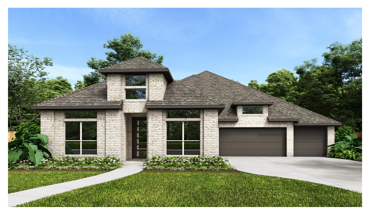
DESIGN 3310W E-1