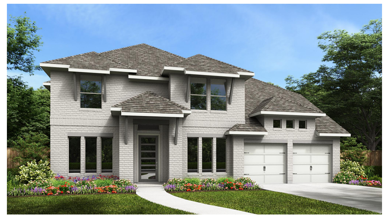
DESIGN 3398W E-1