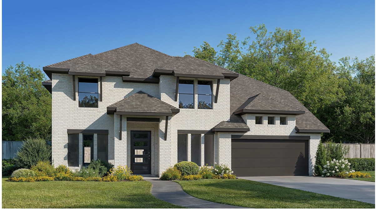
DESIGN 3398W E-6