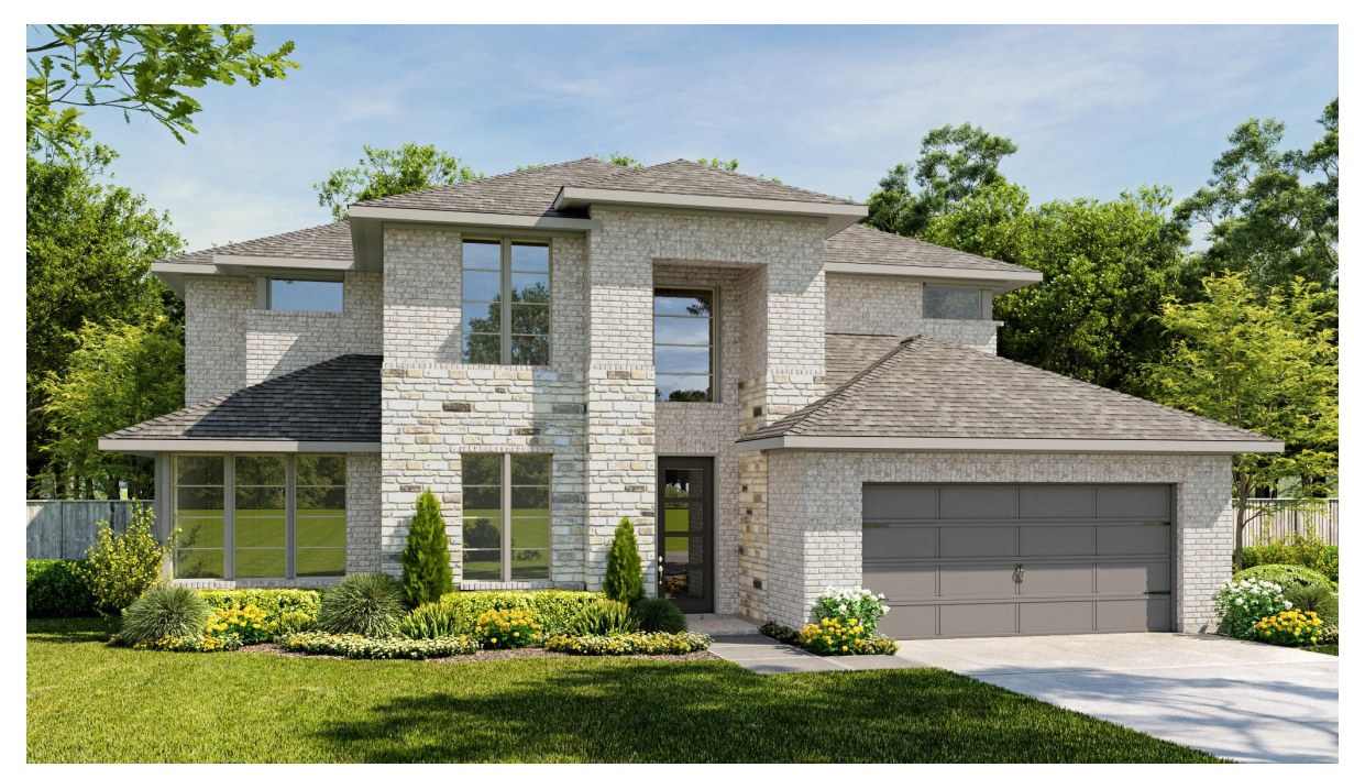
DESIGN 3399P E-1