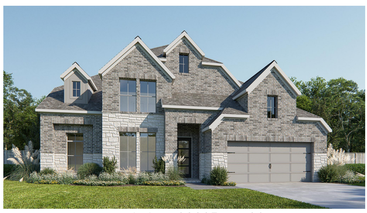
DESIGN 3399P E-30

This design, as originally designed and prior to any changes you make, is estimated to yield approximately the number of square feet shown on page 1. All dimensions are approximate. Square footage may vary based on as-built dimensions, configurations, plan options and/or the method of calculation. Designs are not-to-scale, and are conceptual illustrations that may differ from construction plans or completed improvements. A design may depict features not available on all homesites or in all communities. Perry Homes reserves the right to make changes in plans and specifications, and to substitute material of similar quality. Prices, terms, promotions, plans, dimensions, features, options, amenities, elevations, designs, square footages, specifications, materials, and availability of homes or communities are subject to change without notice or obligation. All obligations will be governed by a written contract. This design does not constitute a commitment to build a particular floor plan or home in any given community Some floor plans, options, and/or elevations may not be available on certain homesites or in a particular community and may require additional charges. Please check with Perry Homes to verify current offerings in the communities are considering. This rendering is the property of Perry Homes. LLC. Any reproduction or exhibition is strictly prohibited @ Perry Homes LLC. 2023