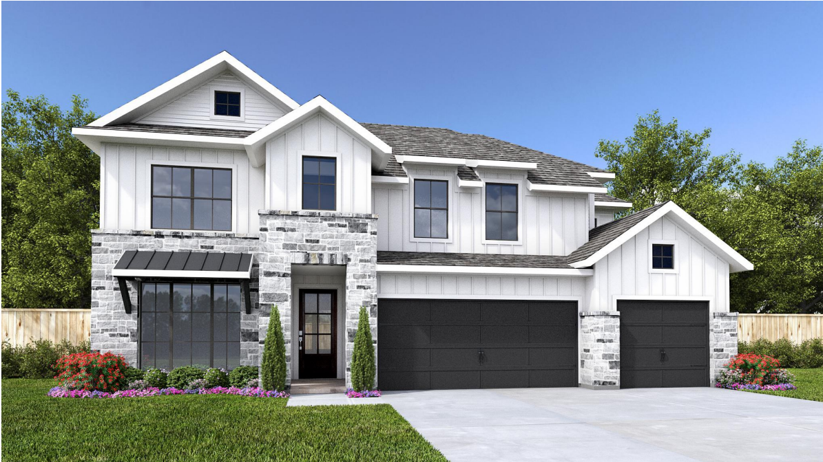
DESIGN 3413E E-1