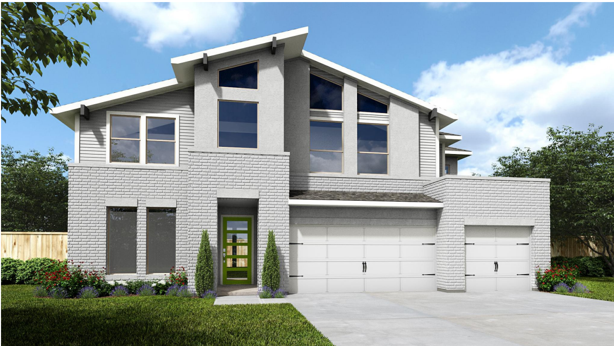
DESIGN 3413E E-30