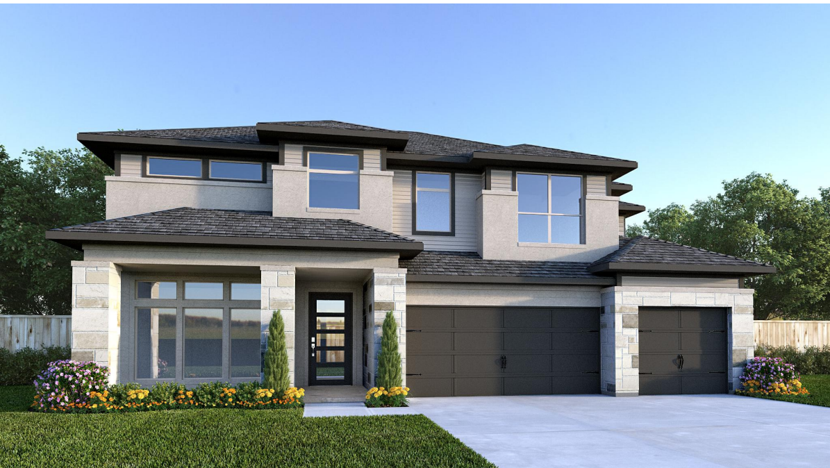
DESIGN 3413E E-50

This design, as originally designed and prior to any changes you make, is estimated to yield approximately the number of square feet shown on page 1. All dimensions are approximate. Square footage may vary based on as-built dimensions, configurations, plan options and/or the method of calculation. Designs are not-to-scale, and are conceptual illustrations that may differ from construction plans or completed improvements. A design may depict features not available on all homesites or in all communities. Perry Homes reserves the right to make changes in plans and specifications, and to substitute material of similar quality. Prices, terms, promotions, plans, dimensions, features, options, amenities, elevations, designs, square footages, specifications, materials, and availability of homes or communities are subject to change without notice or obligation. All obligations will be governed by a written contract. This design does not constitute a commitment to build a particular floor plan or home in any given community. Some floor plans, options, and/or elevations may not be available on certain homesites or in a particular community and may require additional charges. Please check with Perry Homes to verify current offerings in the communities you are considering. This rendering is the property of Perry Homes, LLC. Any reproduction or exhibition is strictly prohibited. © Perry Homes, LLC 2023