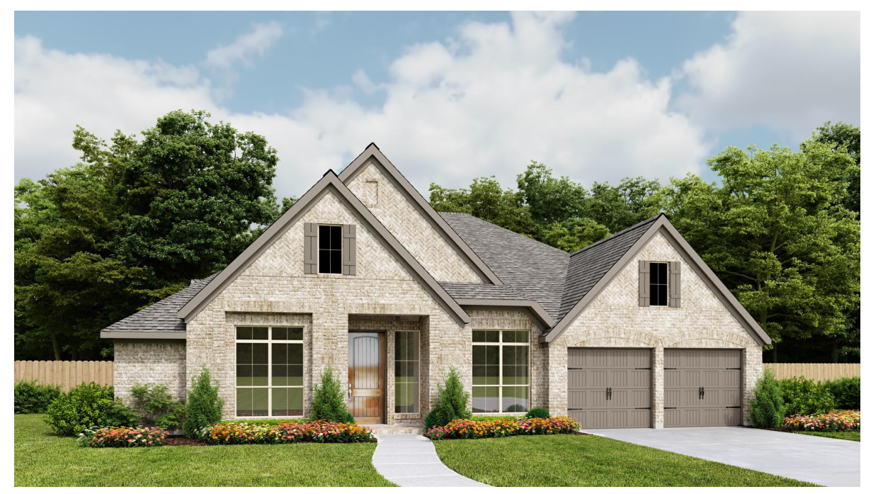
DESIGN 3465W E-1