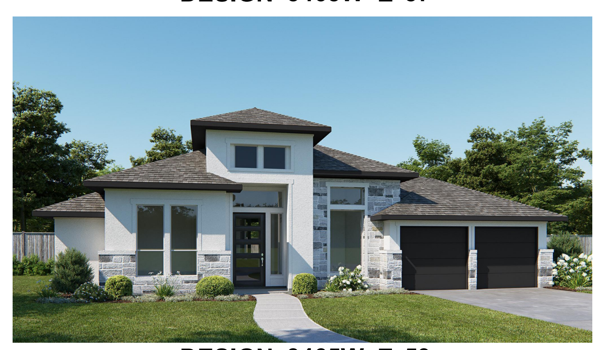
DESIGN 3465W E-59

This design, as originally designed and prior to any changes you make, is estimated to yield approximately the number of square feet shown on page 1. All dimensions are approximate. Square footage may vary based on as-built dimensions, configurations, plan options and/or the method of calculation. Designs are not-to-scale, and are conceptual illustrations that may differ from construction plans or completed improvements. A design may depict features not available on all homesites or in all communities. Perry Homes reserves the right to make changes in plans and specifications, and to substitute material of similar quality. Prices, terms, promotions, plans, dimensions, features, options, amenities, elevations, designs, square footages, specifications, materials, and availability of homes or communities to change without notice or obligation. All obligations will be governed by a written contract. This design does not constitute a commitment to build a particular floor plan or home in any given community. Some floor plans, options, and/or elevations may not be available on certain homesites or in a particular community and may require additional charges. Please check with Perry Homes to verify current offerings in the communities and are considering. This rendering is the property of Perry Homes. LLC. Any reproduction or exhibition is strictly prohibited @ Perry Homes LLC. 2019.