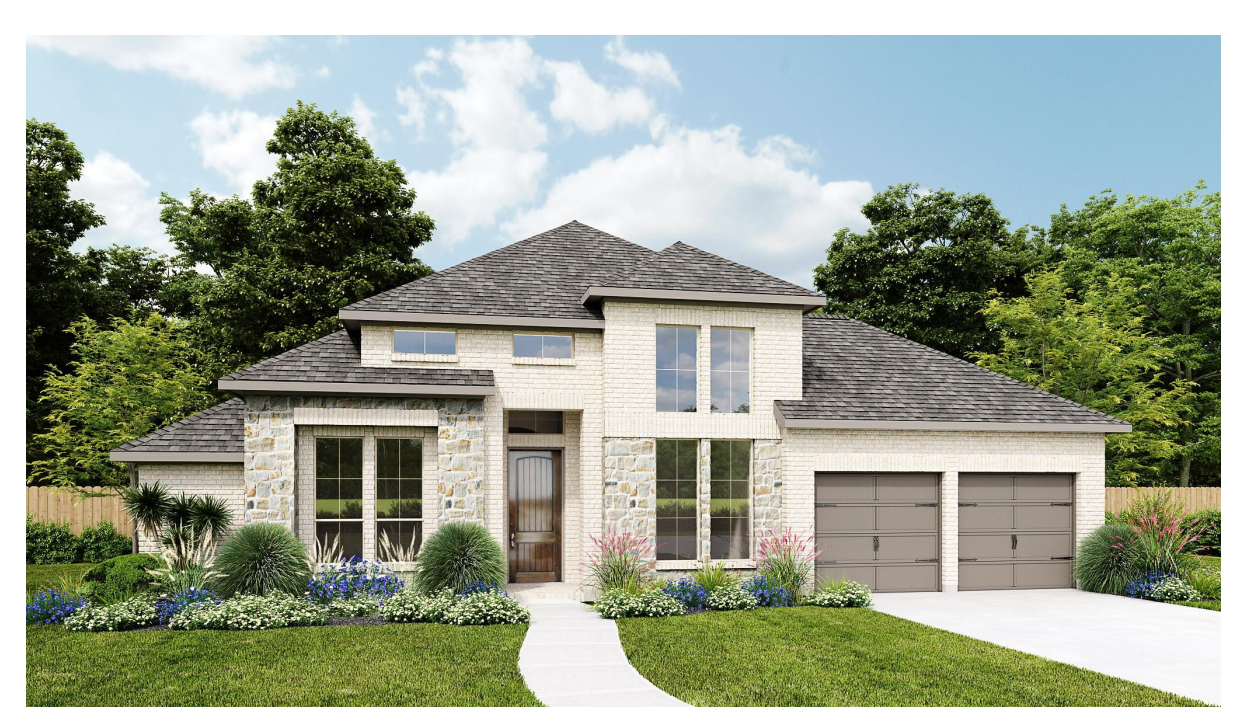
DESIGN 3465W E-57