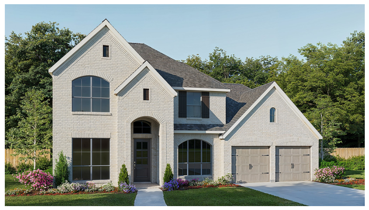
DESIGN 3546W E-1