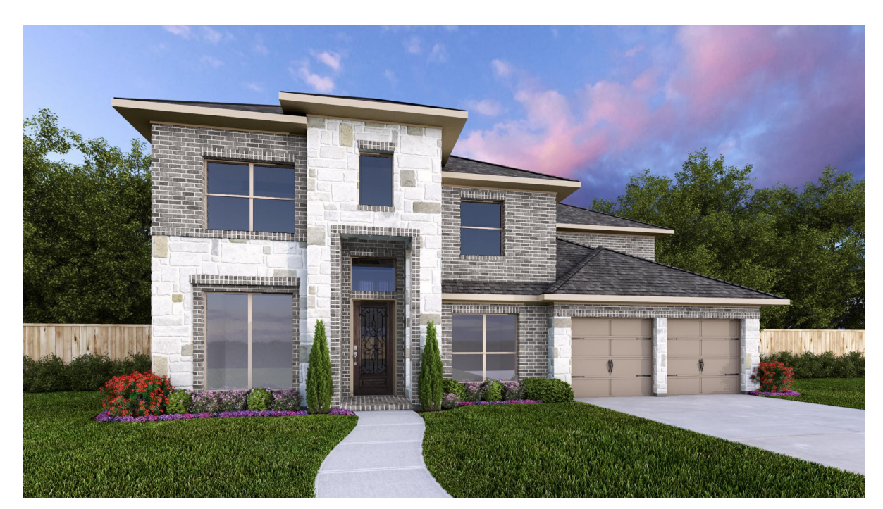
DESIGN 3546W E-31