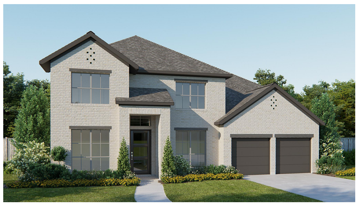
DESIGN 3546W E-32