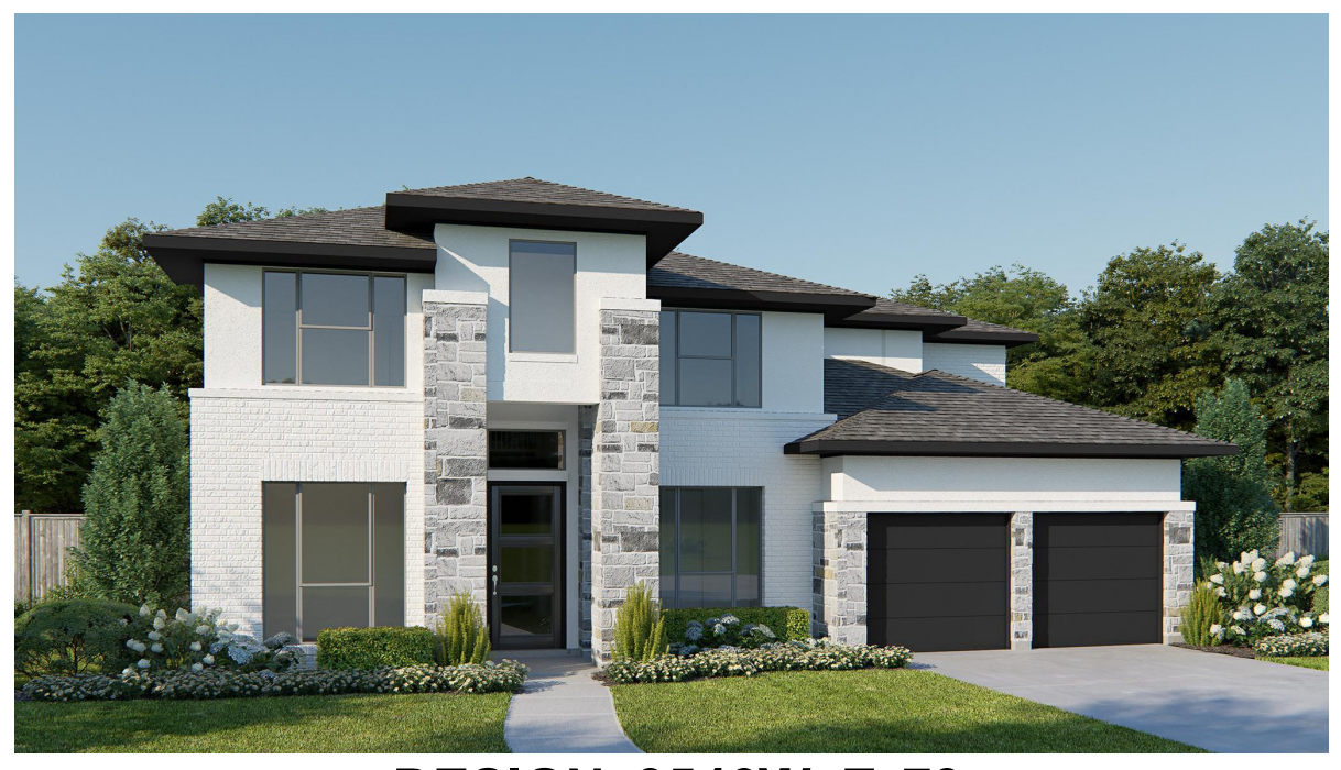
DESIGN 3546W E-73

This design, as originally designed and prior to any changes you make, is estimated to yield approximately the number of square feet shown on page 1. All dimensions are approximate. Square footage may vary based on as-built dimensions, configurations, plan options and/or the method of calculation. Designs are not-to-scale, and are conceptual illustrations that may differ from construction plans or completed improvements. A design may depict features not available on all homesites or in all communities. Perry Homes reserves the right to make changes in plans and specifications, and to substitute material of similar quality. Prices, terms, promotions, plans, dimensions, features, options, amenities, elevations, designs, square footages, specifications, materials, and availability of homes or communities to change without notice or obligation. All obligations will be governed by a written contract. This design does not constitute a commitment to build a particular floor plan or home in any given community. Some floor plans, options, and/or elevations may not be available on certain homesites or in a particular community and may require additional charges. Please check with Perry Homes to verify current offerings in the communities and are considering. This rendering is the property of Perry Homes. LLC. Any reproduction or exhibition is strictly prohibited @ Perry Homes LLC. 2019.