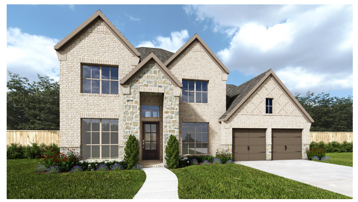
DESIGN 3546W E-51