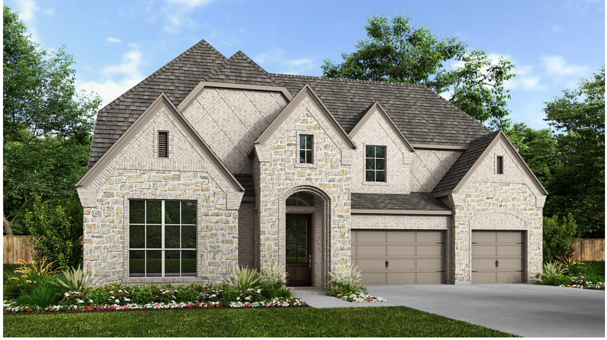
DESIGN 3896W E-50