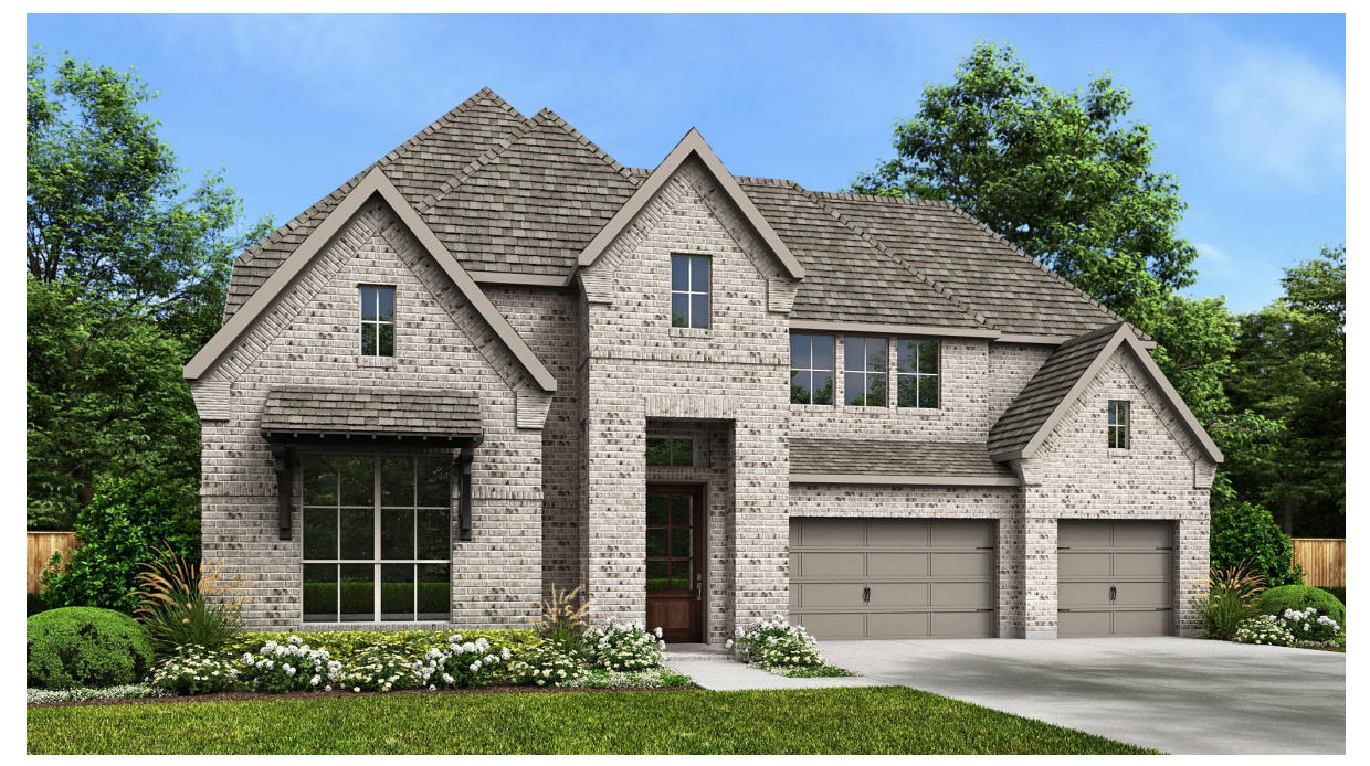
DESIGN 3896W E-1