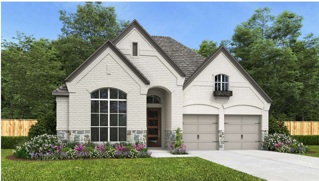
Design 404A E-1