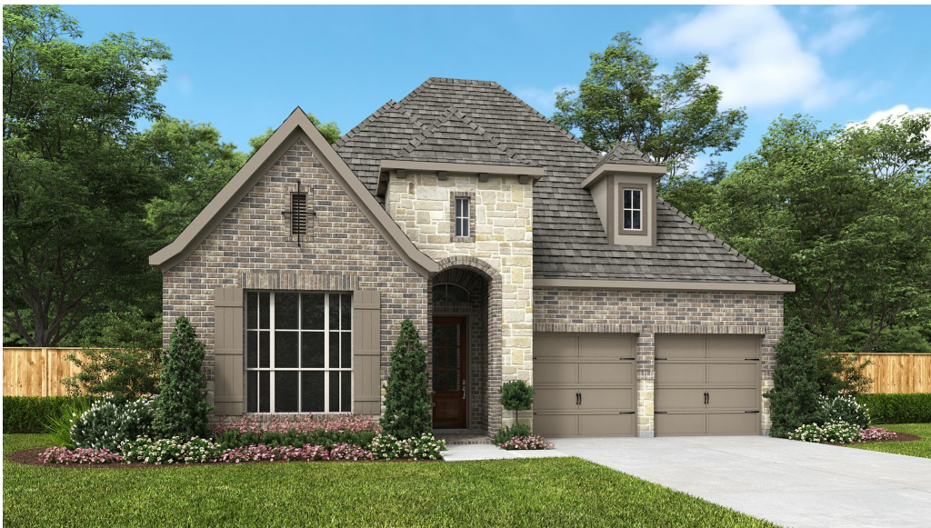
Design 404A E-2