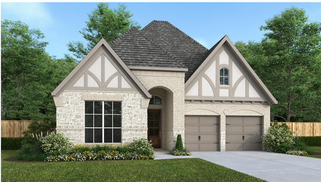
Design 404A E-3