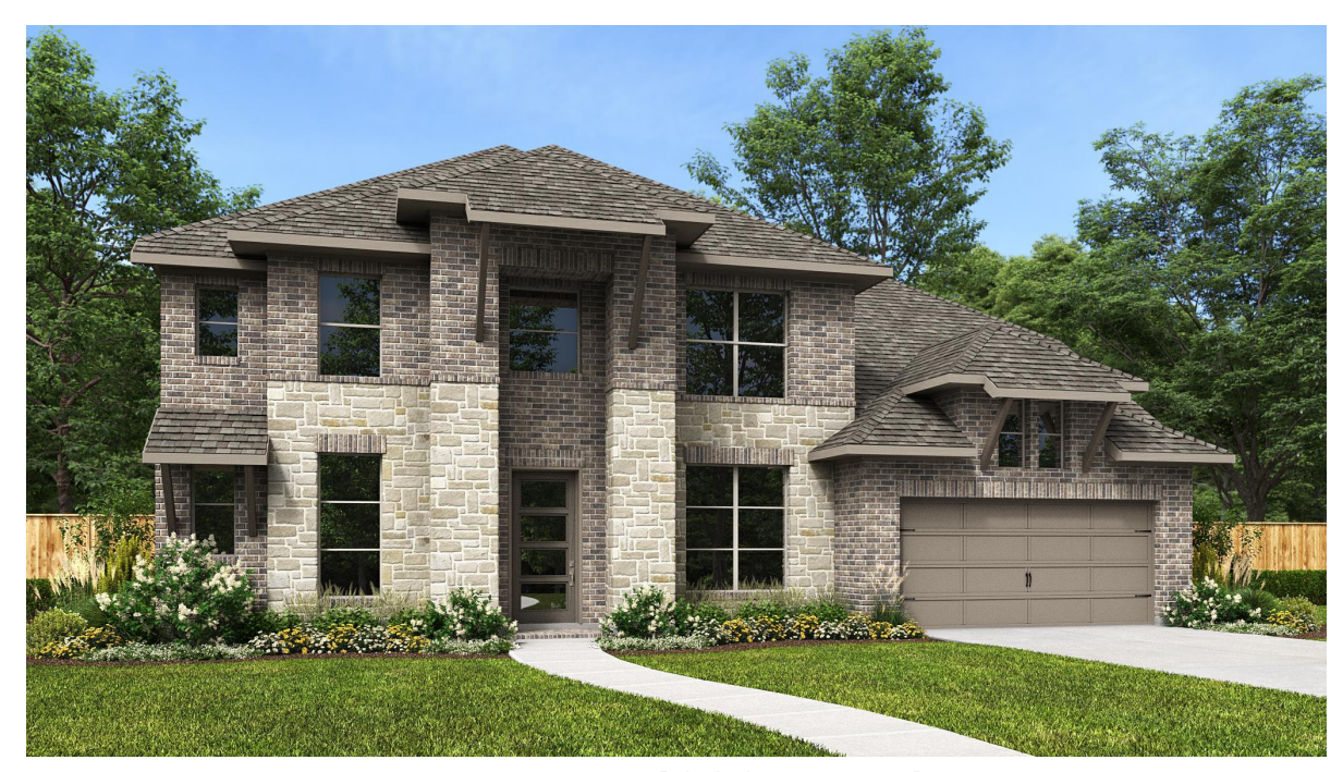
DESIGN 4098P E-1