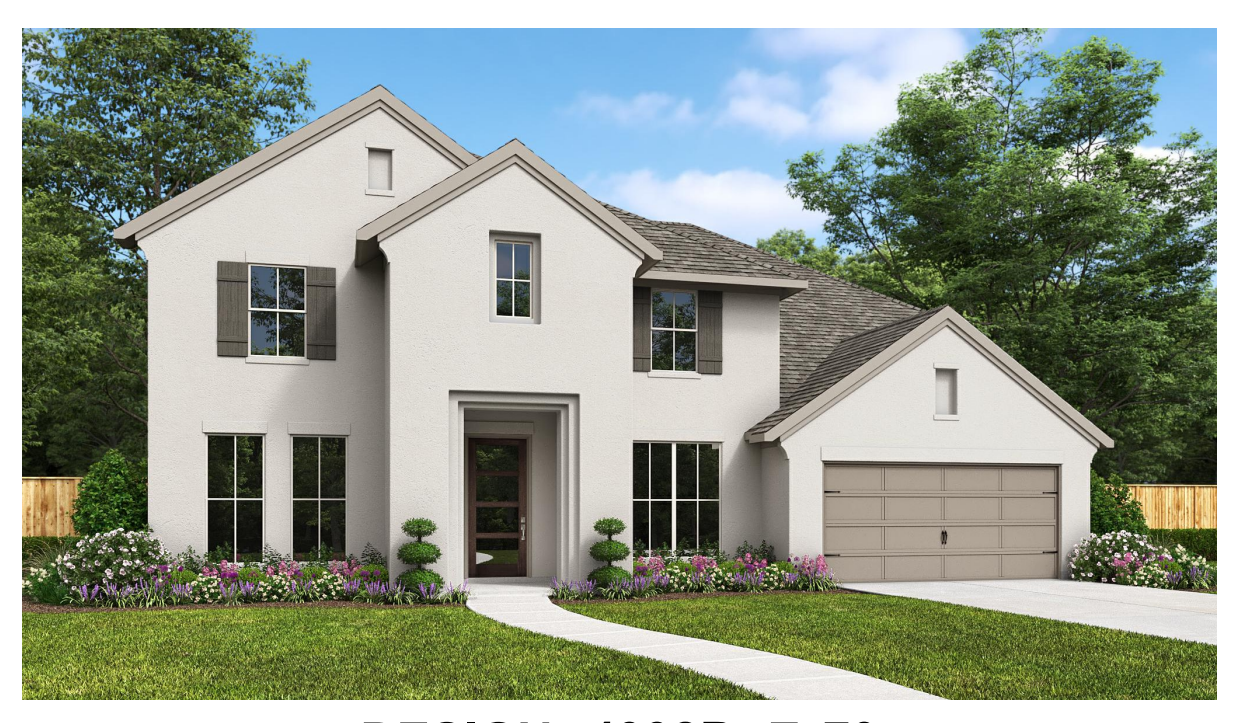
DESIGN 4098P E-70

In sesign, as originary designed and prior to any charges you make, is estimated to yield approximately fire further of square reox, stourn of page 1. All dimensions are approximate. Square rook vary based on as-built dimensions, configurations, plan options and/or the method of calculation. Designs are not-to-scale, and are conceptual illustrations that may depict features not available on all homesites or in all communities. Perry Homes reserves the right to make changes in plans and specifications, and to substitute material of similar quality. Prices, terms, promotions, plans, dimensions, features, options, amenities, elevations, designs, square footages, specifications, materials, and availability of homes or communities are subject to change without notice or obligation. All obligations will be governed by a written contract. This design does not constitute a commitment to build a particular floor plan or home in any given community. Some floor plans, options, and/or elevations may not be available on certain homesites or in a particular community and may require additional charges. Please check with Perry Homes to verify current offerings in the communities you are considering. This rendering is the property of Perry Homes, LLC. Any reproduction or exhibition is strictly prohibited. © Perry Homes, LLC 2023