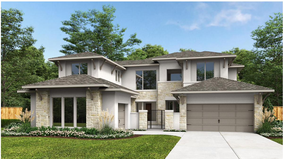
DESIGN 4599S E-50

This design, as originally designed and prior to any changes you make, is estimated to yield approximately the number of square feet shown on page 1. All dimensions are approximate. Square footage may vary based on as-built dimensions, configurations, plan options and/or the method of calculation. Designs are not-to-scale, and are conceptual illustrations that may differ from construction plans or completed improvements. A design may depict features not available on all homesites or in all communities. Perry Homes reserves the right to make changes in plans and specifications, and to substitute material of similar quality. Prices, terms, promotions, plans, dimensions, features, options, amenities, elevations, designs, square footages, specifications, materials, and availability of homes or communities are subject to change without notice or obligation. All obligations will be governed by a written contract. This design does not constitute a commitment to build a particular floor plan or home in any given community. Some floor plans, options, and/or elevations may not be available on certain homesites or in a particular community and may require additional charges. Please check with Perry Homes to verify current offerings in the communities you are considering. This rendering is the property of Perry Homes, LLC. Any reproduction or exhibition is strictly prohibited. © Perry Homes, LLC 2025