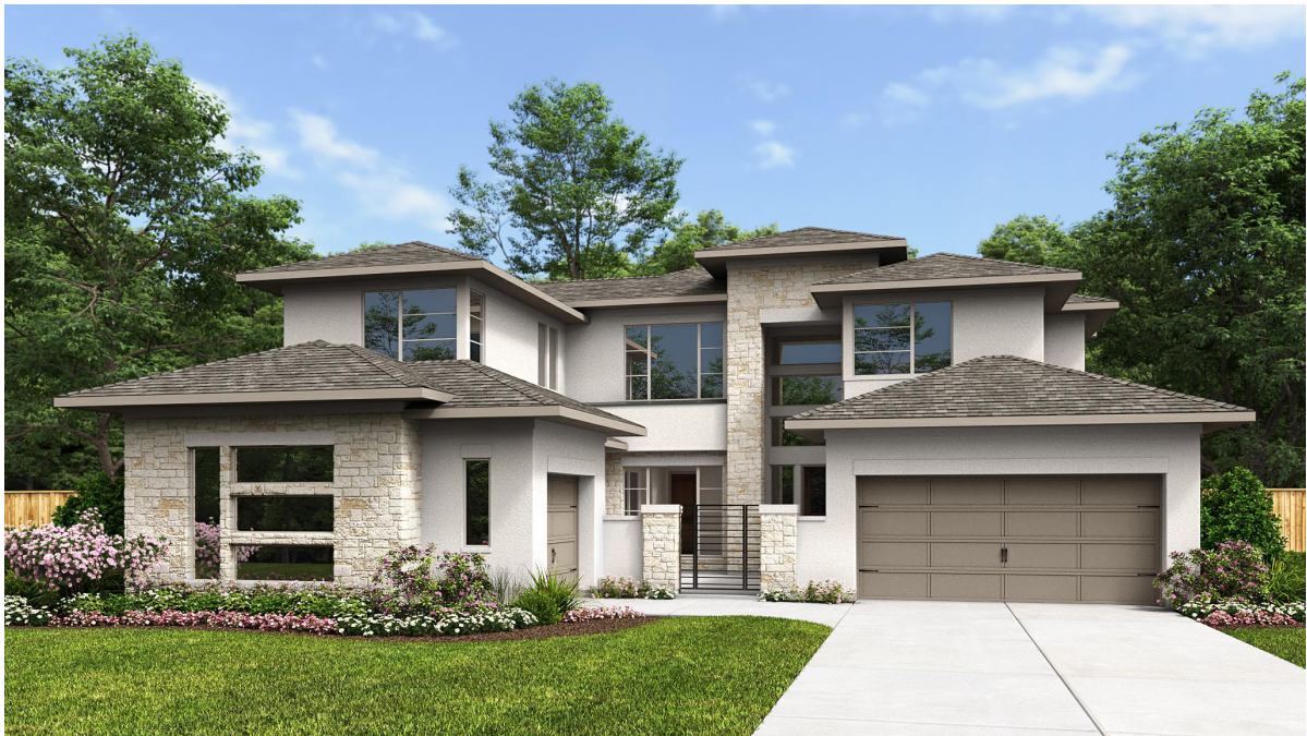
DESIGN 4599S E-1