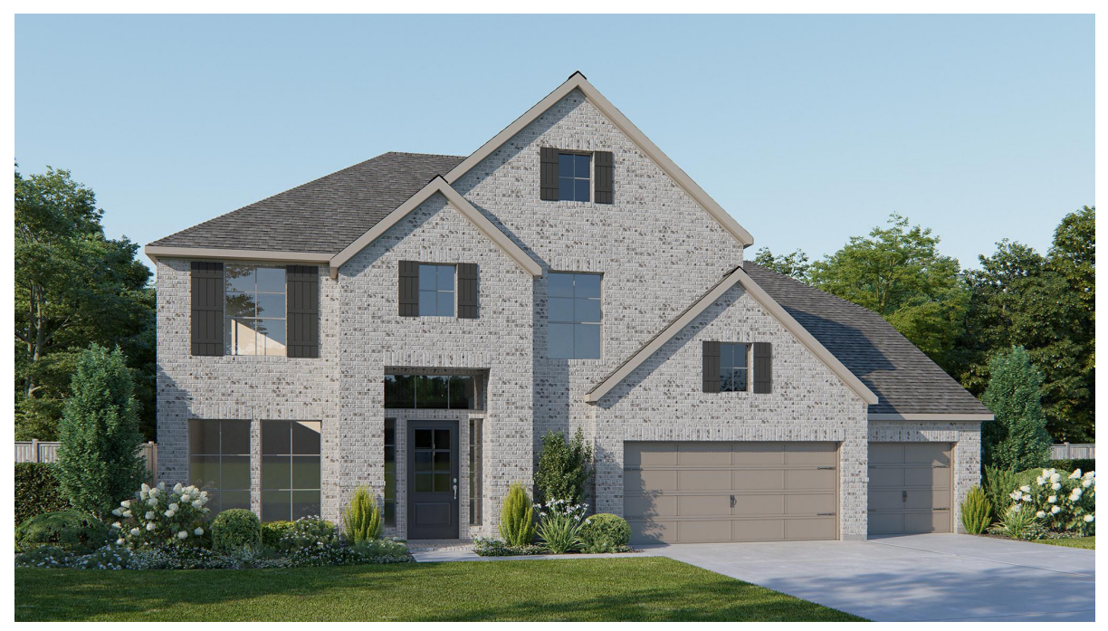
DESIGN 4773W E-1