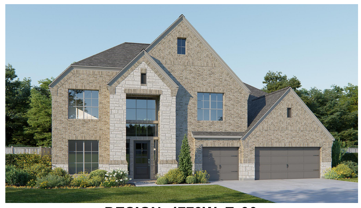
DESIGN 4773W E-90

This design, as originally designed and prior to any changes you make, is estimated to yield approximately the number of square feet shown on page 1. All dimensions are approximate. Square footage may vary based on as-built dimensions, configurations, plan options and/or the method of calculation. Designs are not-to-scale, and are conceptual illustrations that may differ from construction plans or completed improvements. A design may depict features not available on all homesites or in all communities. Perry Homes reserves the right to make changes in plans and specifications, and to substitute material of similar quality. Prices, terms, promotions, plans, dimensions, features, options, amenities, elevations, designs, square footages, specifications, materials, and availability of homes or communities to change without notice or obligation. All obligations will be governed by a written contract. This design does not constitute a commitment to build a particular floor plan or home in any given community. Some floor plans, options, and/or elevations may not be available on certain homesites or in a particular community and may require additional charges. Please check with Perry Homes to verify current offerings in the communities and are considering. This rendering is the property of Perry Homes. LLC. Any reproduction or exhibition is strictly prohibited @ Perry Homes LLC. 2019.