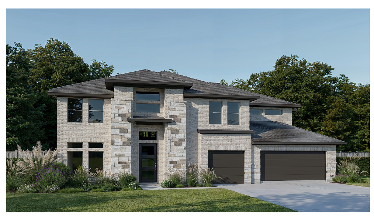
DESIGN 4773W E-70