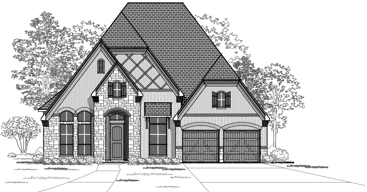
Design 523A E-100