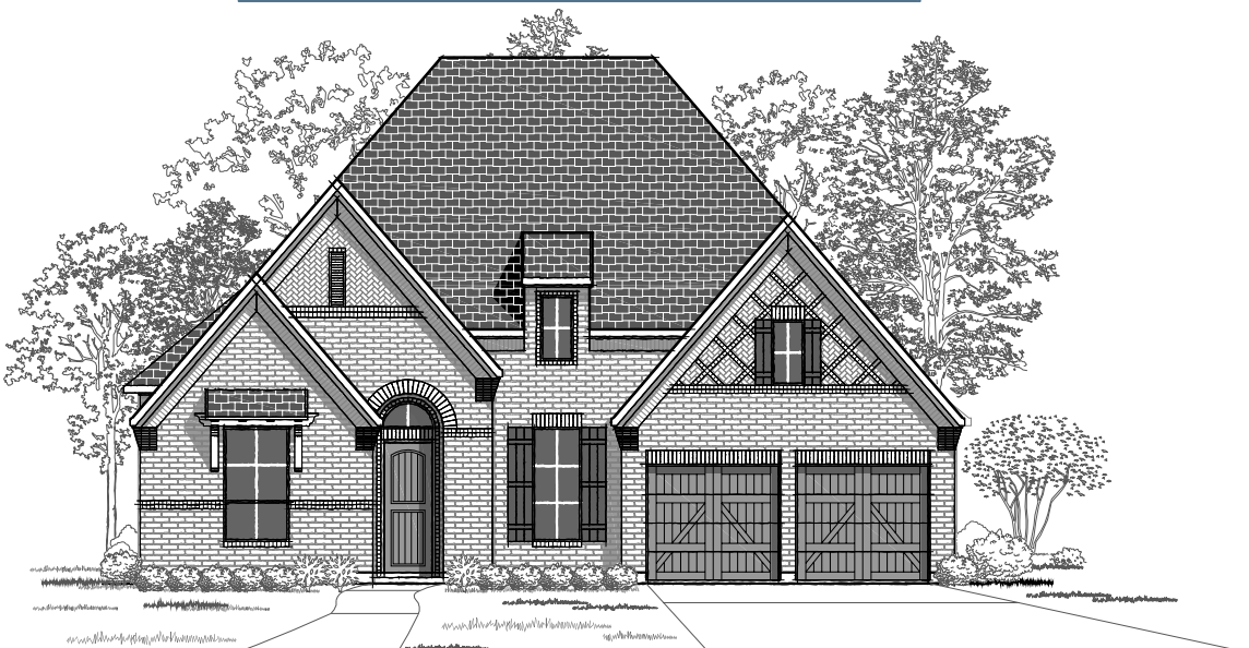
Design 523A E-1