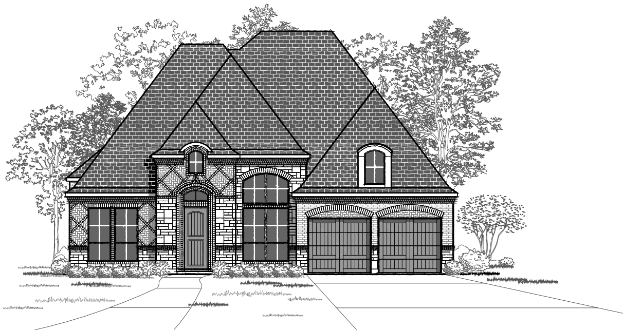
Design 523A E-50