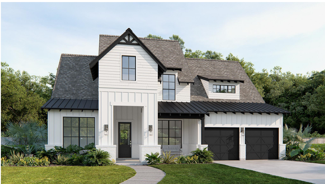
DESIGN 566A E-50

*See Elevation Page(s) for Details and Disclaimers. © Perry Homes, LLC 2024