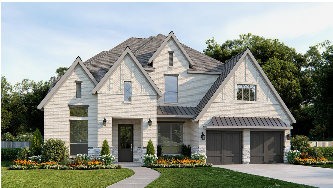
DESIGN 566A E-73

*See Elevation Page(s) for Details and Disclaimers. © Perry Homes, LLC 2024