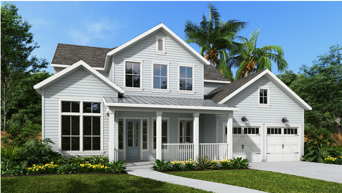
DESIGN 566A E-32