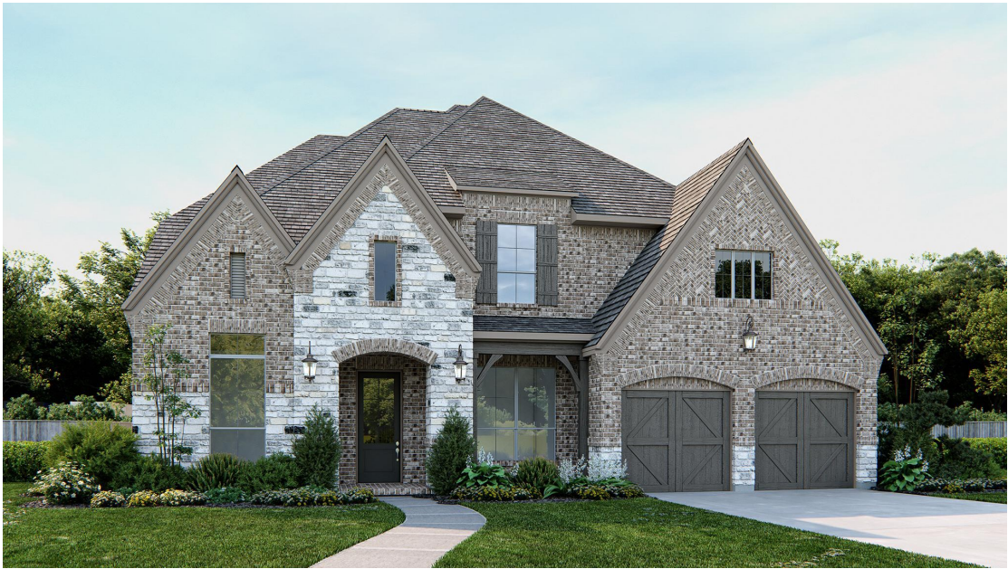
DESIGN 566A E-74