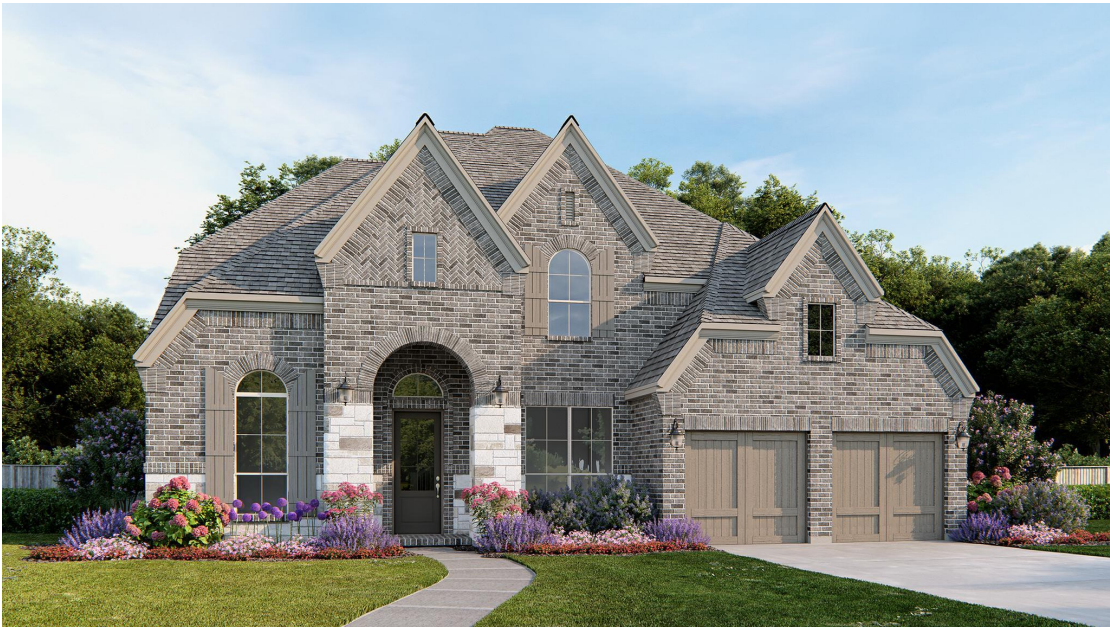
DESIGN 566A E-71