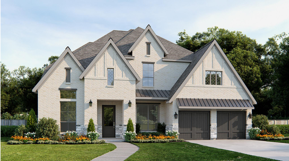
DESIGN 566A E-1