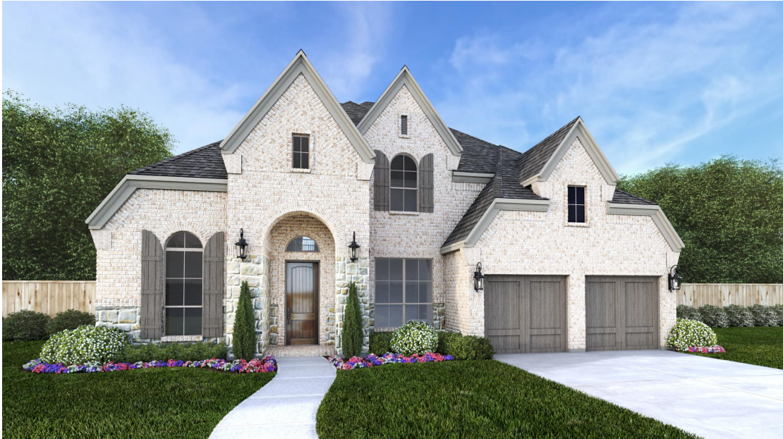
DESIGN 566A E-70