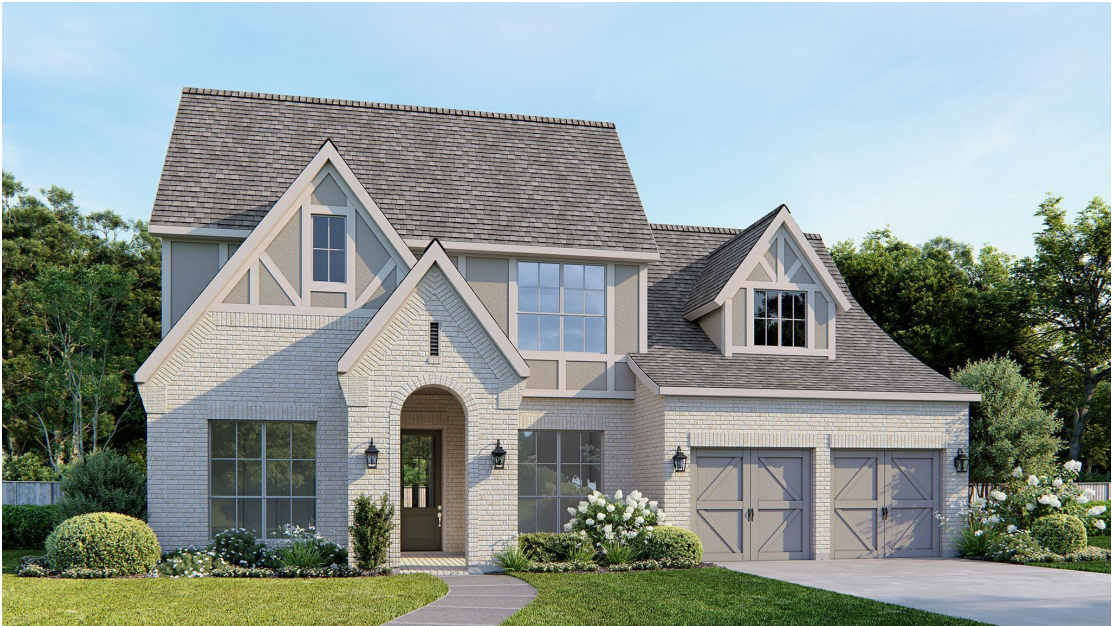
DESIGN 566A E-102