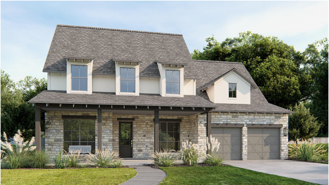
DESIGN 566A E-101