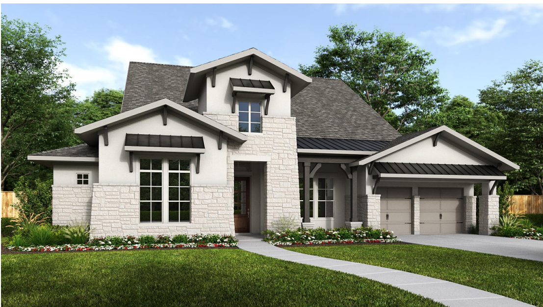
DESIGN 617A E-104

*See Elevation Page(s) for Details and Disclaimers. © Perry Homes, LLC 2023