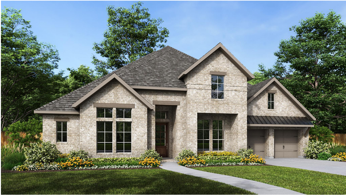
DESIGN 617A E-1