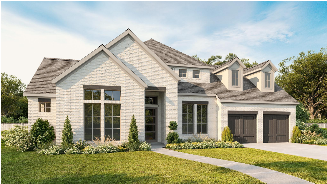
DESIGN 617A E-3