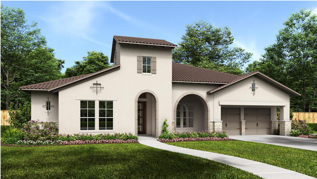
DESIGN 617A E-103