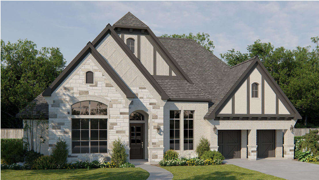
DESIGN 617A E-100