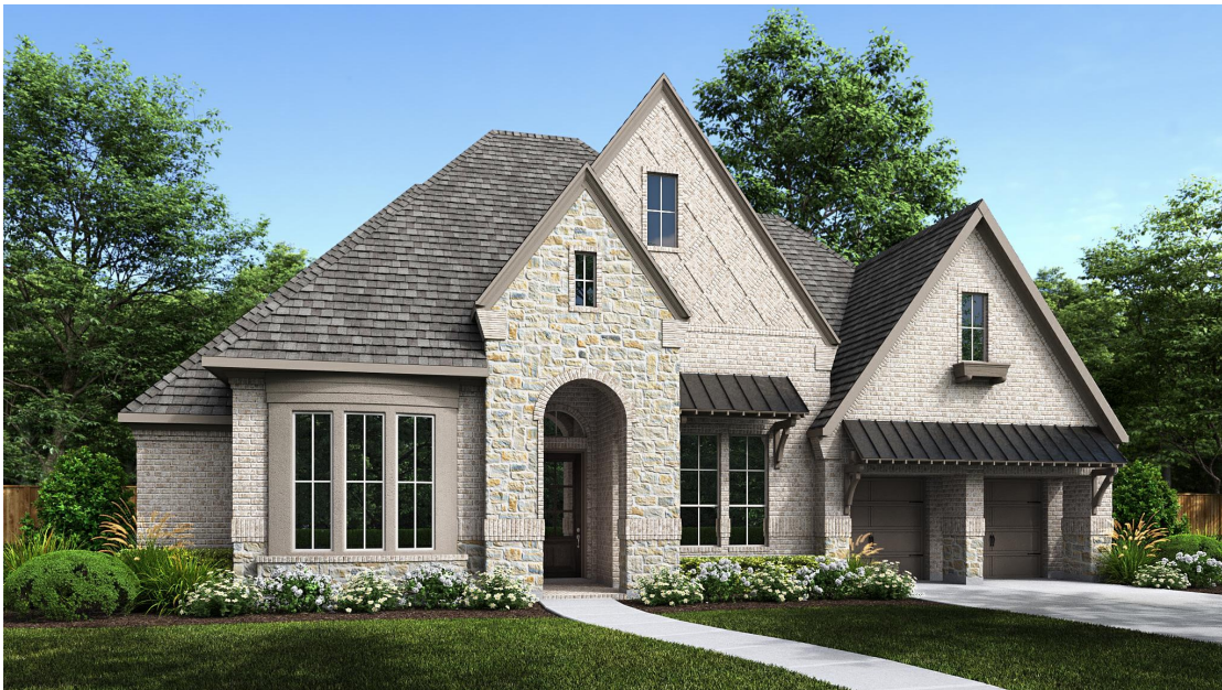
DESIGN 617A E-105