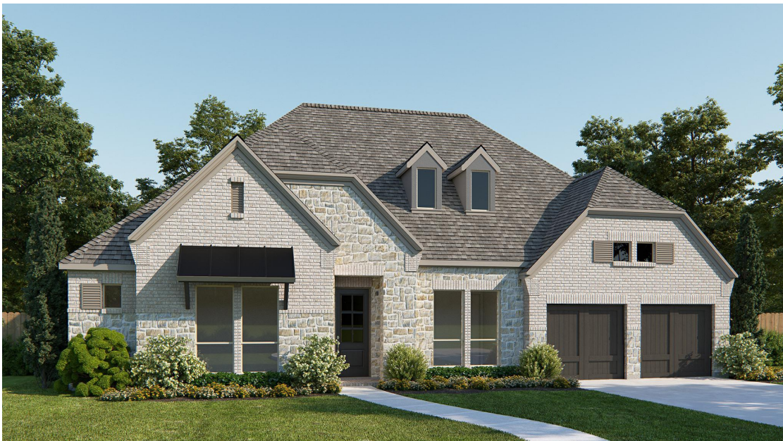
DESIGN 617A E-53